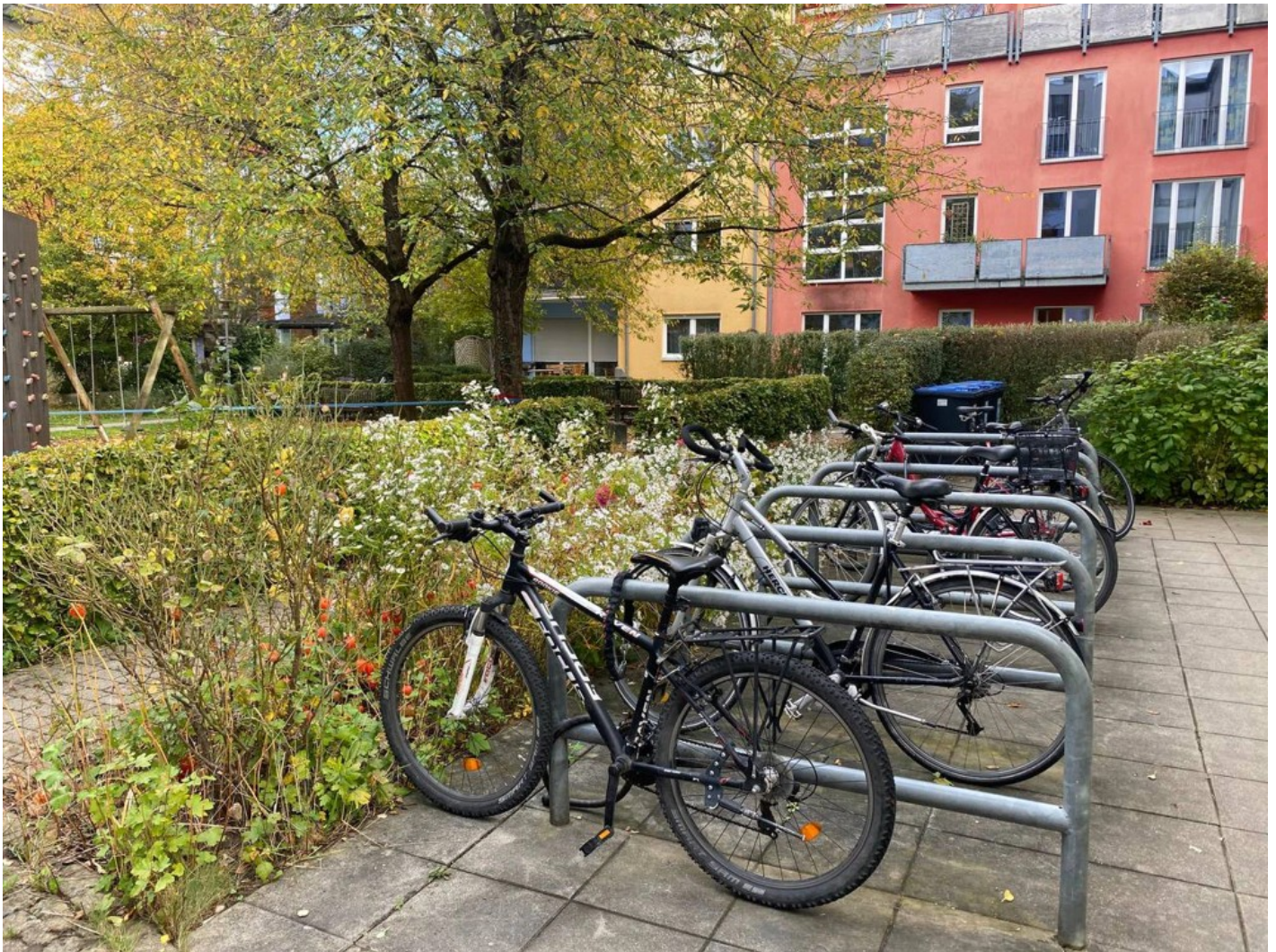
Urban & Community project 'IZYUM_recovery'