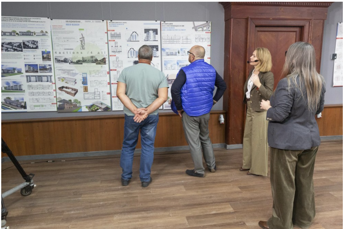
Urban & Community project 'IZYUM_recovery'