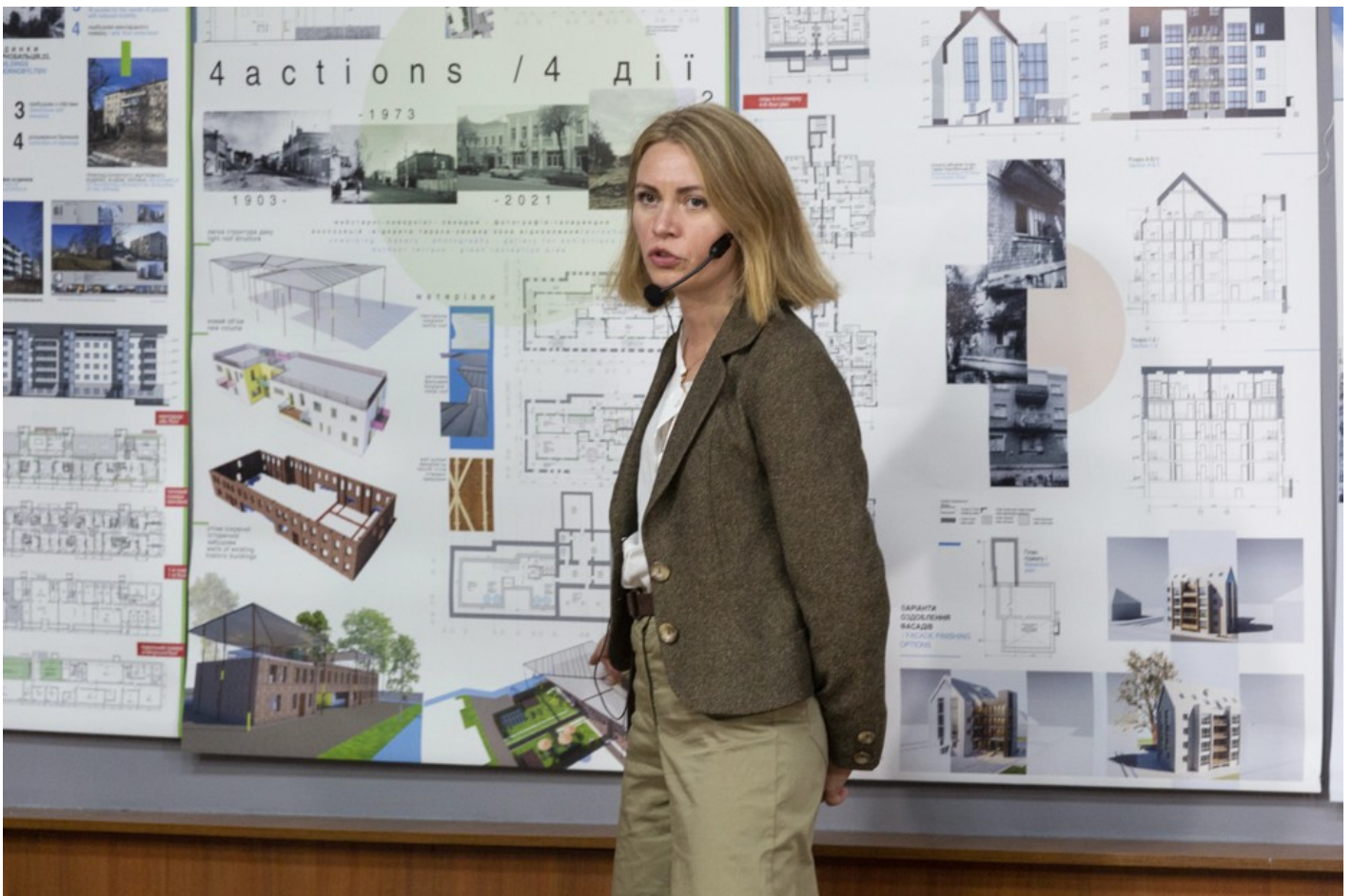
Urban & Community project 'IZYUM_recovery'