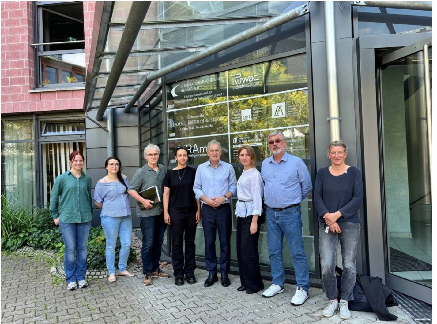
Urban & Community project 'IZYUM_recovery'