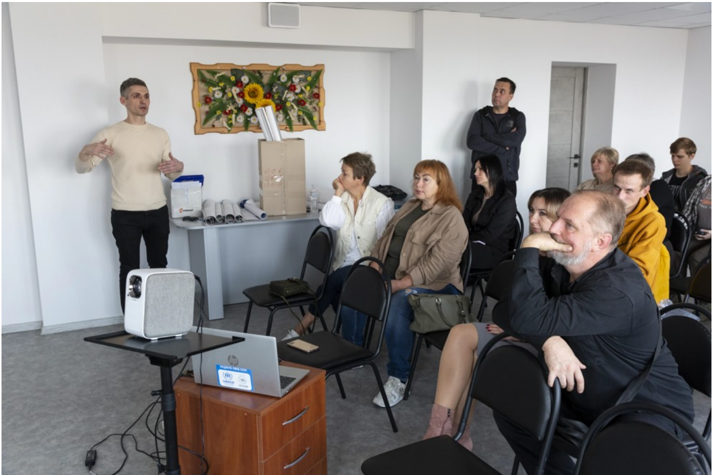
Urban & Community project 'IZYUM_recovery'