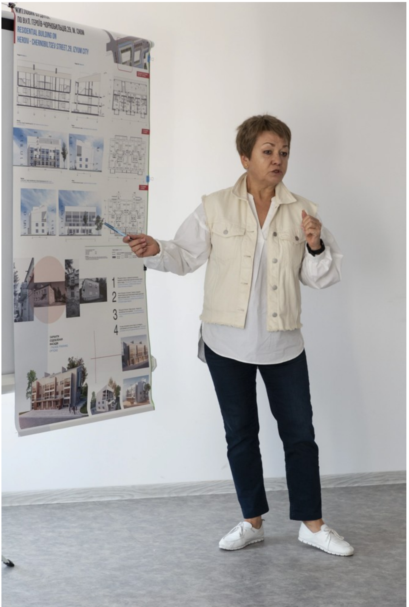
Urban & Community project 'IZYUM_recovery'