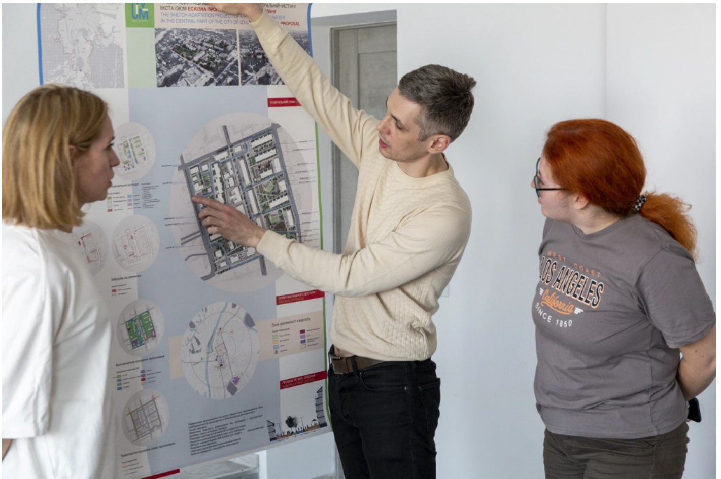
Urban & Community project 'IZYUM_recovery'