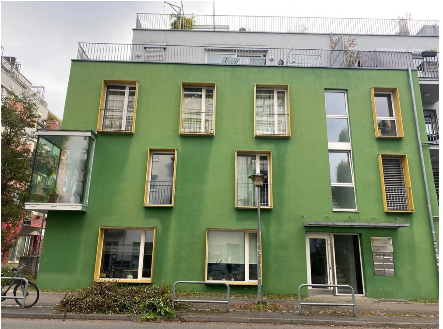
Urban & Community project 'IZYUM_recovery'