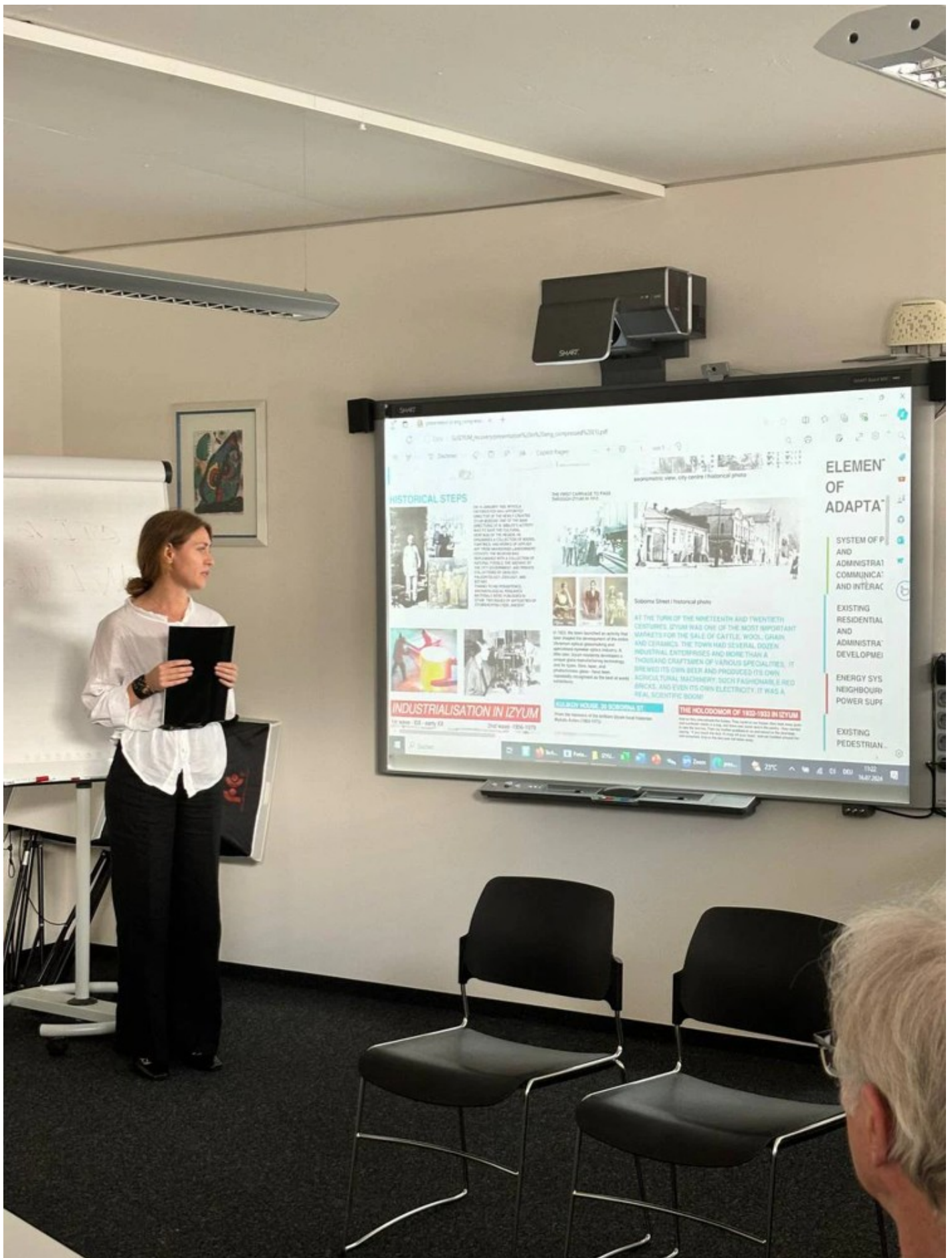
Urban & Community project 'IZYUM_recovery'