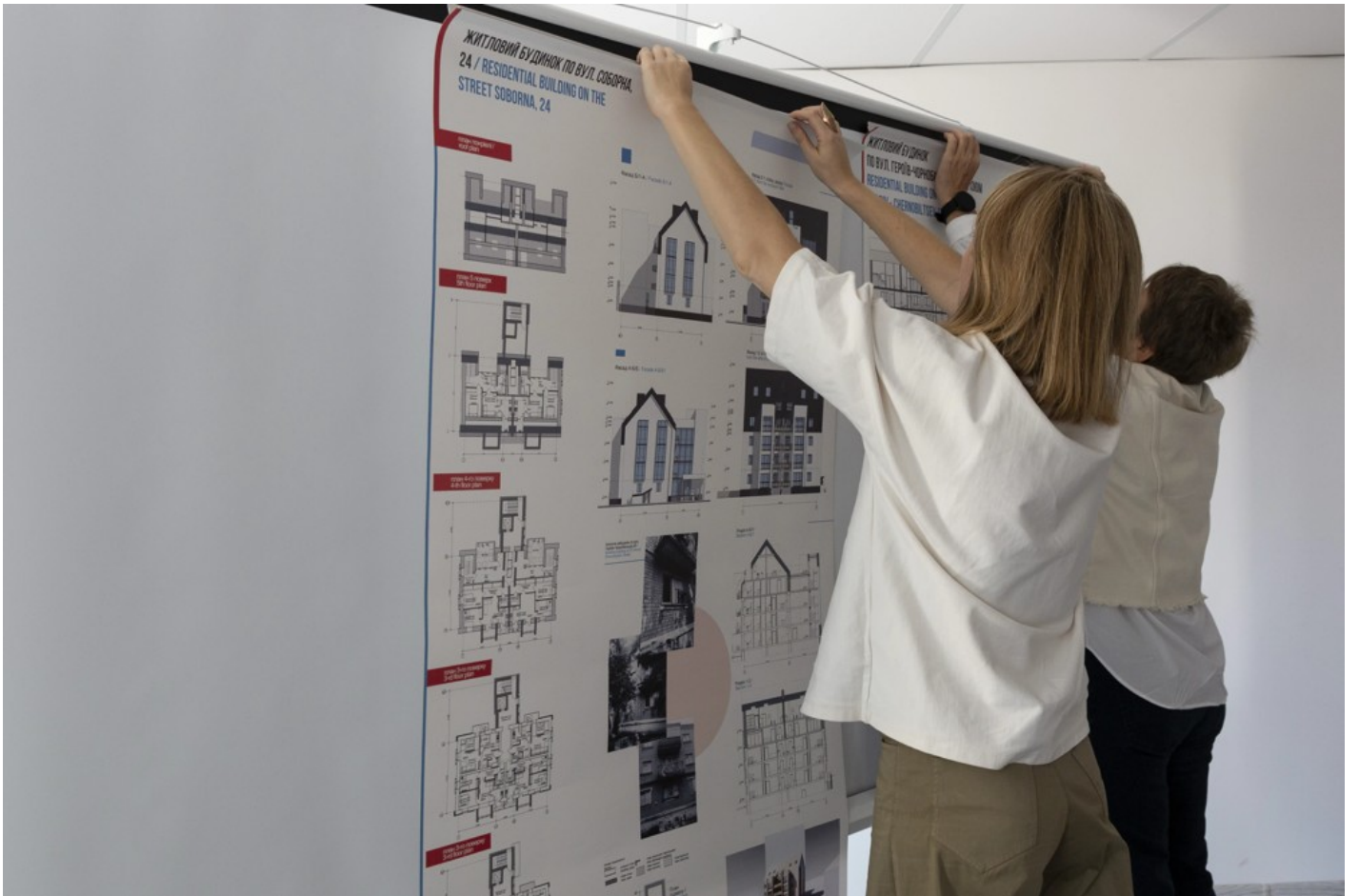
Urban & Community project 'IZYUM_recovery'