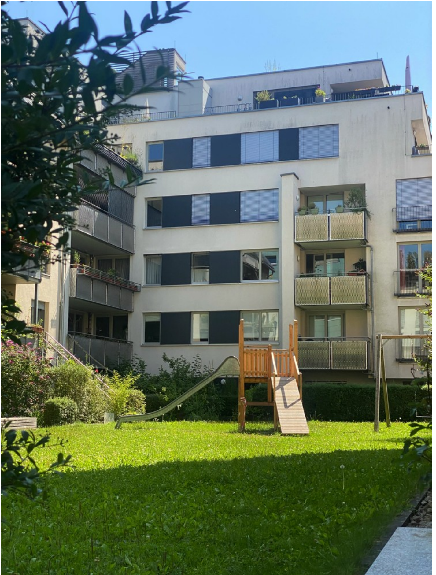
Urban & Community project 'IZYUM_recovery'