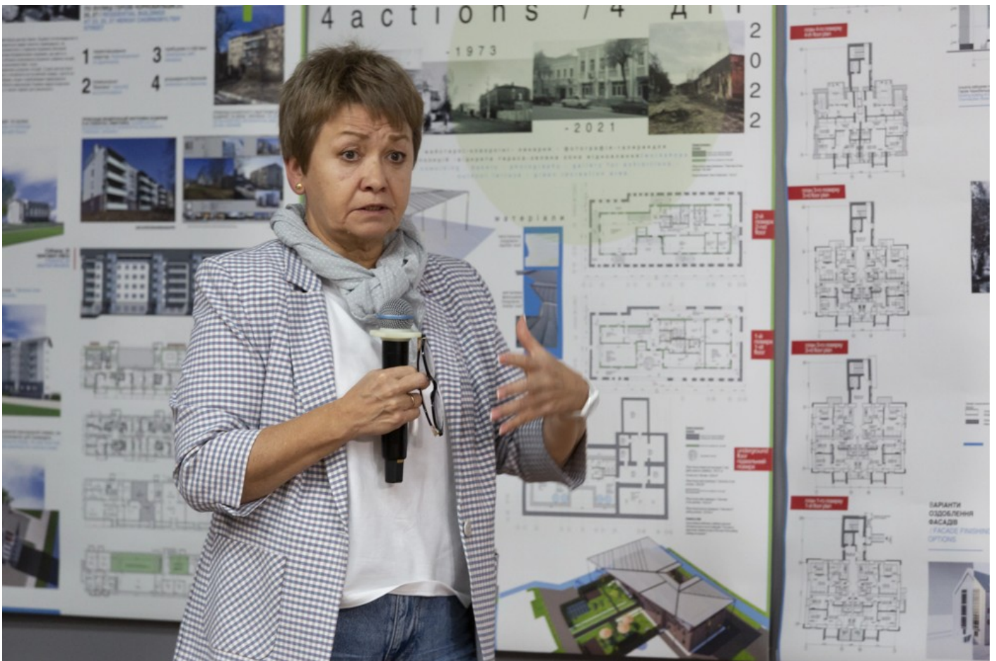
Urban & Community project 'IZYUM_recovery'