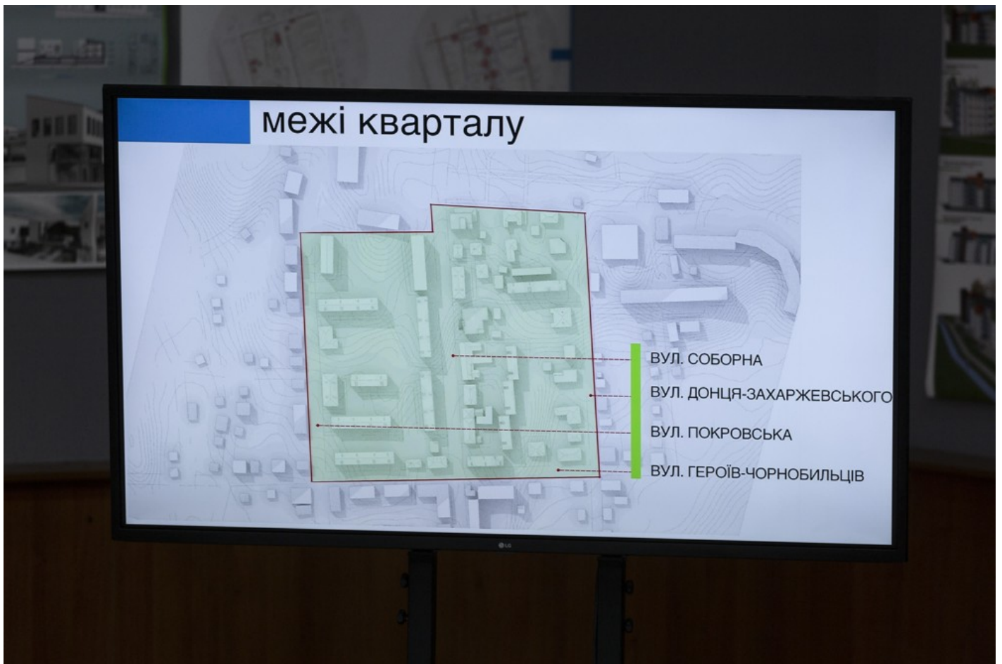
Urban & Community project 'IZYUM_recovery'