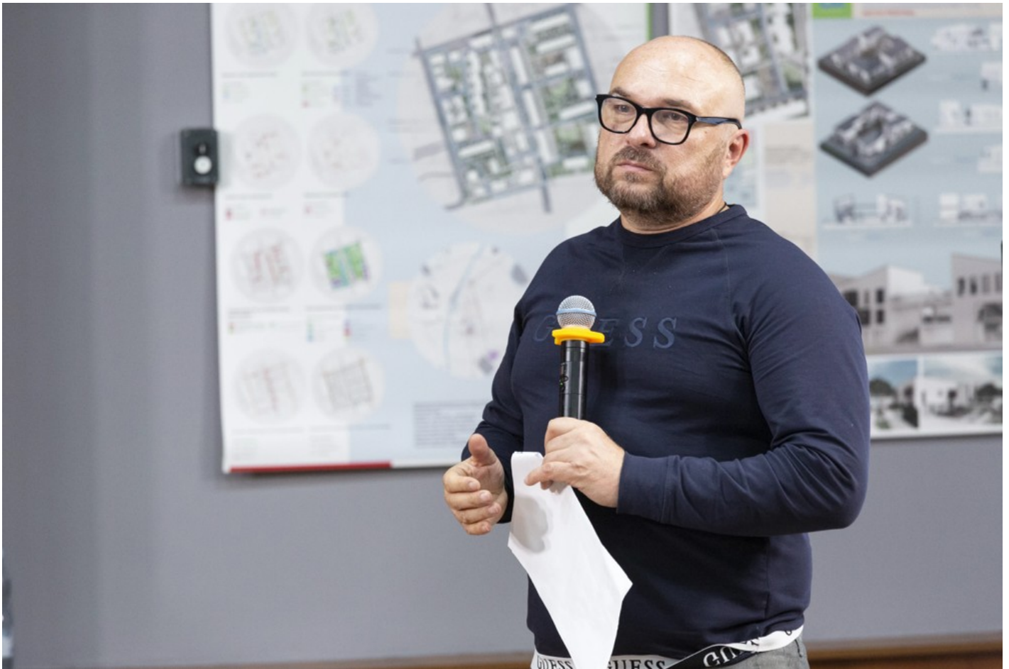
Urban & Community project 'IZYUM_recovery'