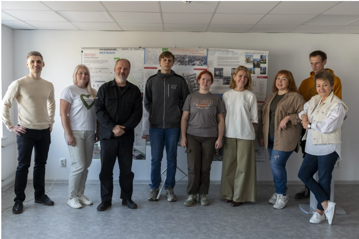
Urban & Community project 'IZYUM_recovery'