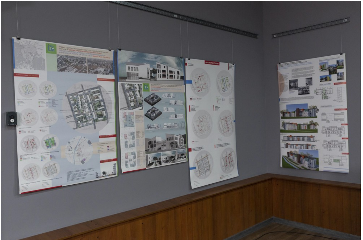
Urban & Community project 'IZYUM_recovery'