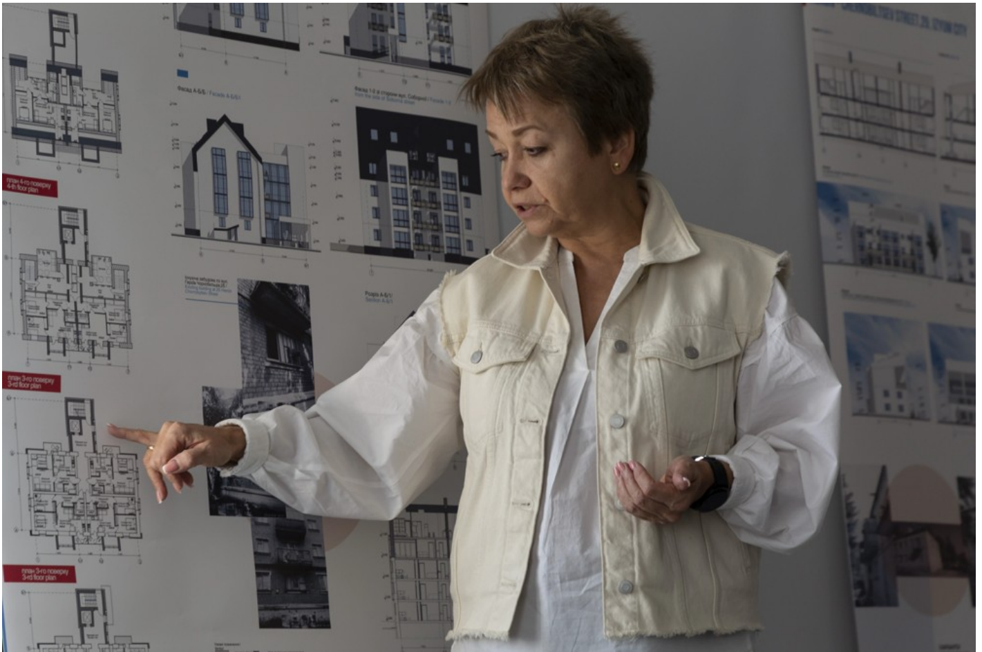
Urban & Community project 'IZYUM_recovery'