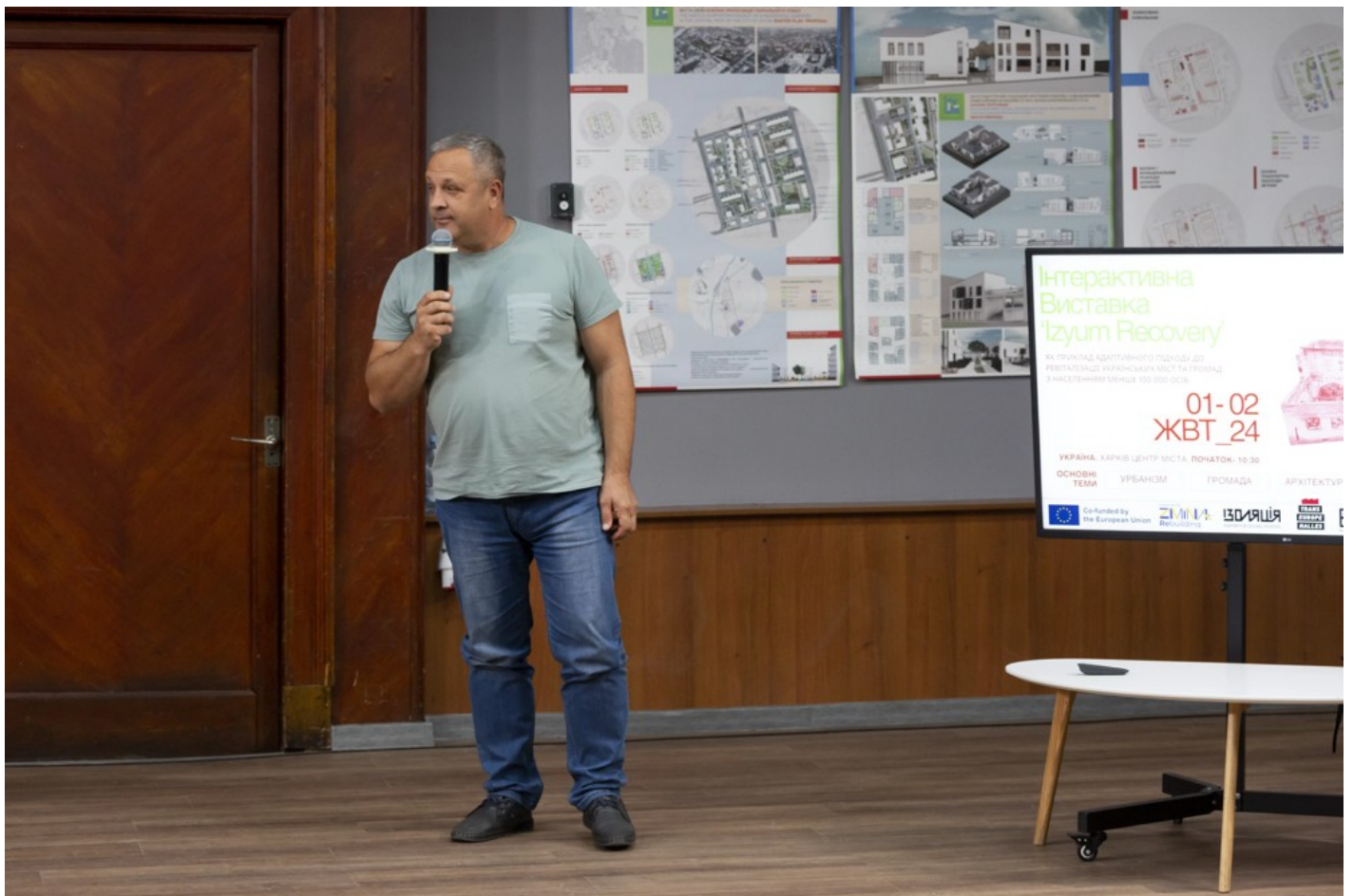
Urban & Community project 'IZYUM_recovery'