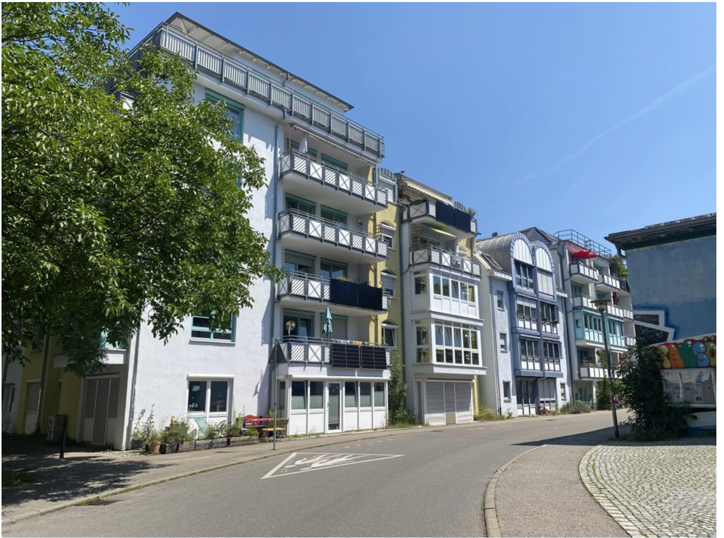
Urban & Community project 'IZYUM_recovery'