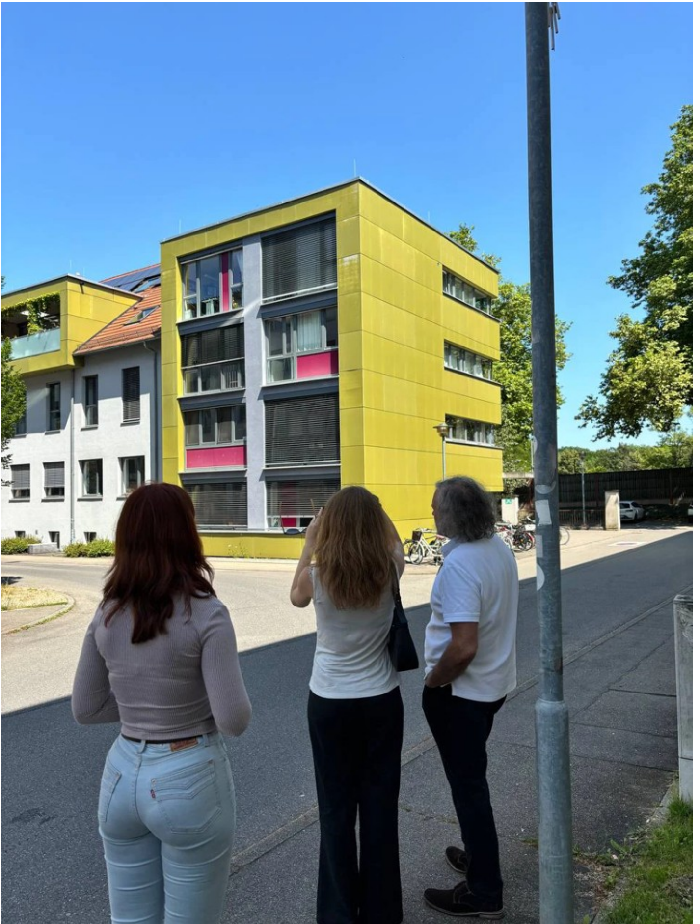
Urban & Community project 'IZYUM_recovery'