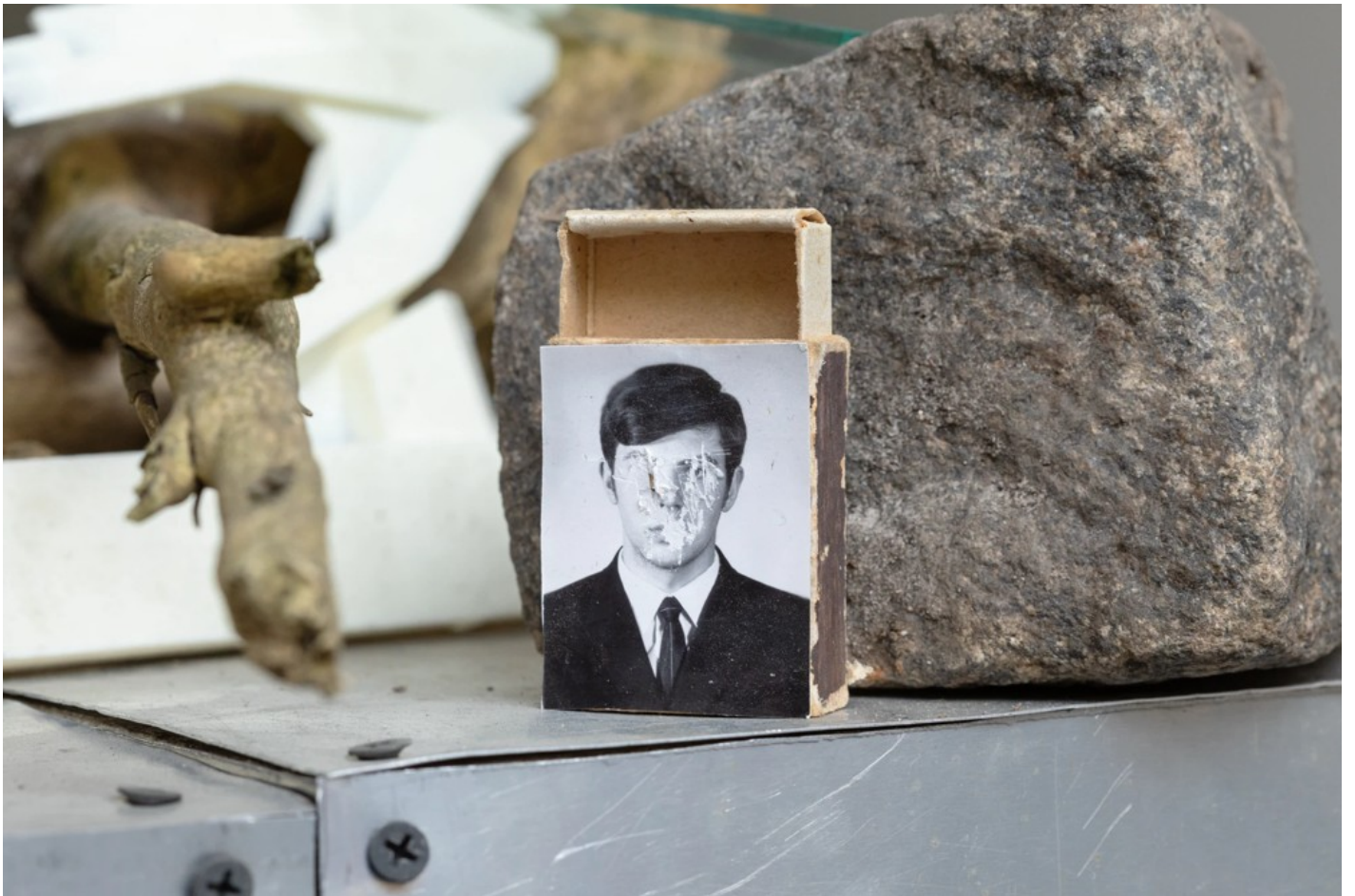
Under the Lying Stone, Water Does Not Flow