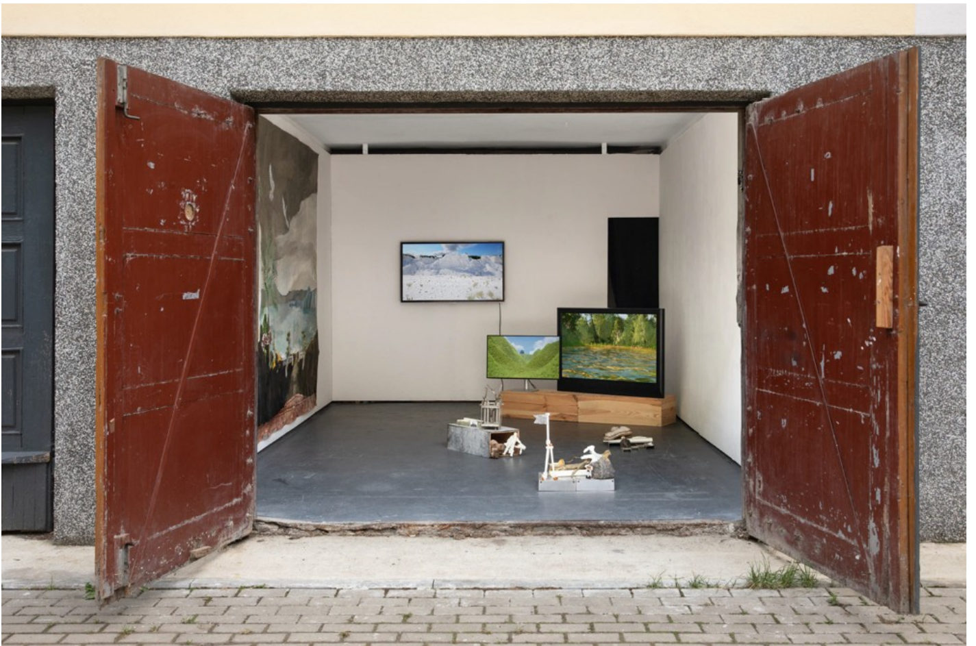
Under the Lying Stone, Water Does Not Flow