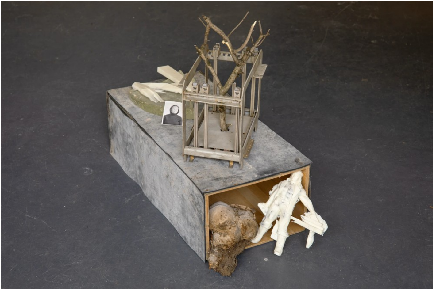
Under the Lying Stone, Water Does Not Flow