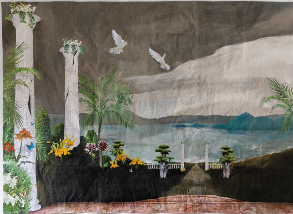
Under the Lying Stone, Water Does Not Flow