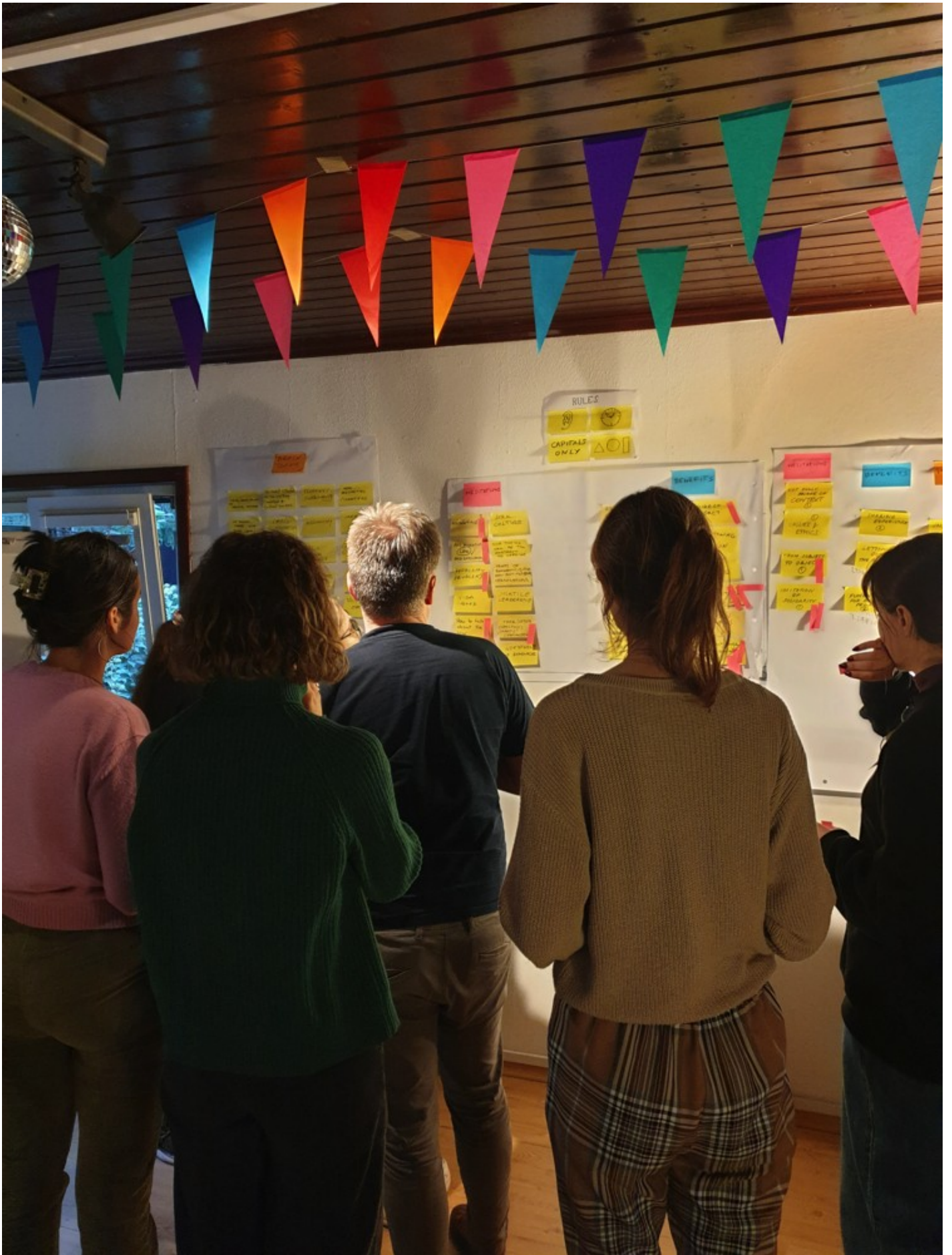
Under the Lying Stone, Water Does Not Flow