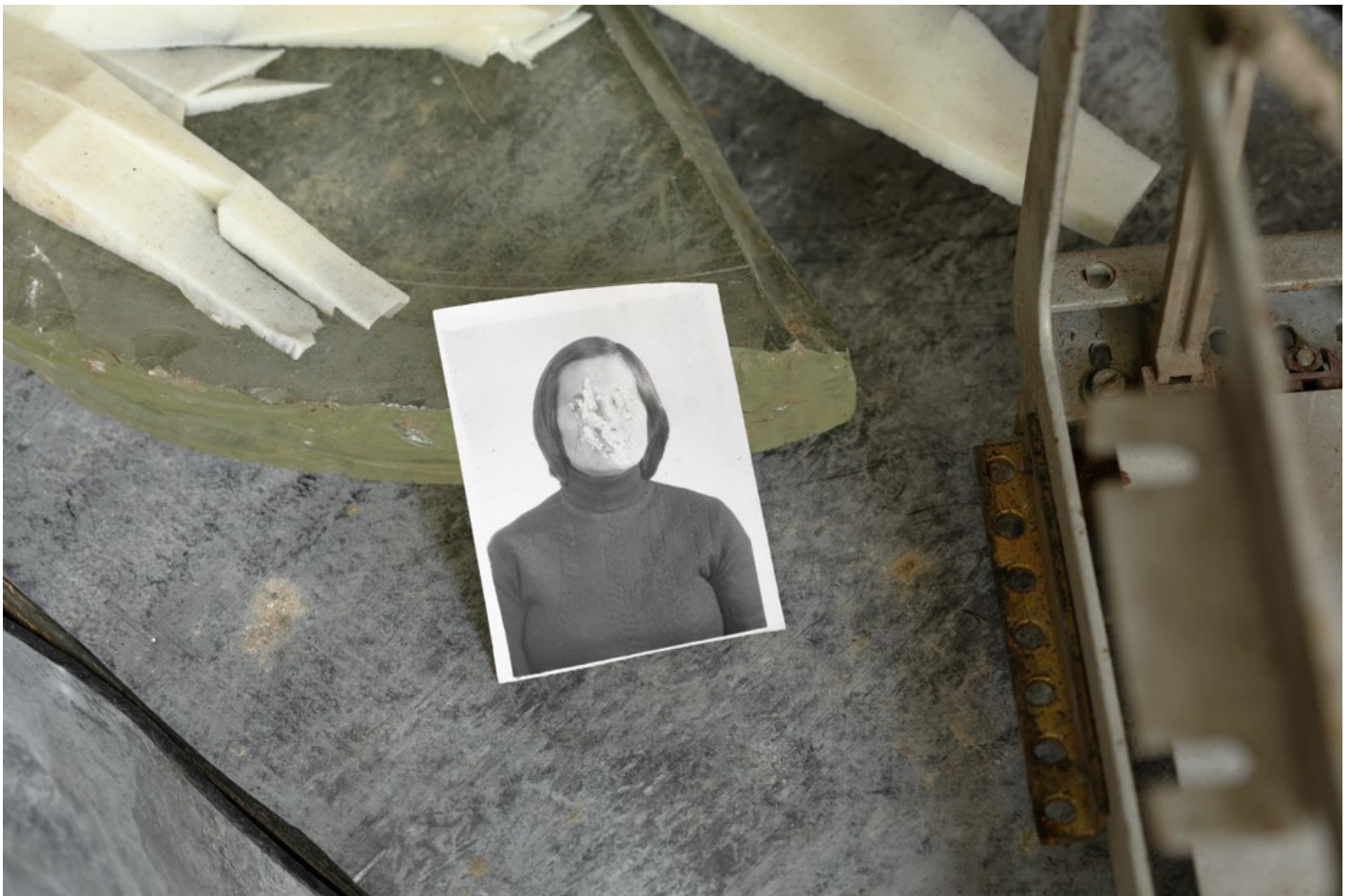
Under the Lying Stone, Water Does Not Flow