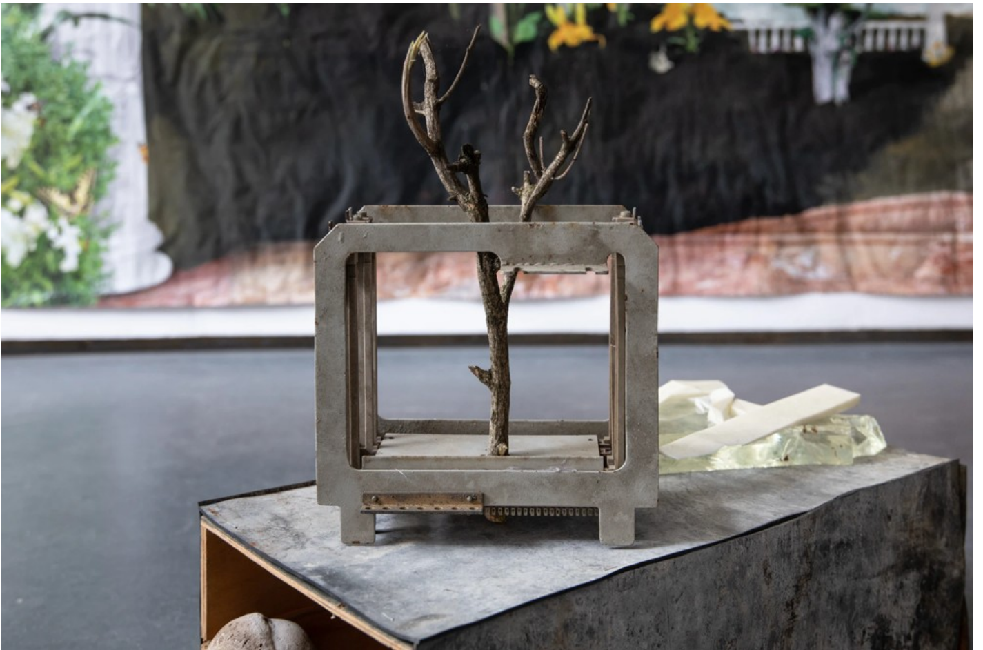
Under the Lying Stone, Water Does Not Flow