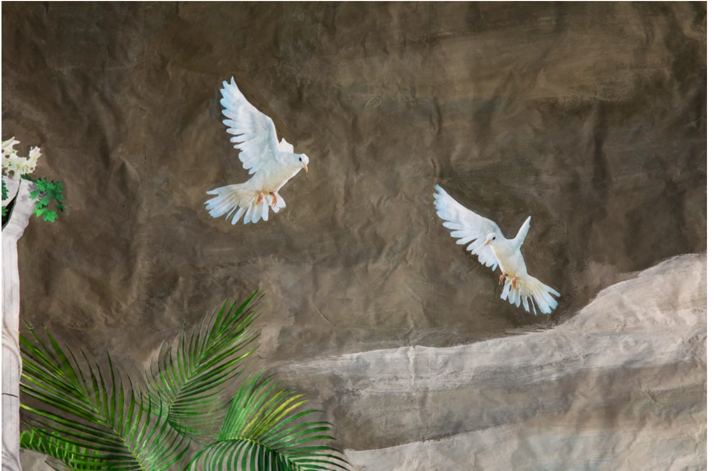
Under the Lying Stone, Water Does Not Flow