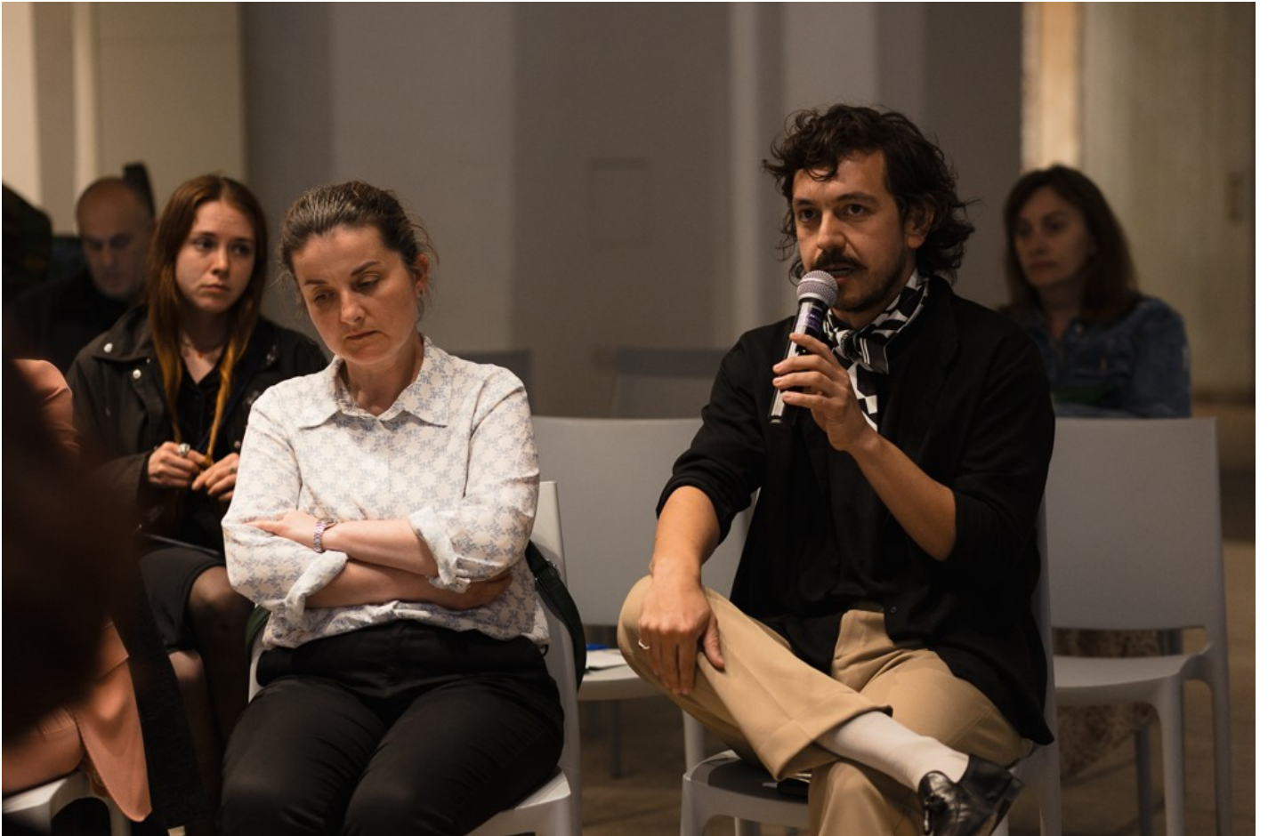
Ukrainian Pavilion at Malta Biennale 2024