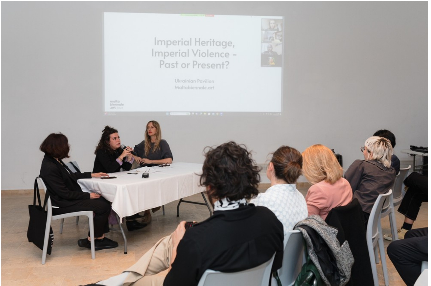
Ukrainian Pavilion at Malta Biennale 2024