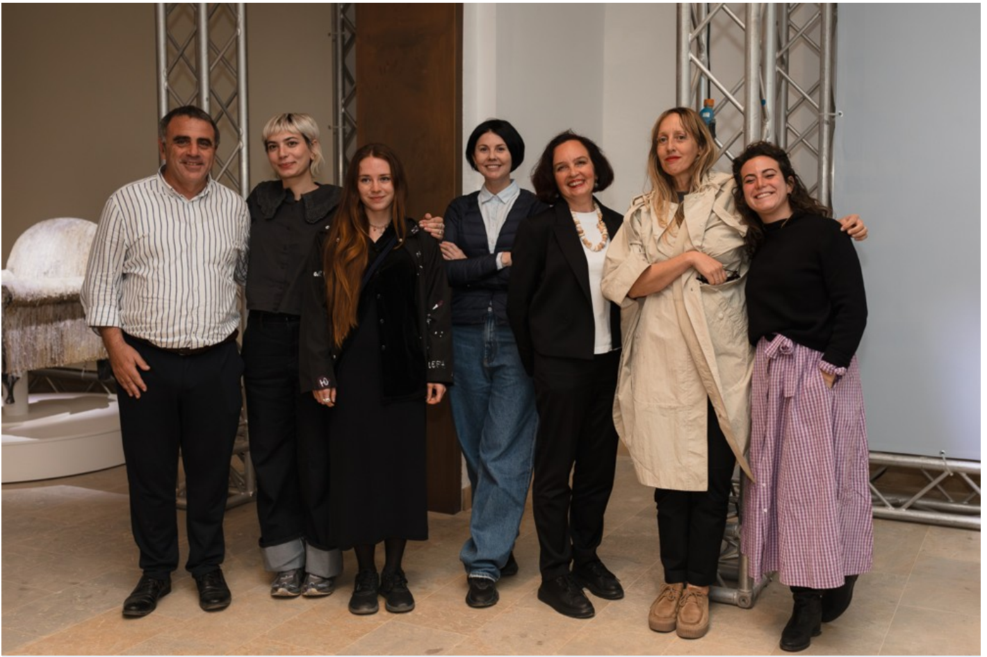
Ukrainian Pavilion at Malta Biennale 2024