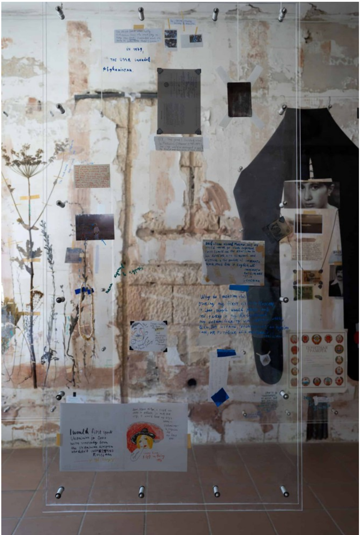
Ukrainian Pavilion at Malta Biennale 2024