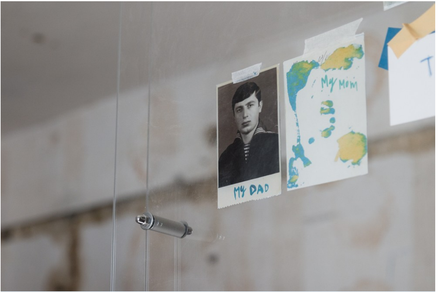
Ukrainian Pavilion at Malta Biennale 2024