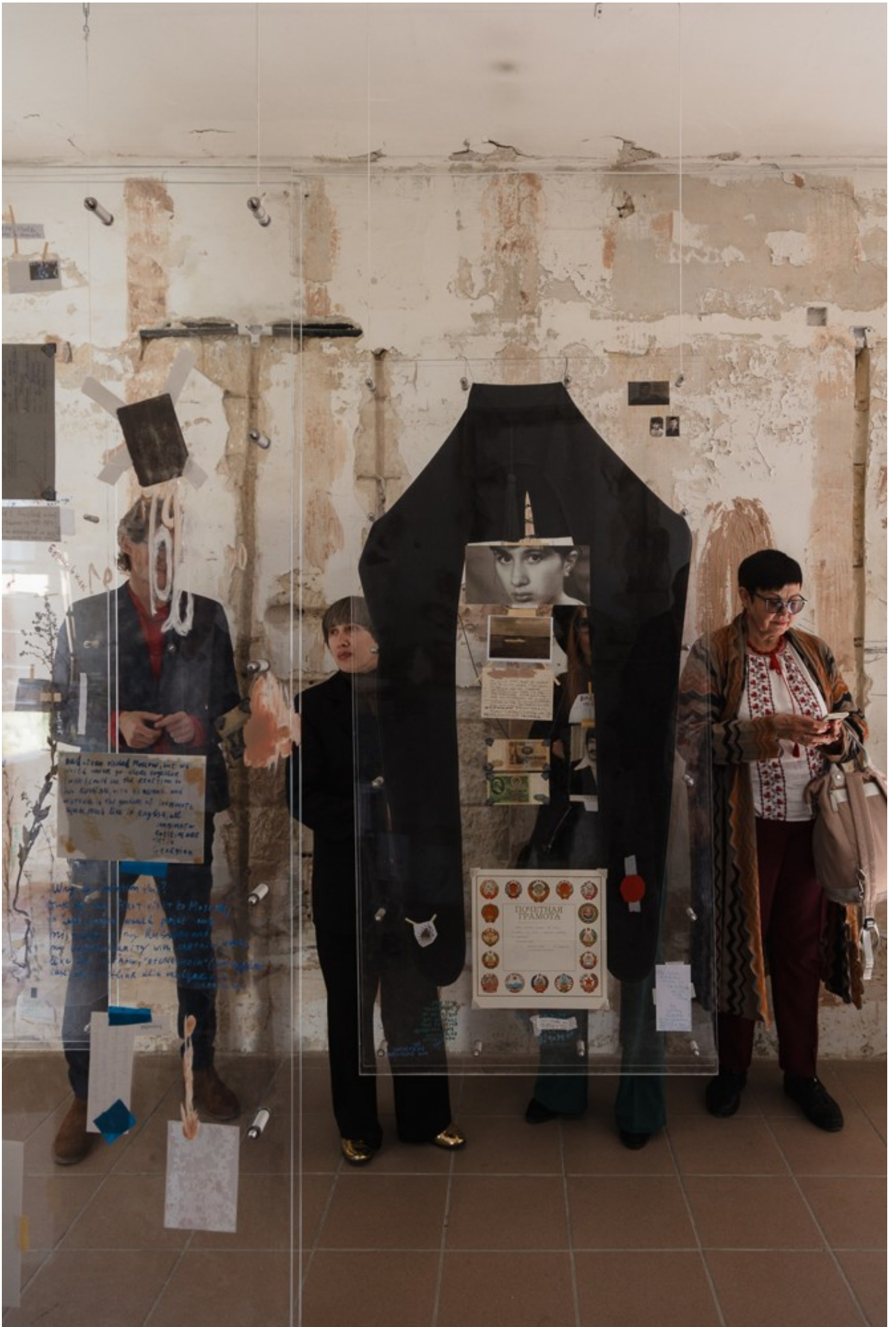
Ukrainian Pavilion at Malta Biennale 2024