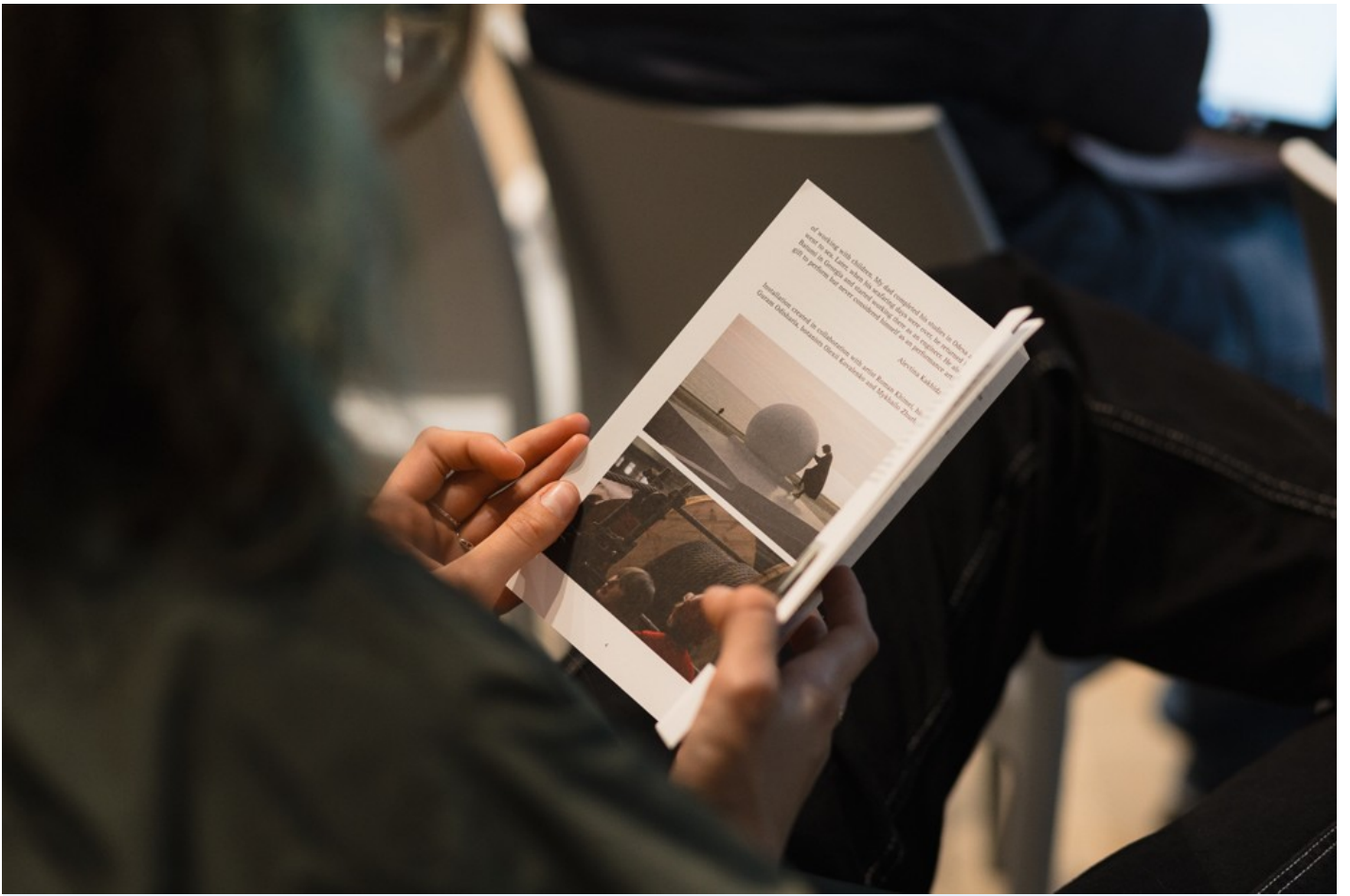
Ukrainian Pavilion at Malta Biennale 2024