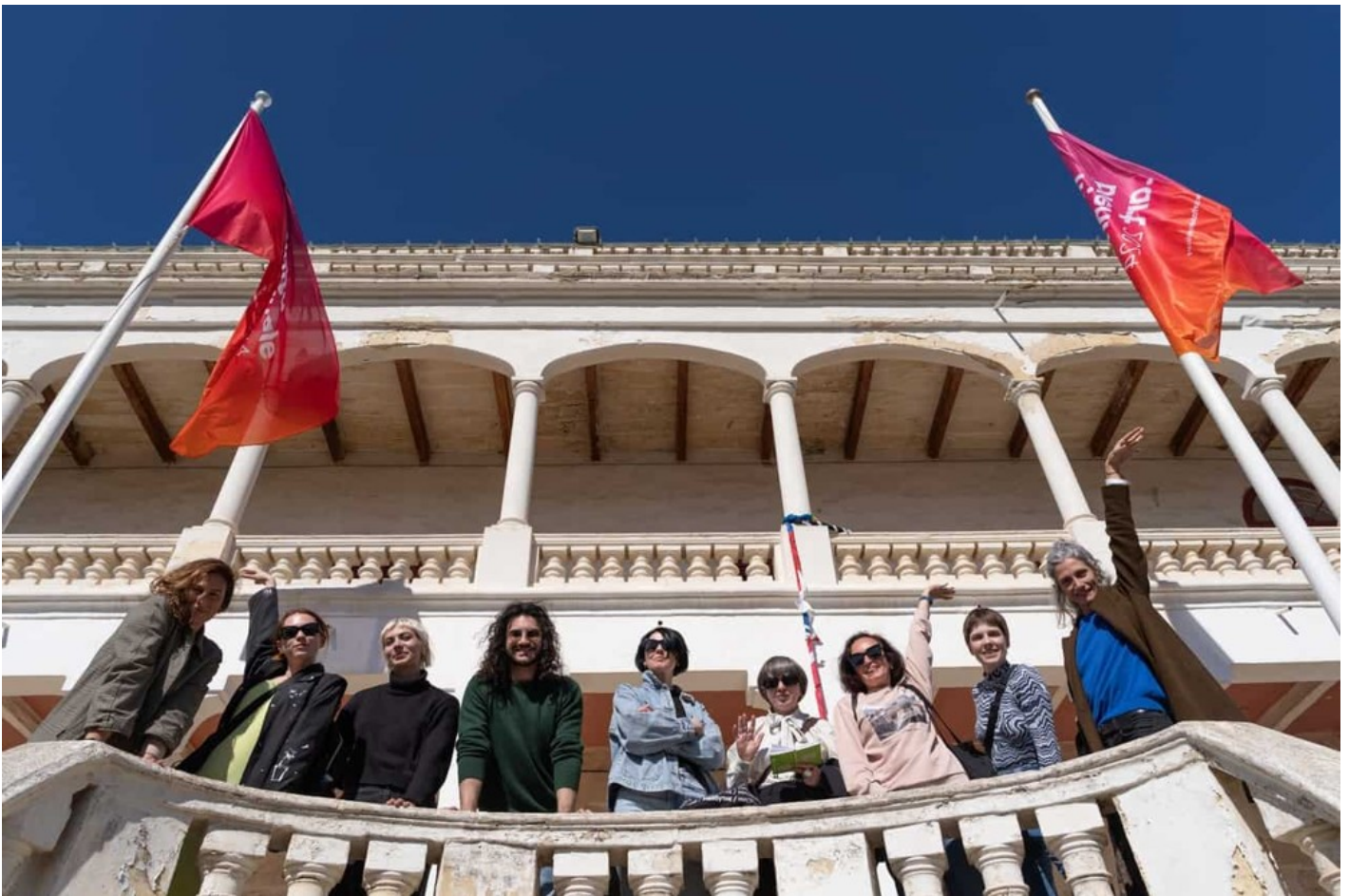
Ukrainian Pavilion at Malta Biennale 2024