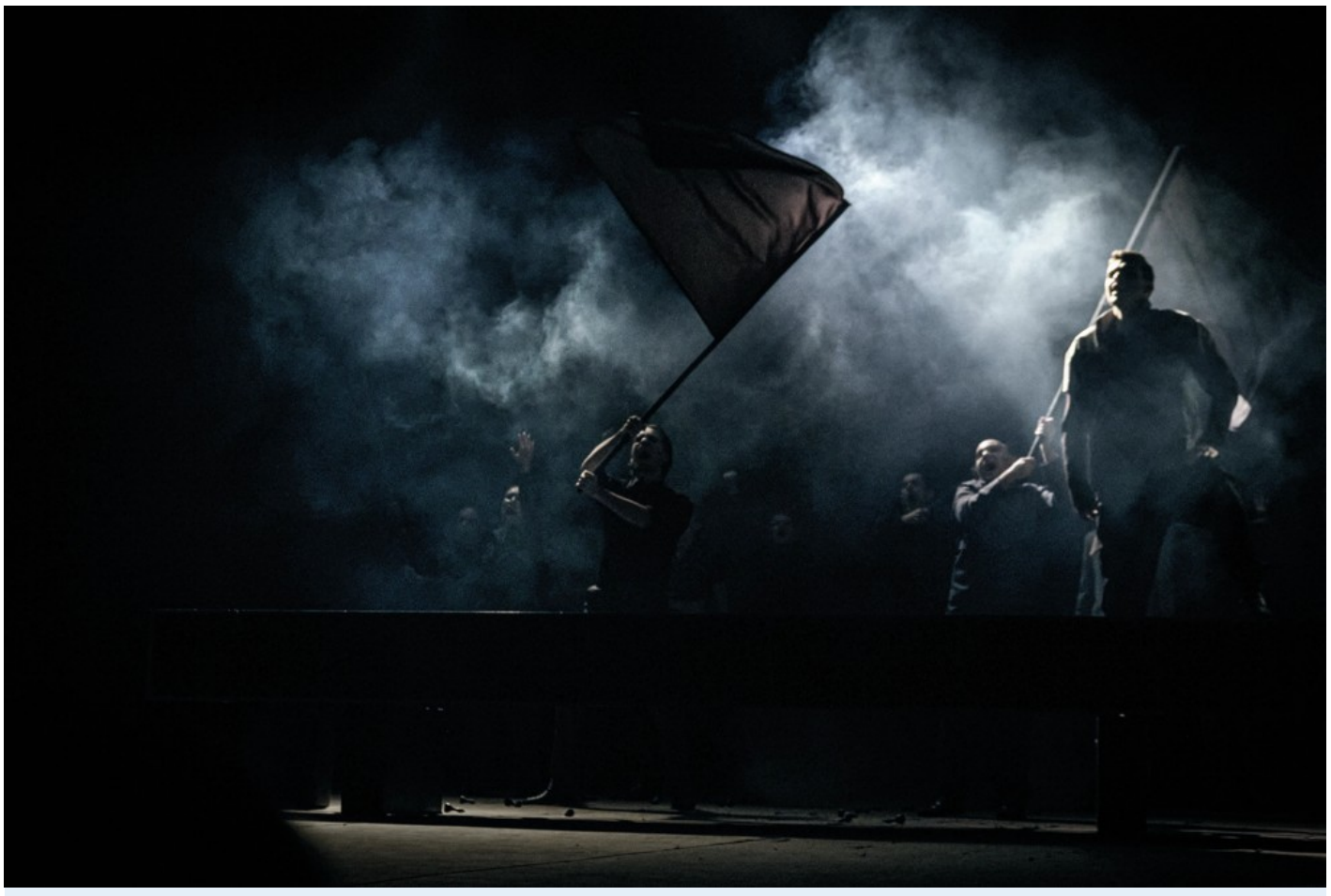
"The White Disease": the fantastic realism of one wartime