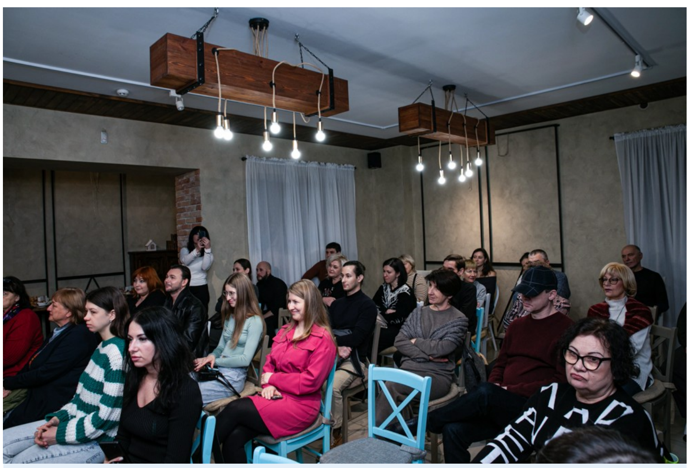
"The White Disease": the fantastic realism of one wartime