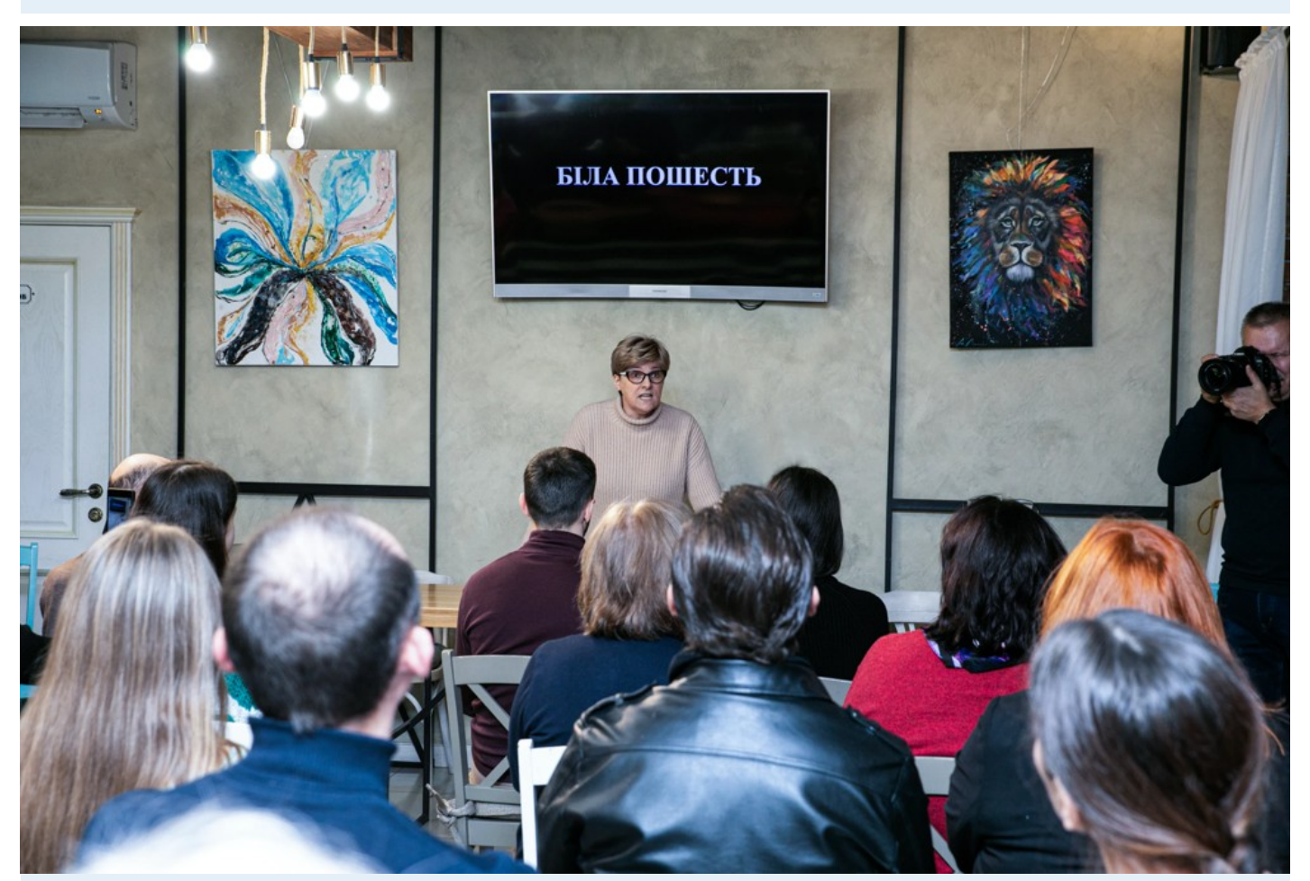
"The White Disease": the fantastic realism of one wartime