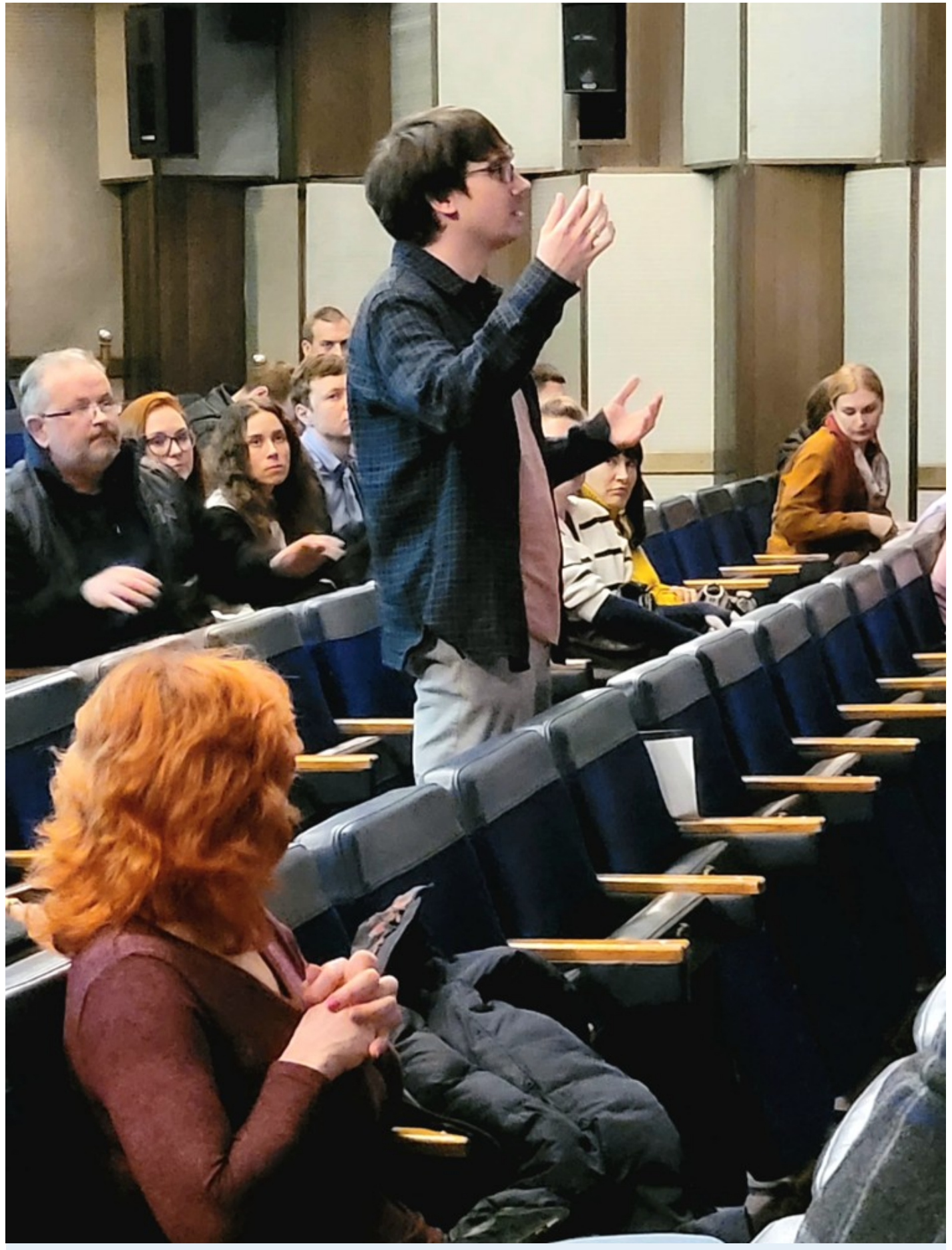
"The White Disease": the fantastic realism of one wartime