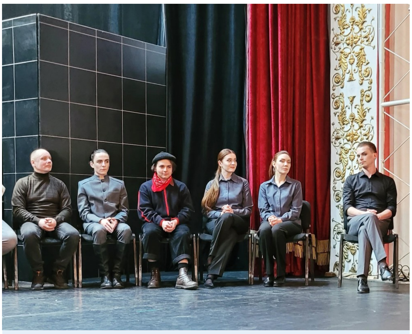
"The White Disease": the fantastic realism of one wartime