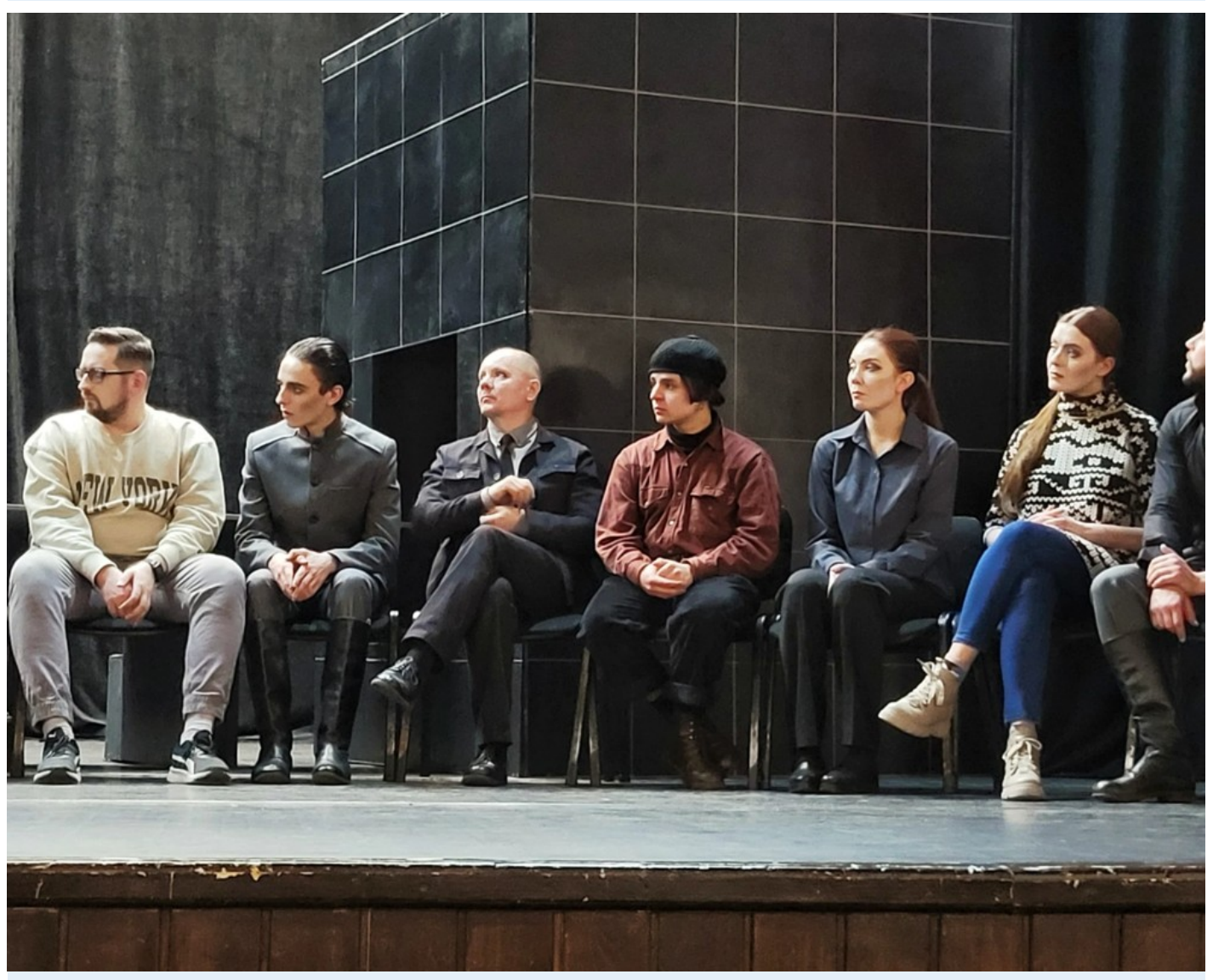
"The White Disease": the fantastic realism of one wartime