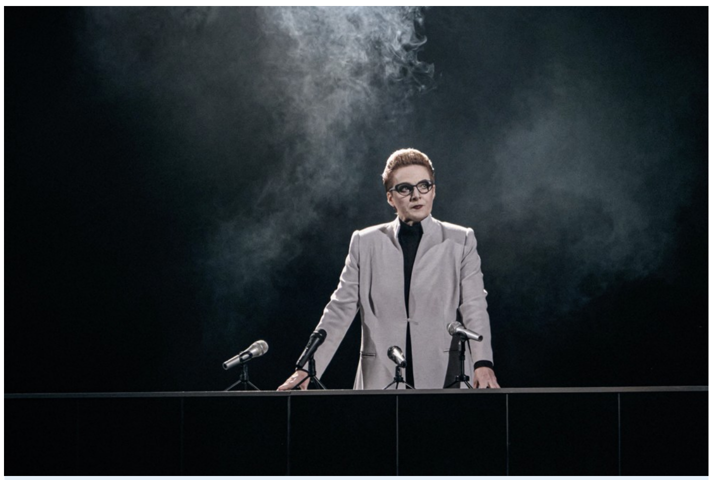
"The White Disease": the fantastic realism of one wartime