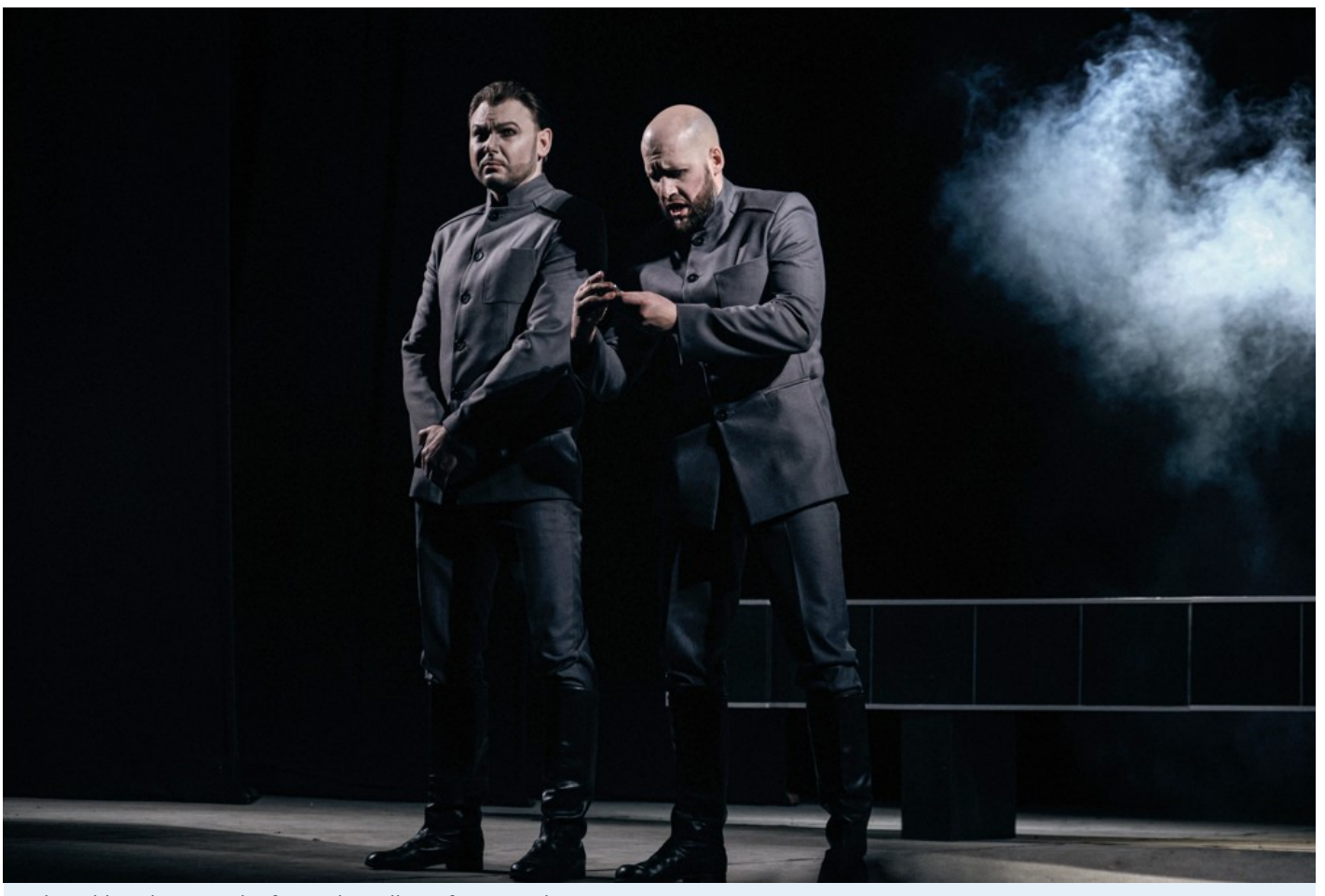
"The White Disease": the fantastic realism of one wartime