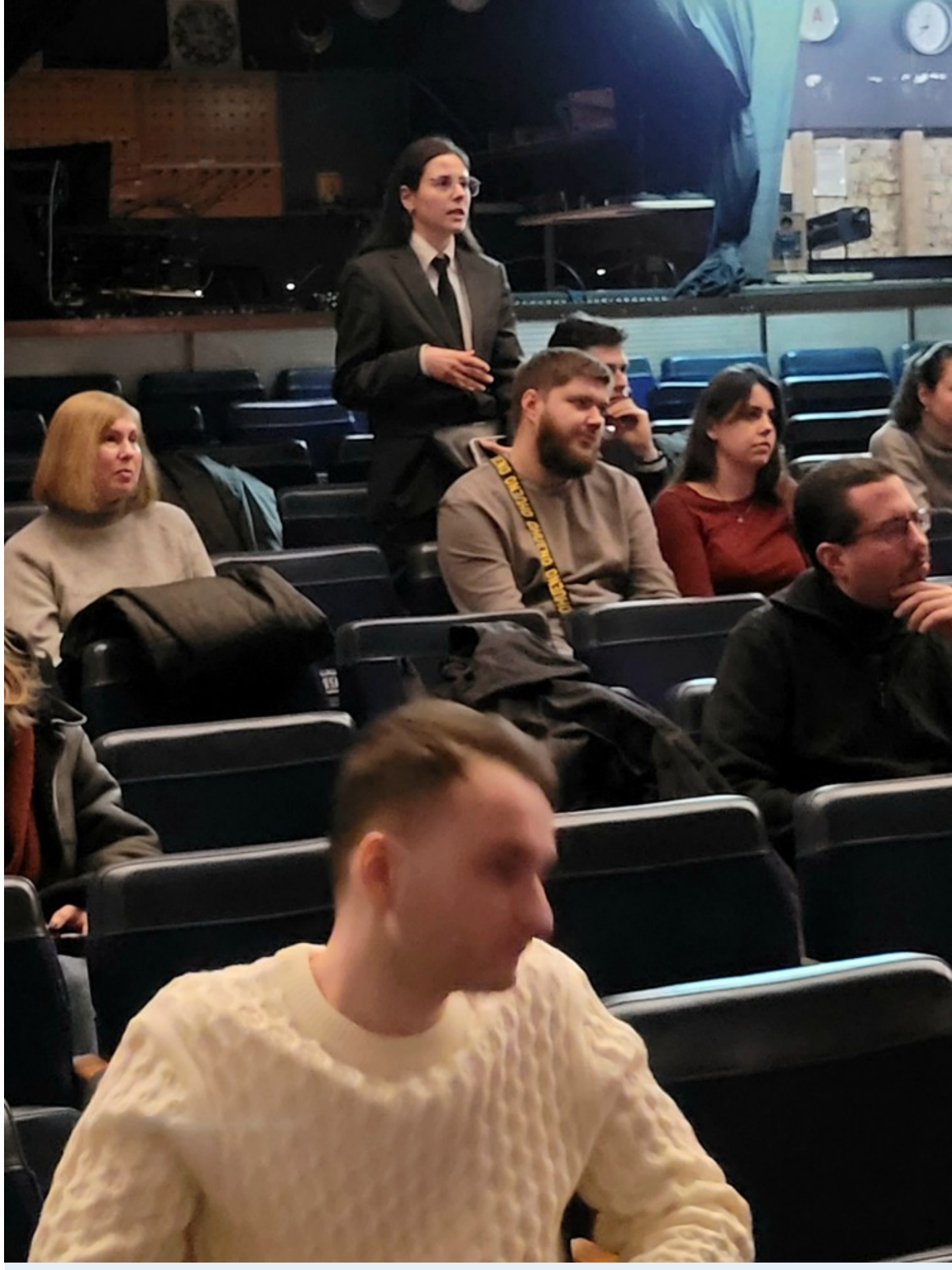
"The White Disease": the fantastic realism of one wartime