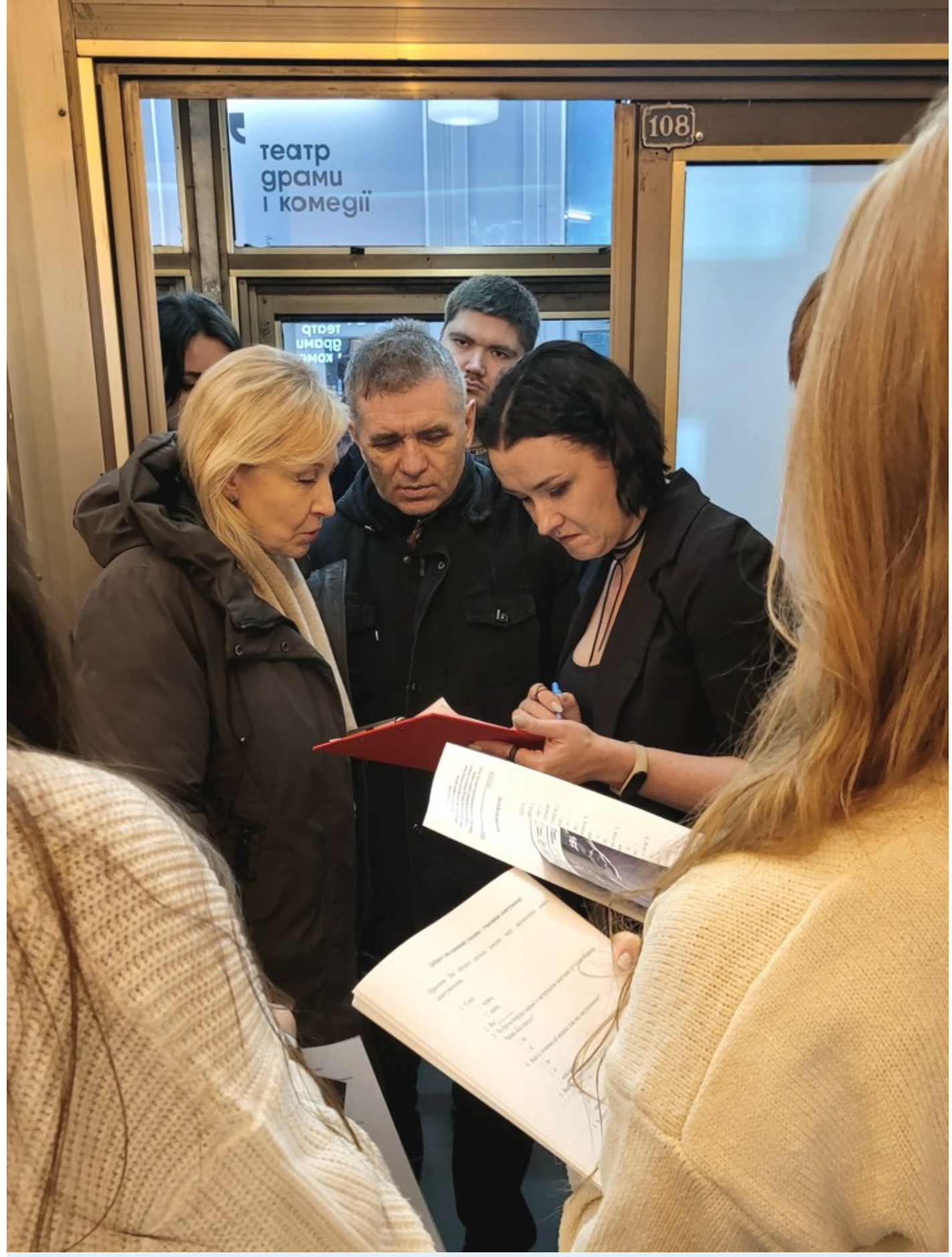
"The White Disease": the fantastic realism of one wartime