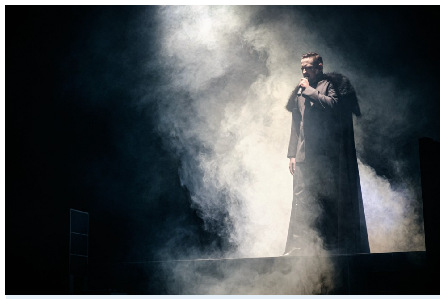
"The White Disease": the fantastic realism of one wartime