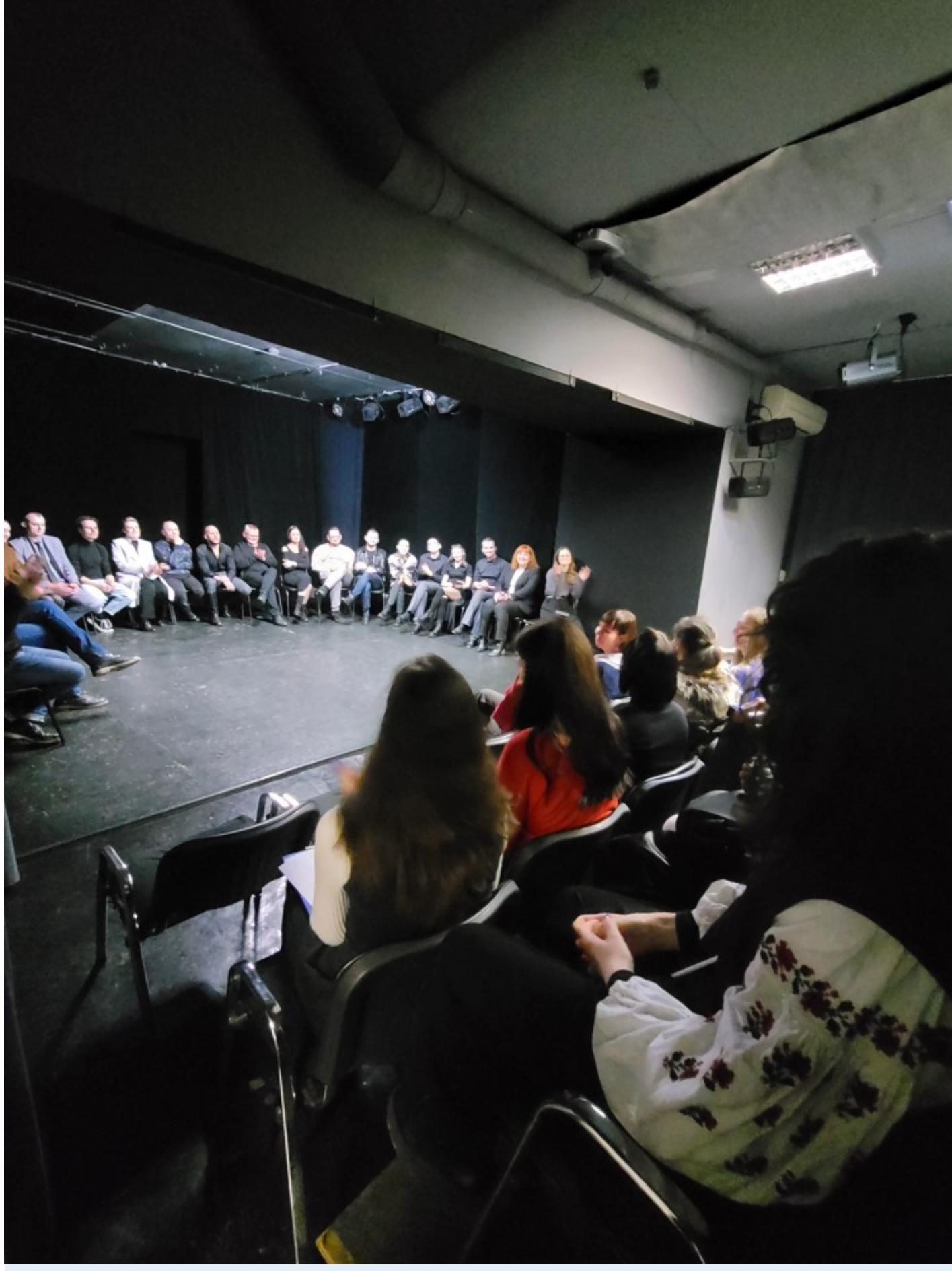
"The White Disease": the fantastic realism of one wartime