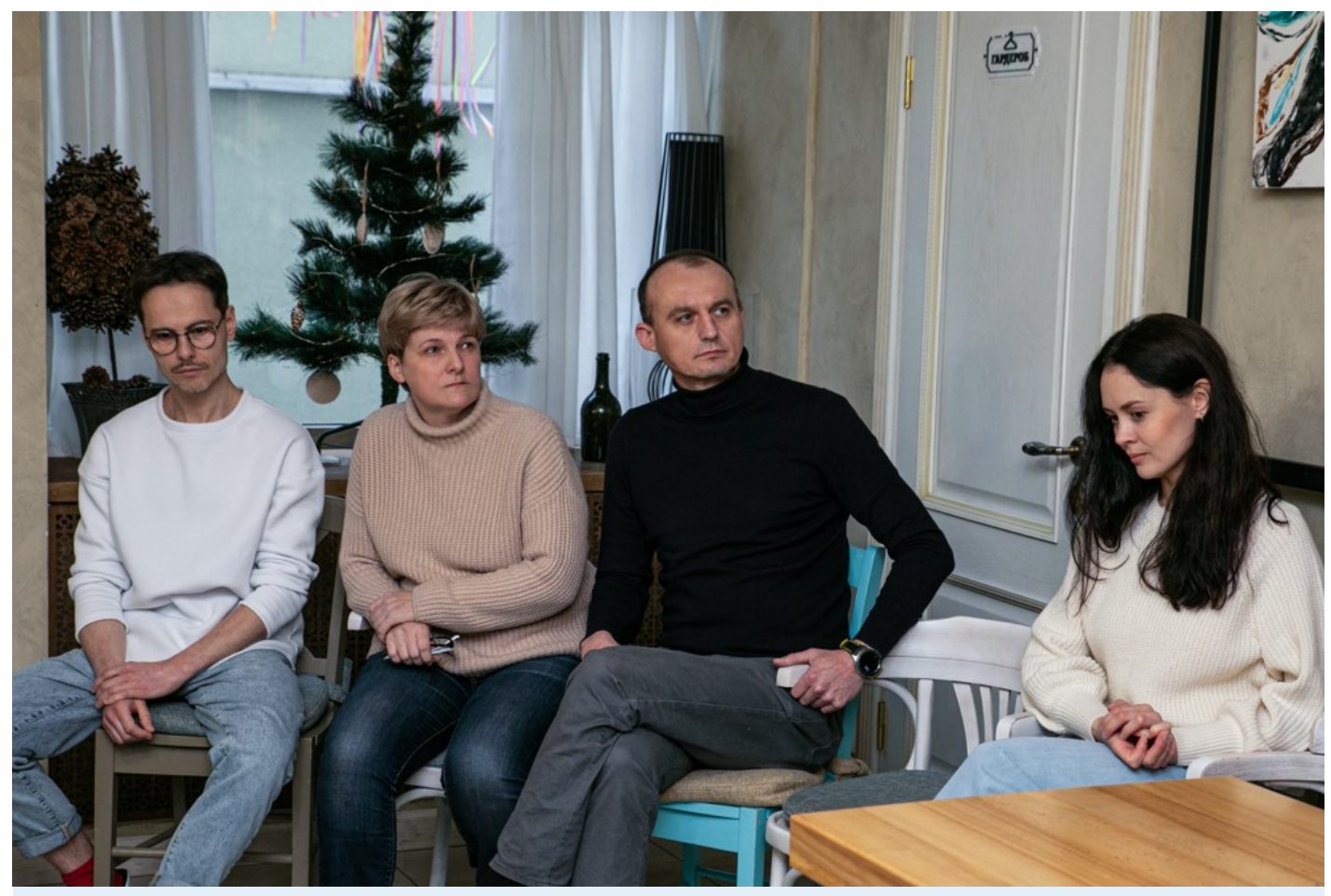
"The White Disease": the fantastic realism of one wartime