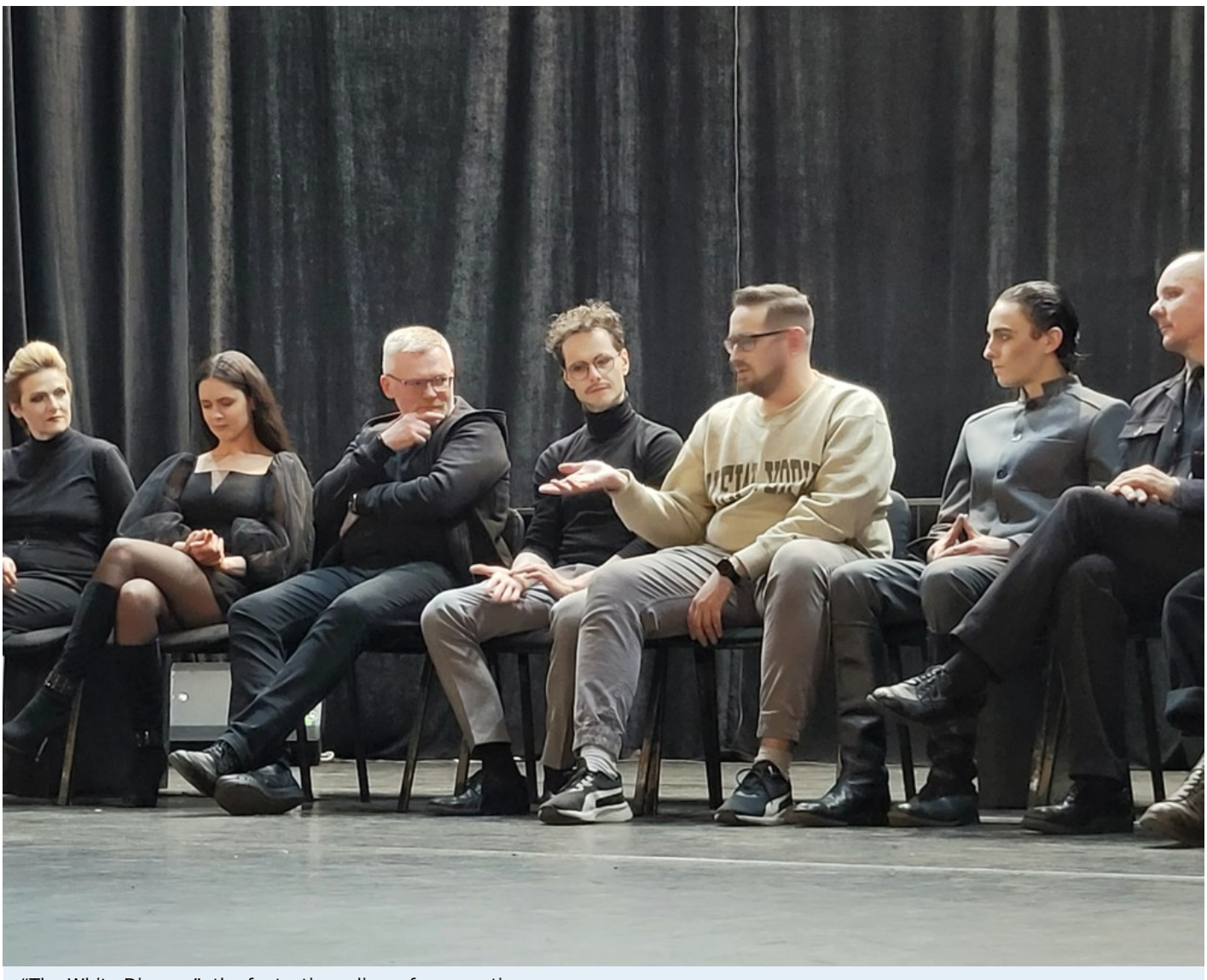
"The White Disease": the fantastic realism of one wartime