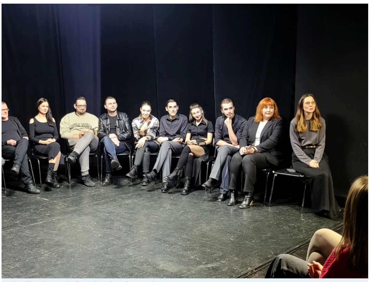
"The White Disease": the fantastic realism of one wartime