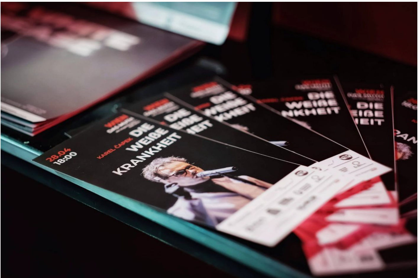
“The White Disease”: the fantastic realism of one wartime