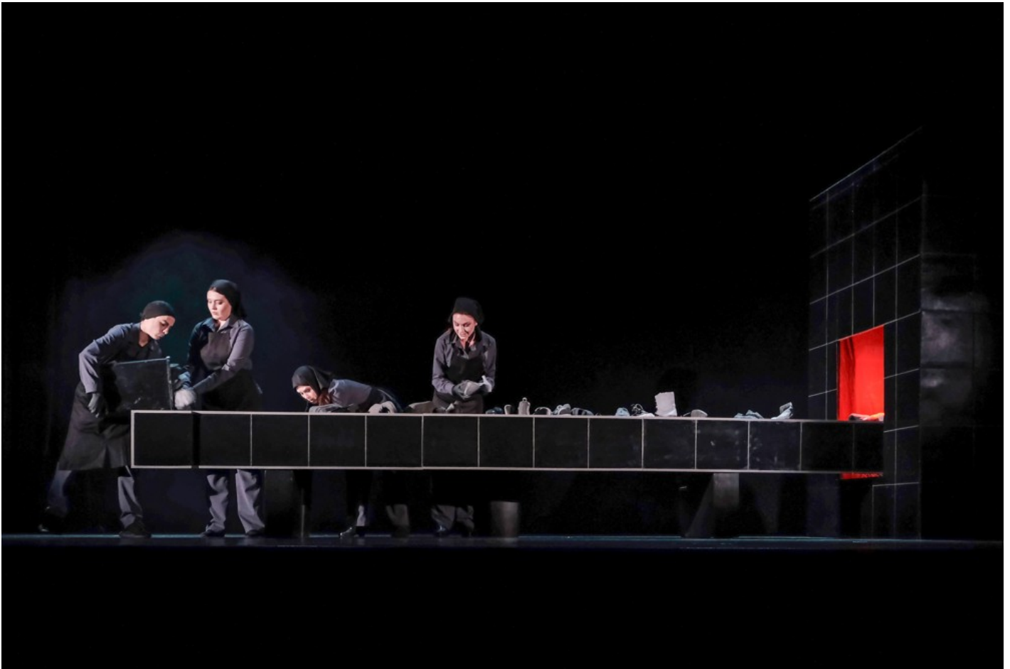
"The White Disease": the fantastic realism of one wartime