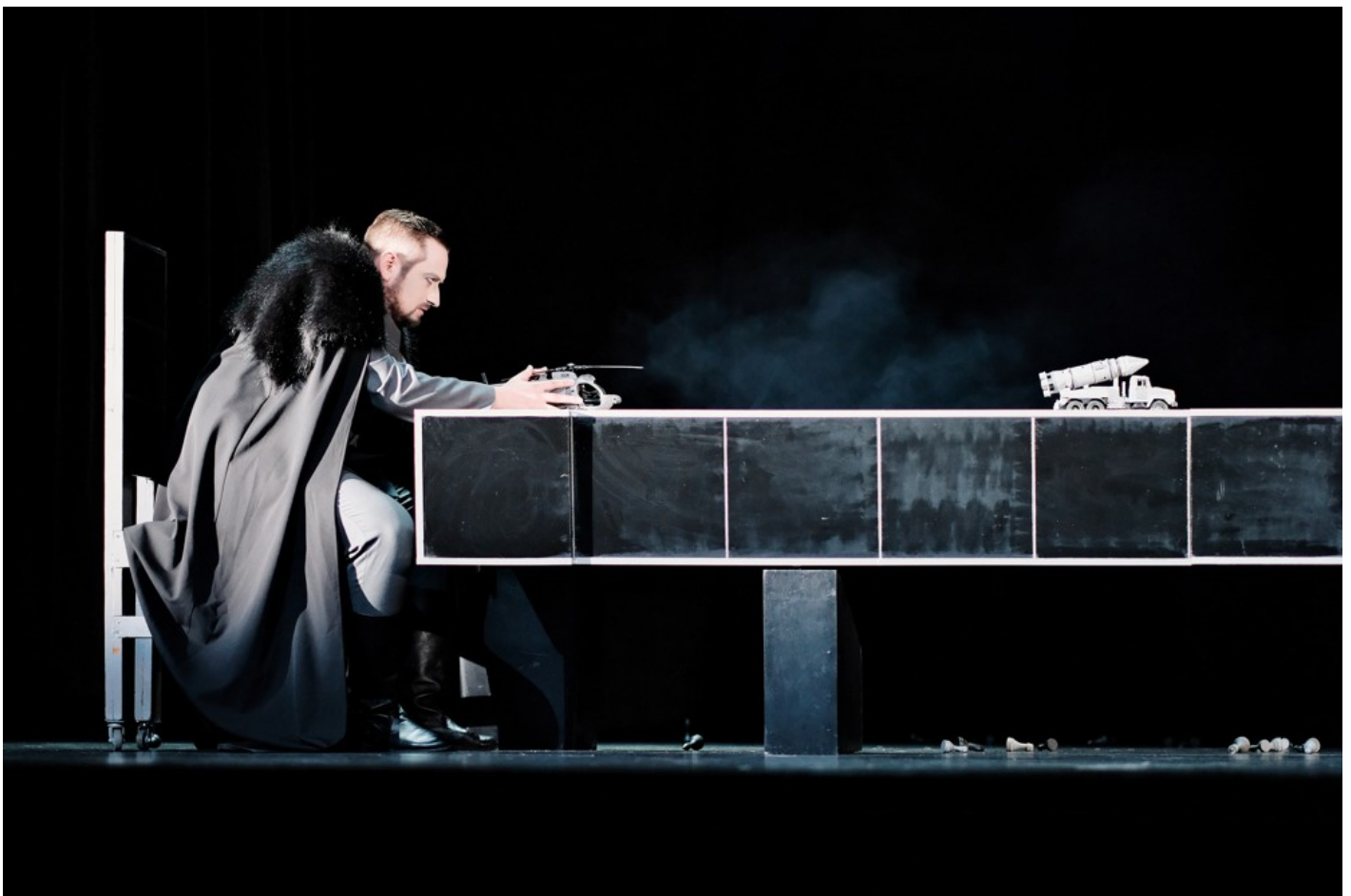
“The White Disease”: the fantastic realism of one wartime