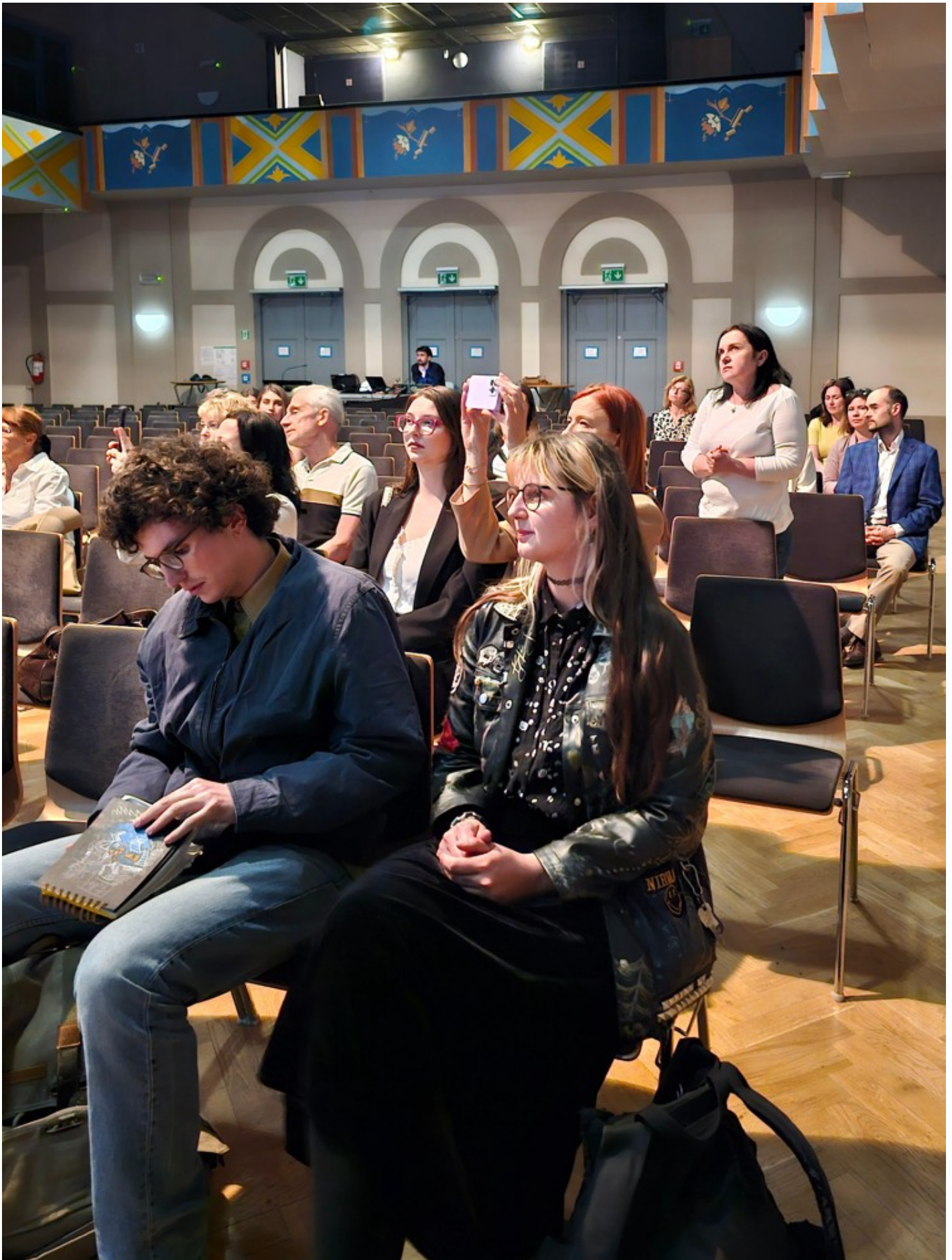
"The White Disease": the fantastic realism of one wartime