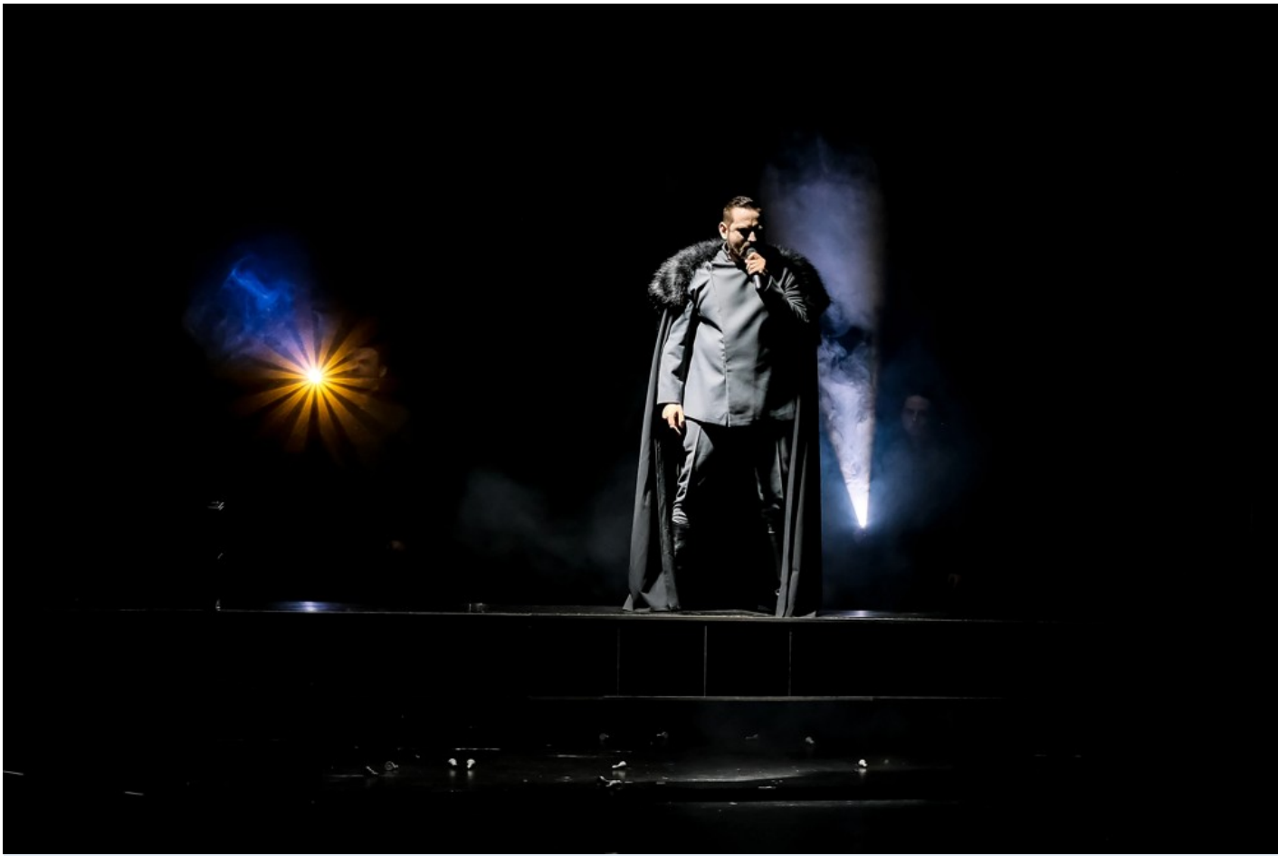
"The White Disease": the fantastic realism of one wartime