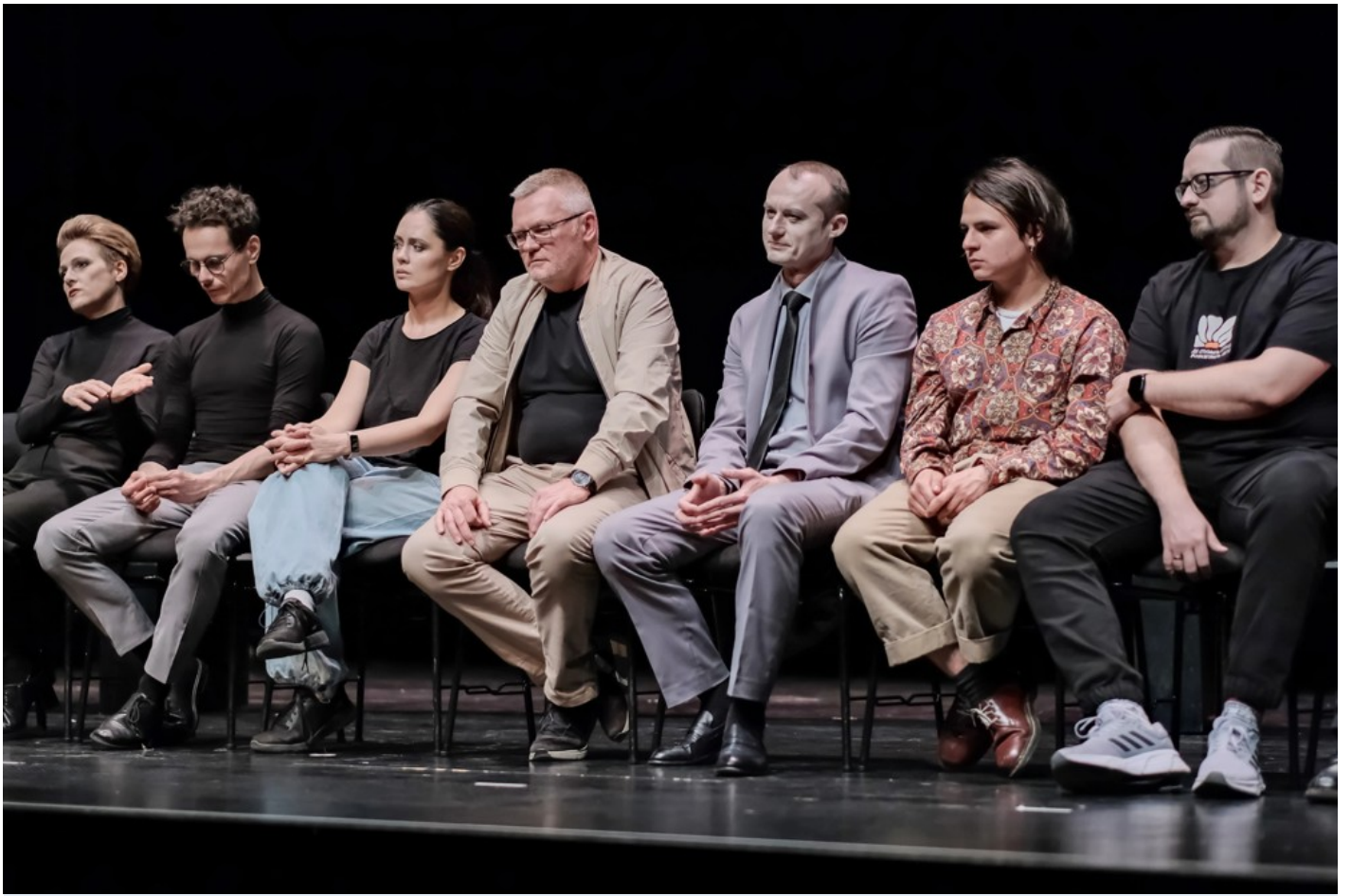
“The White Disease”: the fantastic realism of one wartime