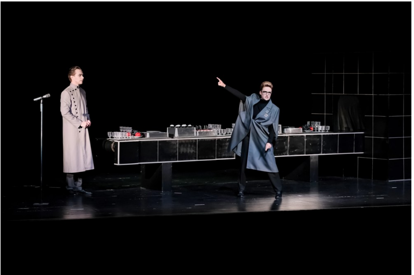
“The White Disease”: the fantastic realism of one wartime