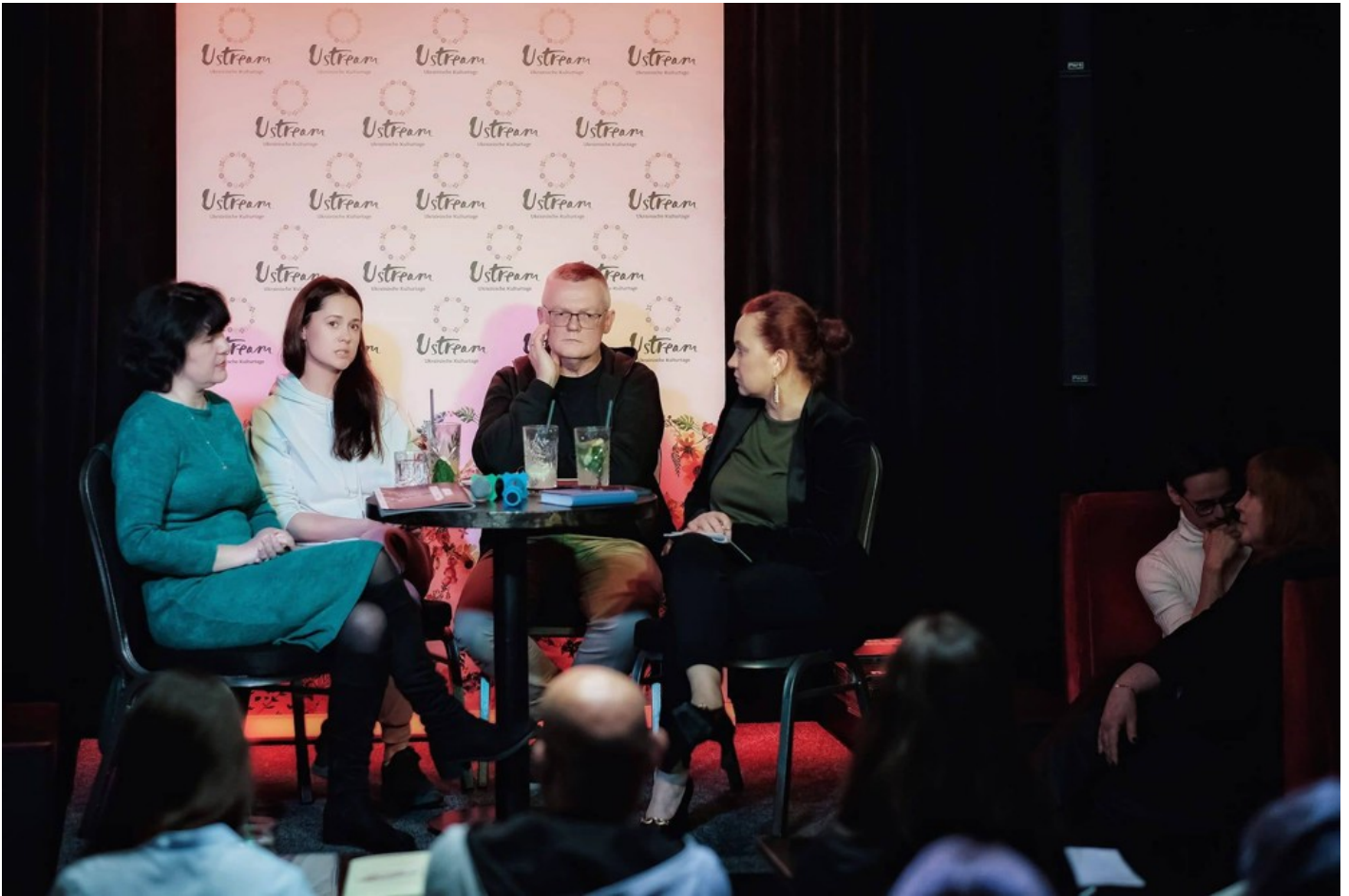
“The White Disease”: the fantastic realism of one wartime