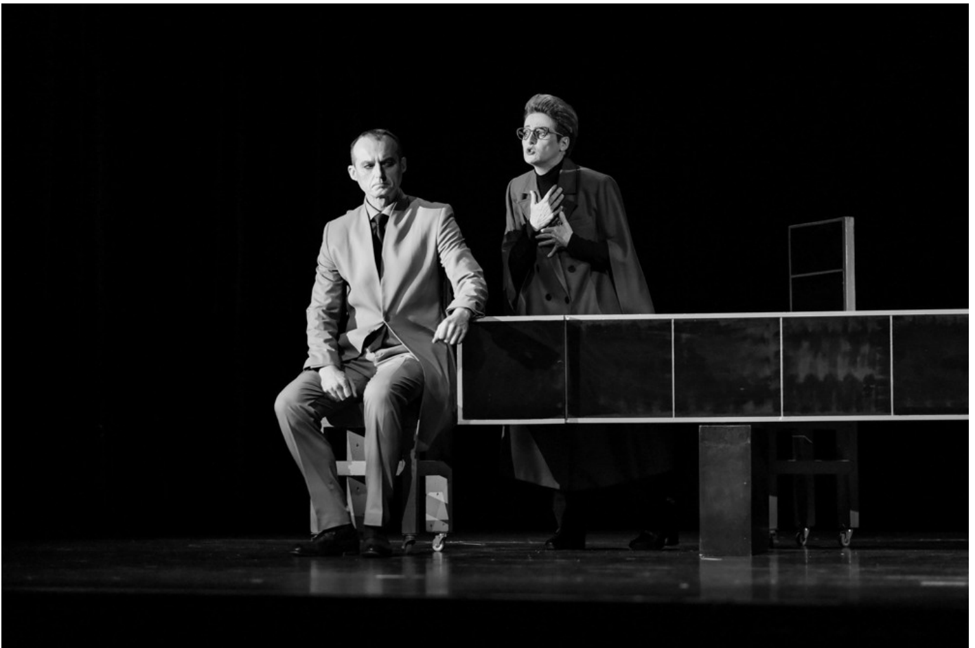
“The White Disease”: the fantastic realism of one wartime