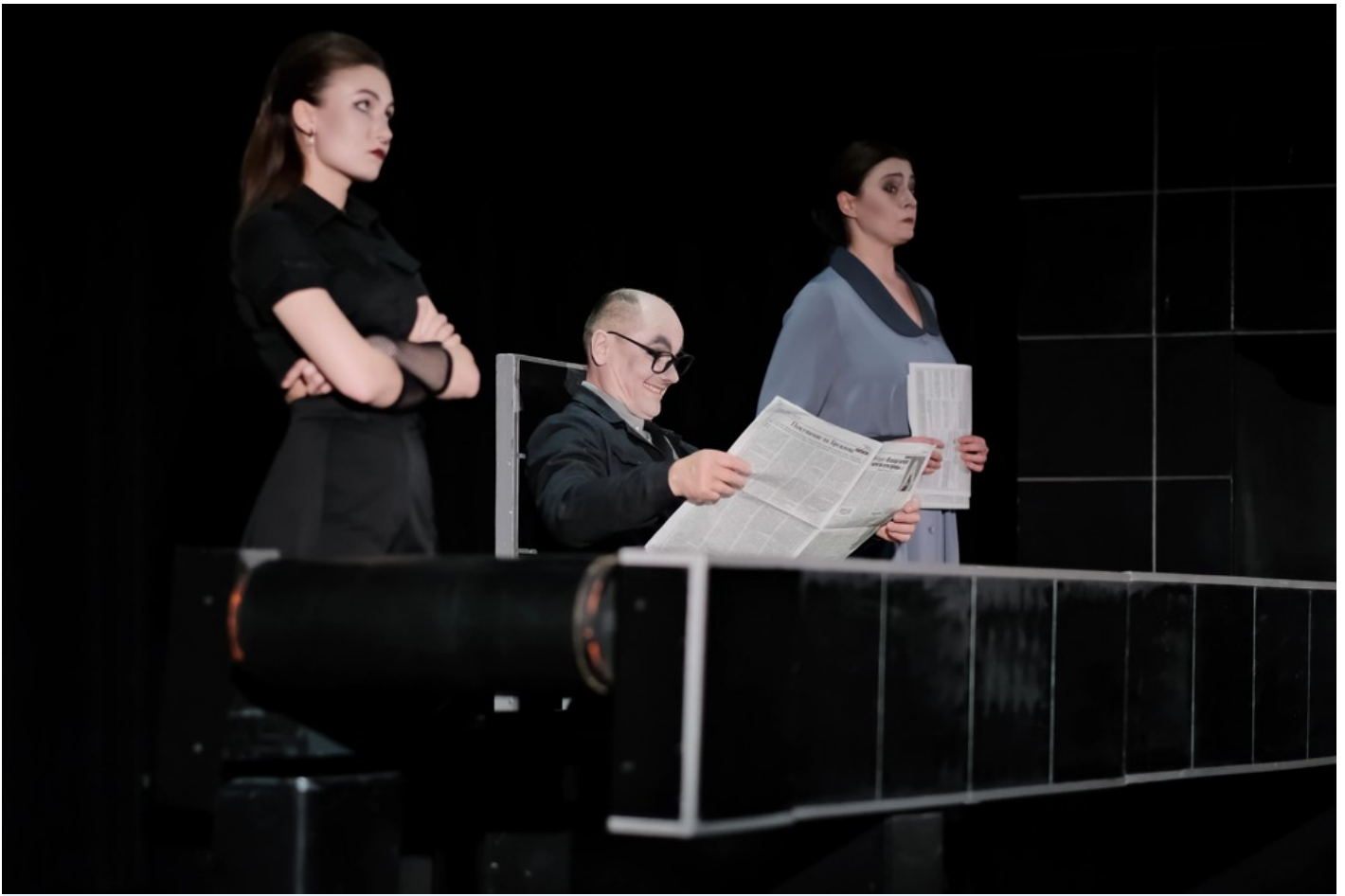
“The White Disease”: the fantastic realism of one wartime