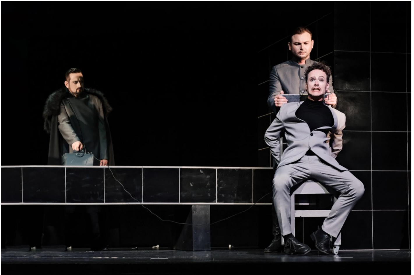
“The White Disease”: the fantastic realism of one wartime