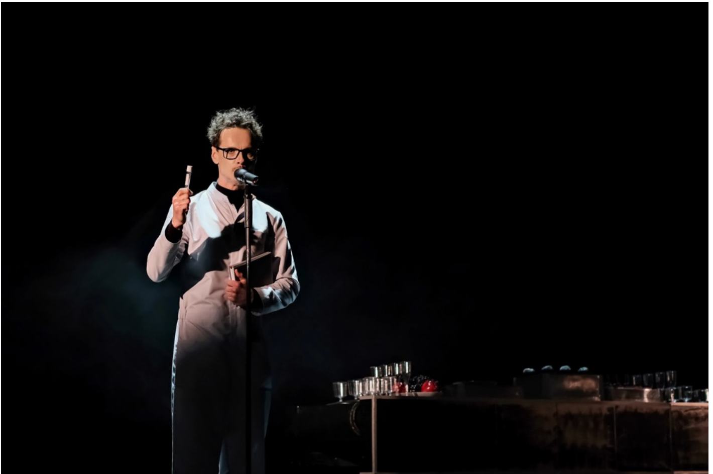
“The White Disease”: the fantastic realism of one wartime