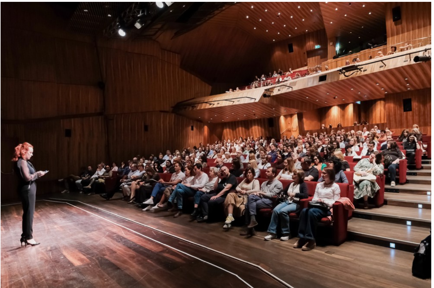
"The White Disease": the fantastic realism of one wartime