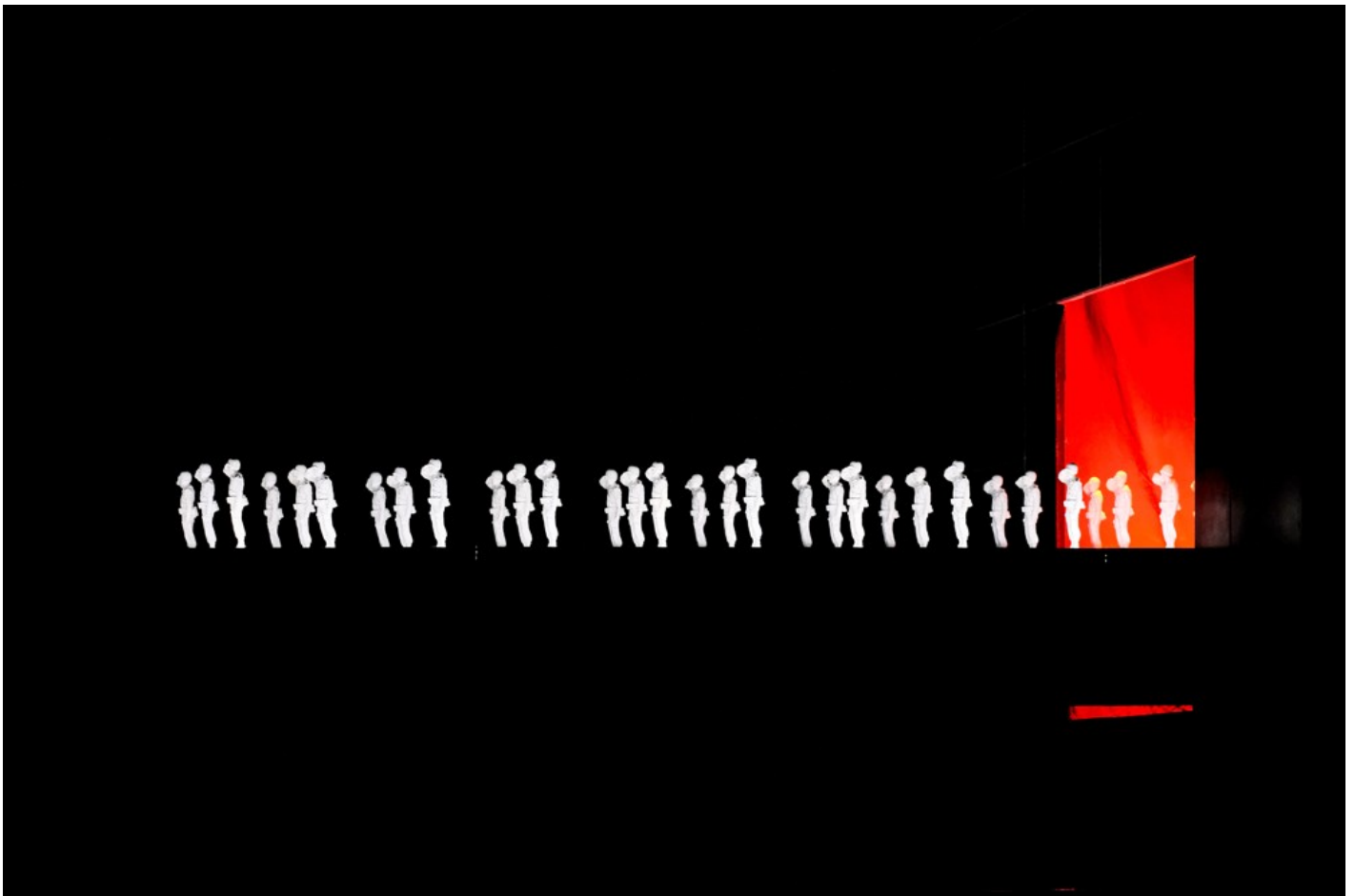
"The White Disease": the fantastic realism of one wartime