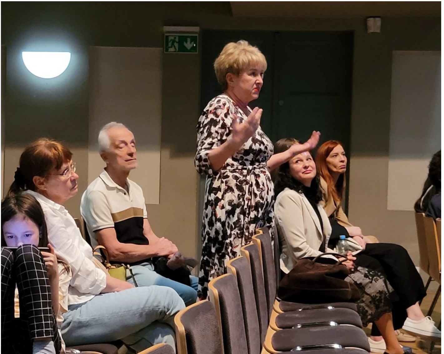
“The White Disease”: the fantastic realism of one wartime