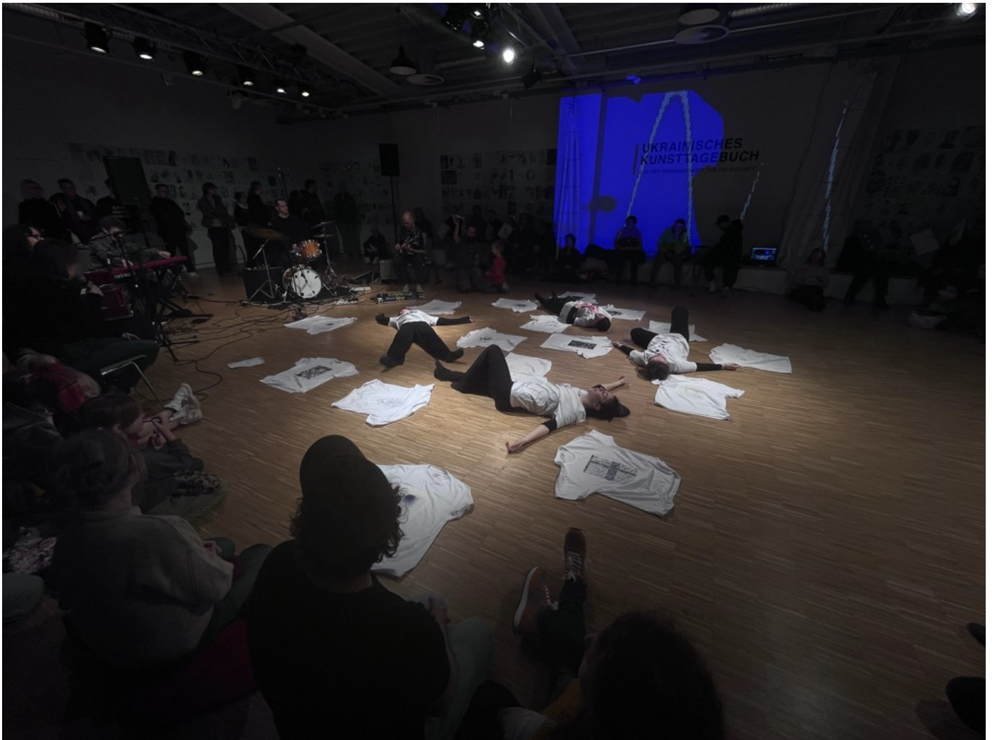
The Ukrainian Diary