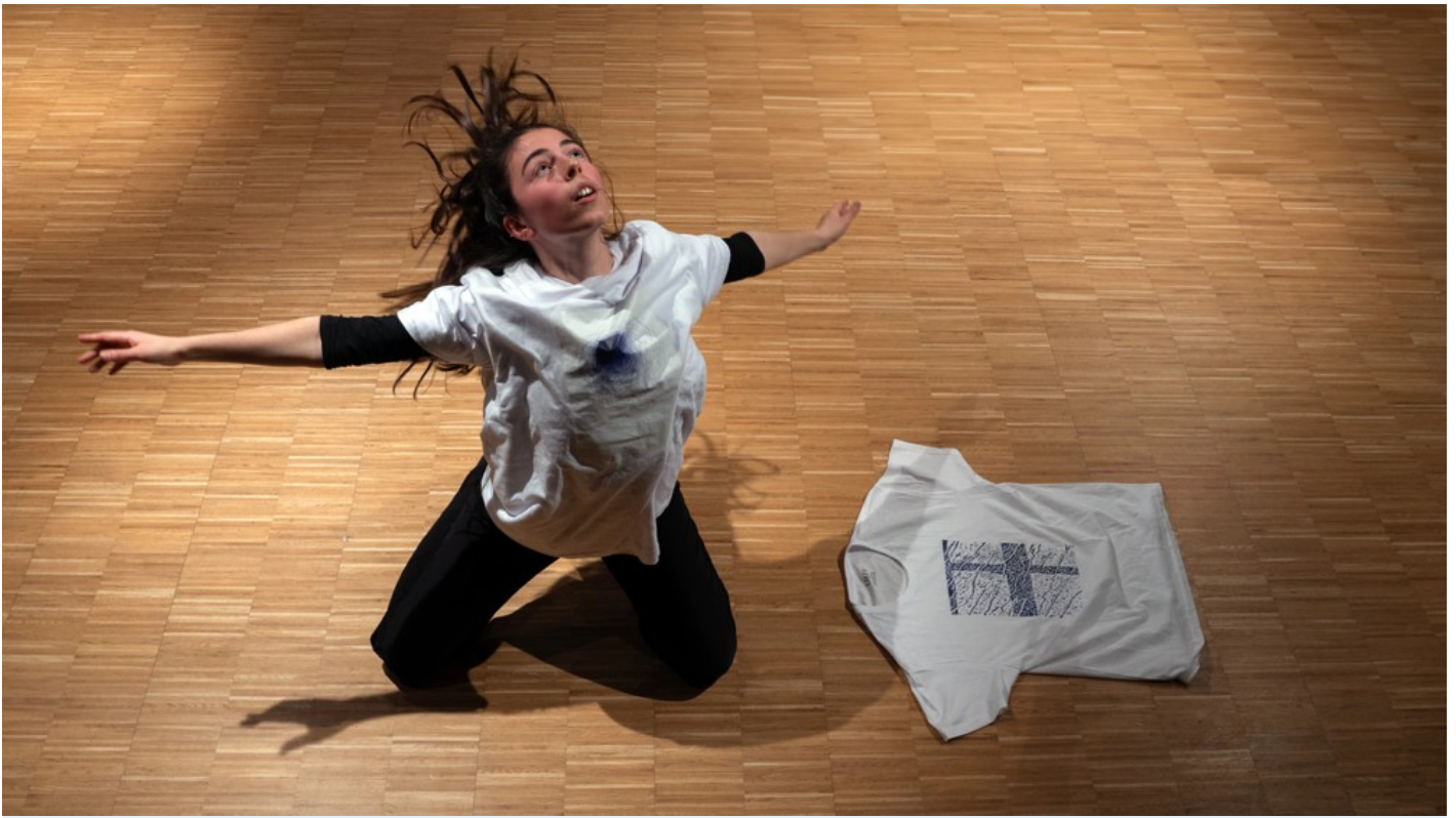
The Ukrainian Diary