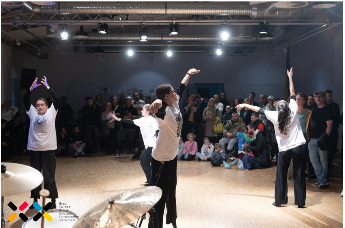
The Ukrainian Diary