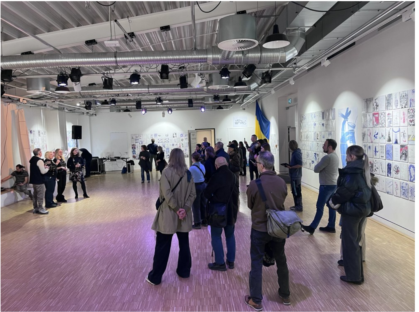
The Ukrainian Diary