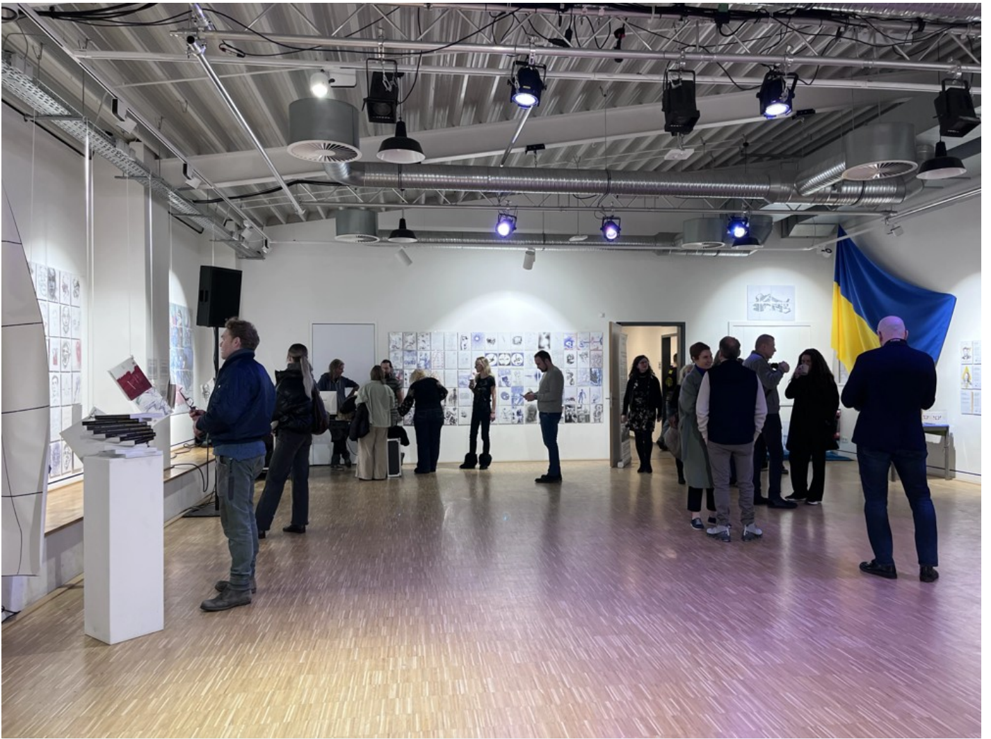
The Ukrainian Diary