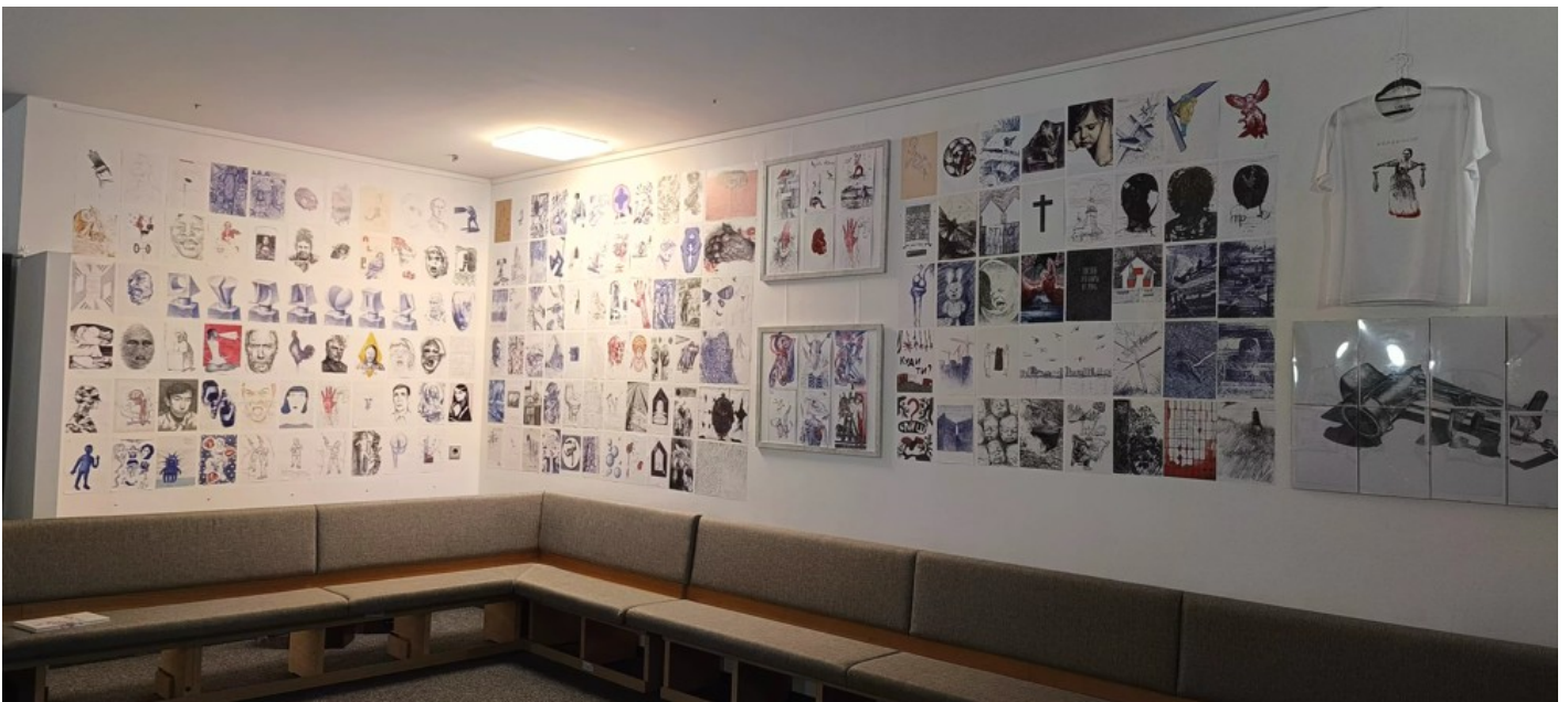
The Ukrainian Diary