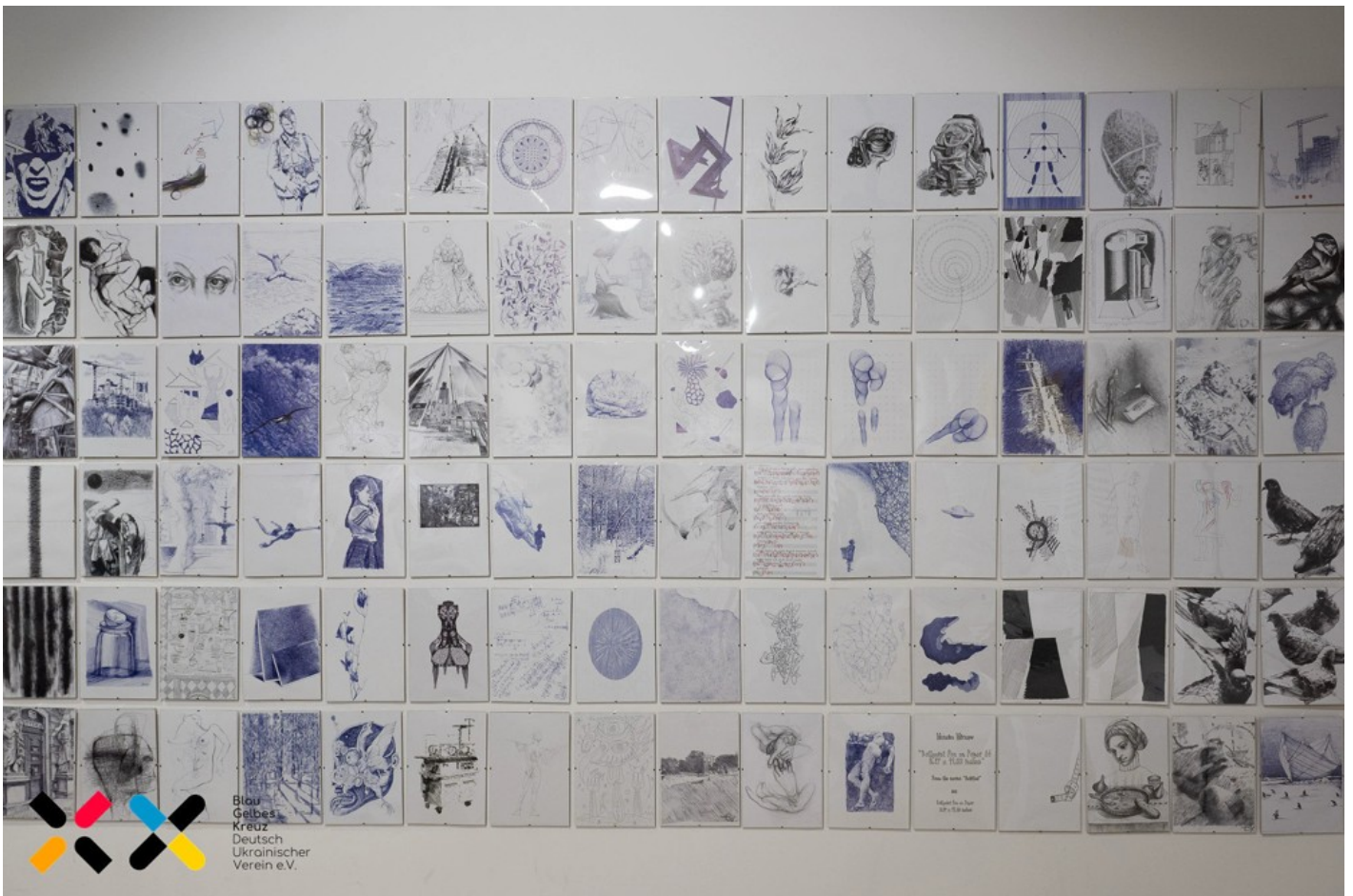
The Ukrainian Diary