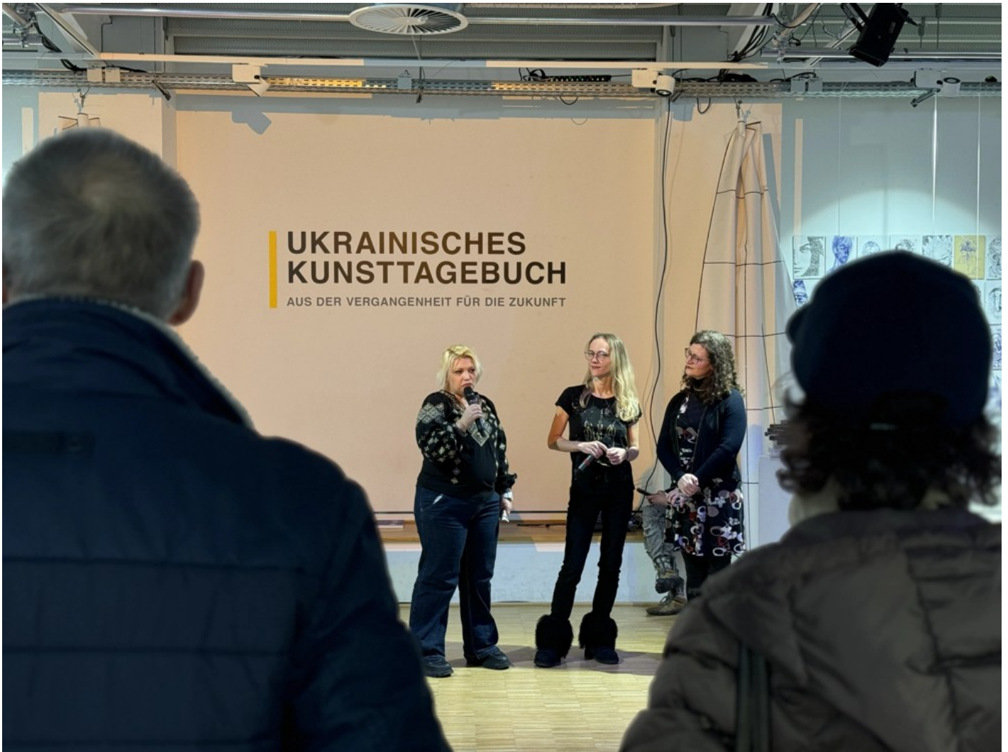
The Ukrainian Diary