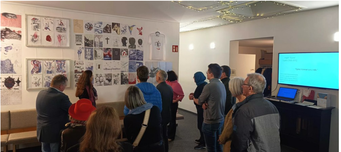
The Ukrainian Diary