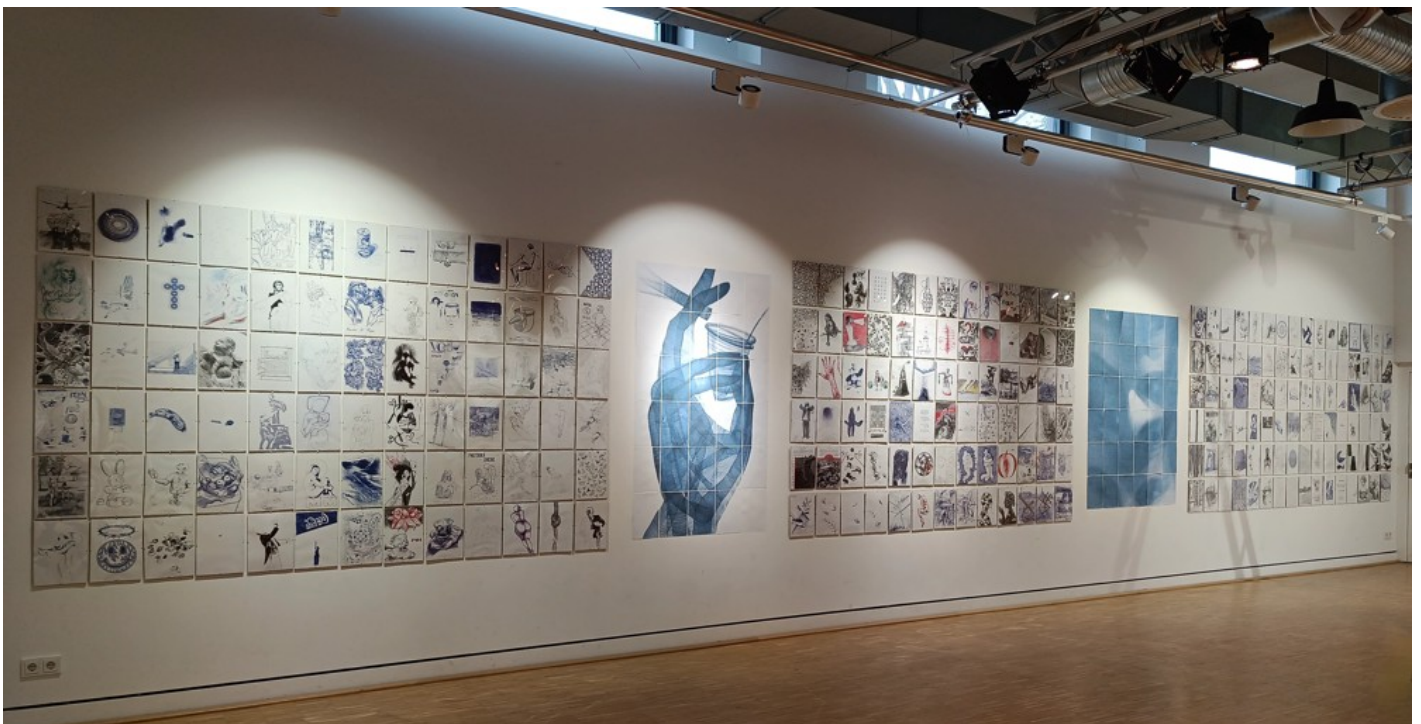
The Ukrainian Diary