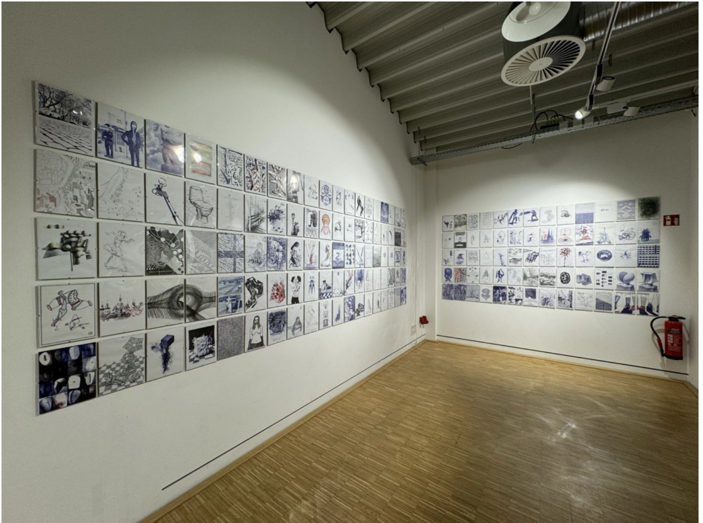
The Ukrainian Diary