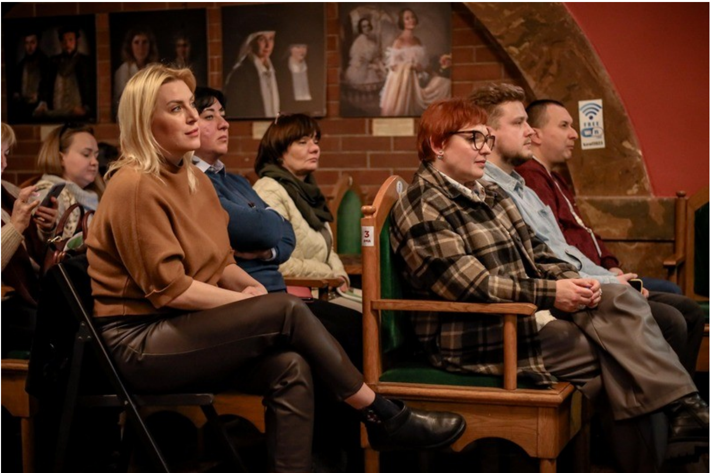
The Gothic Garden of the Organ Hall - a new cultural space in Rivne as an ecological renovation of the territory of the architectural monument