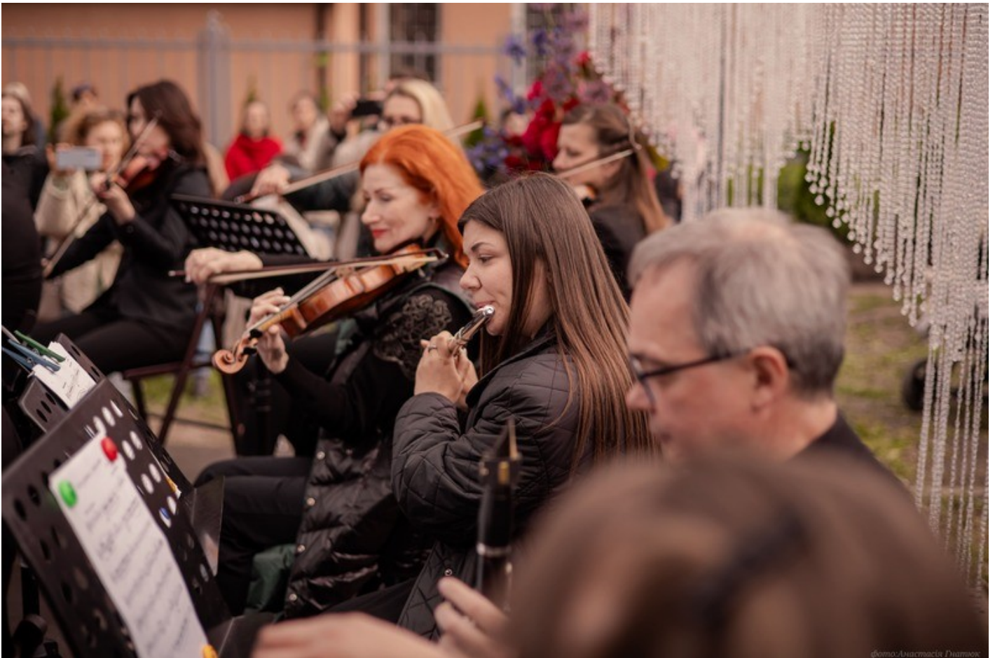
The Gothic Garden of the Organ Hall - a new cultural space in Rivne as an ecological renovation of the territory of the architectural monument