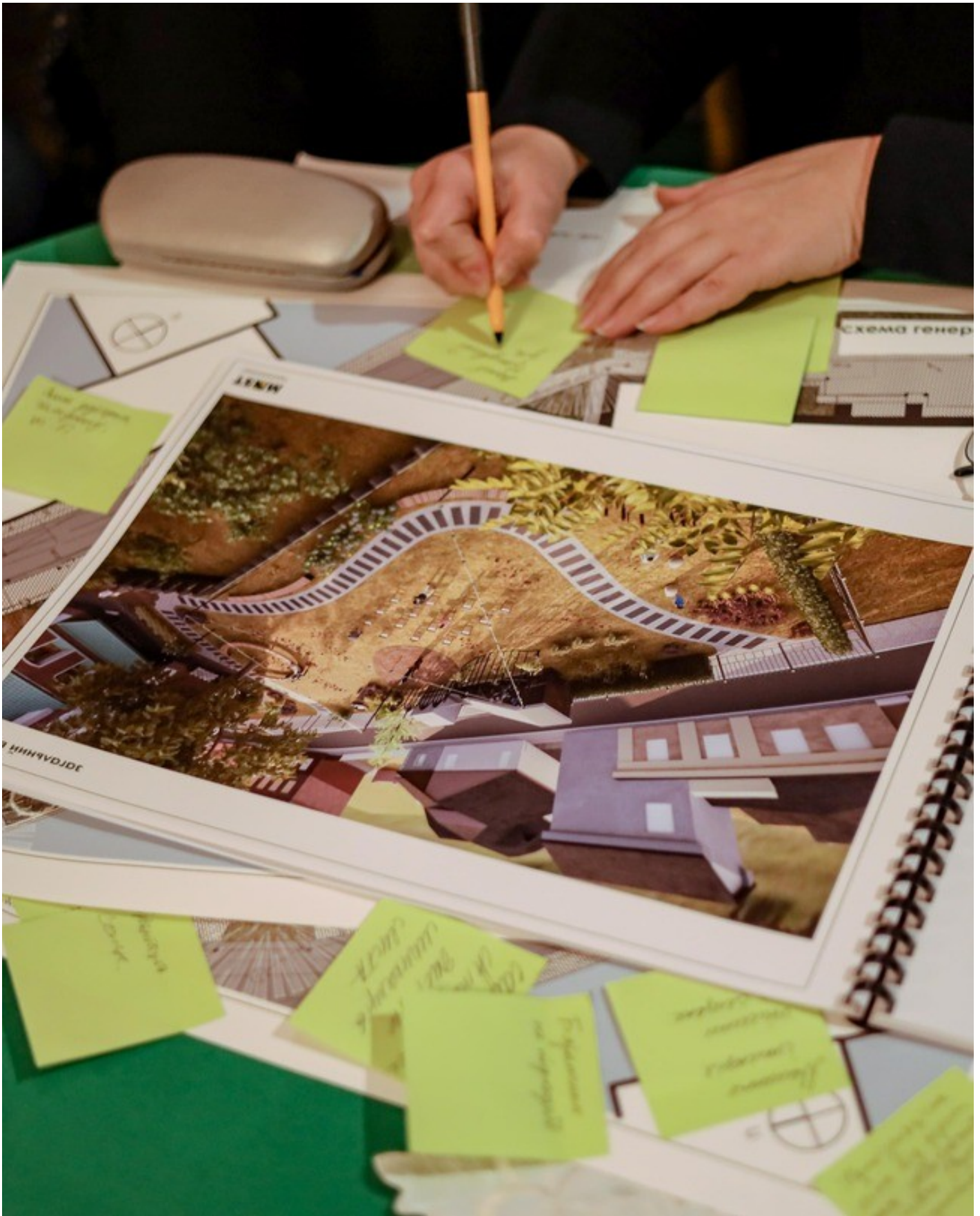
The Gothic Garden of the Organ Hall - a new cultural space in Rivne as an ecological renovation of the territory of the architectural monument