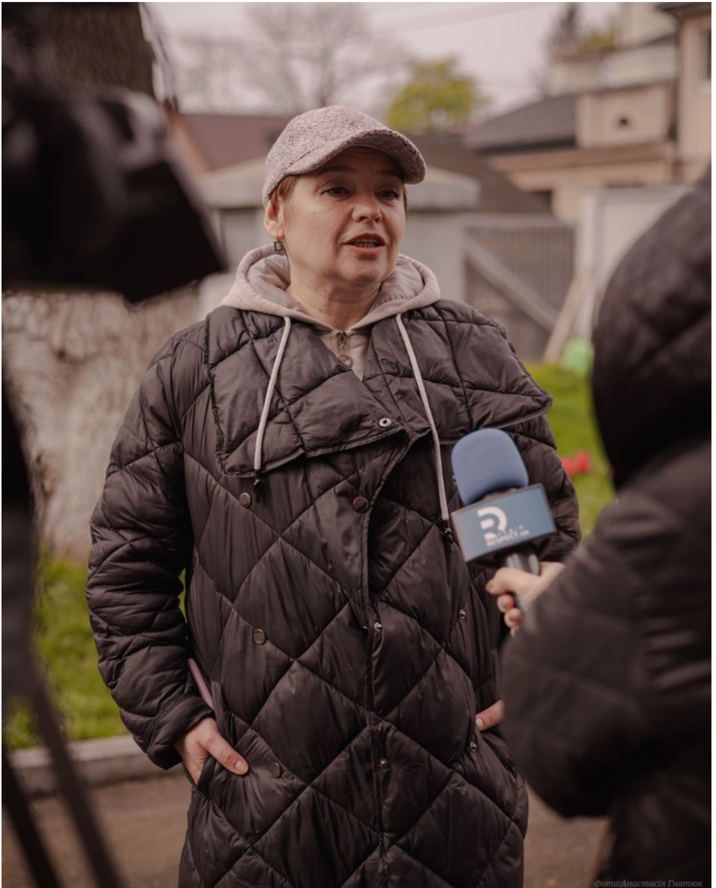
The Gothic Garden of the Organ Hall - a new cultural space in Rivne as an ecological renovation of the territory of the architectural monument