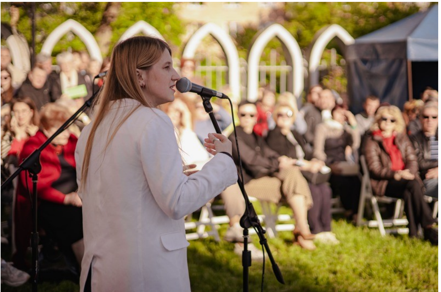
The Gothic Garden of the Organ Hall - a new cultural space in Rivne as an ecological renovation of the territory of the architectural monument