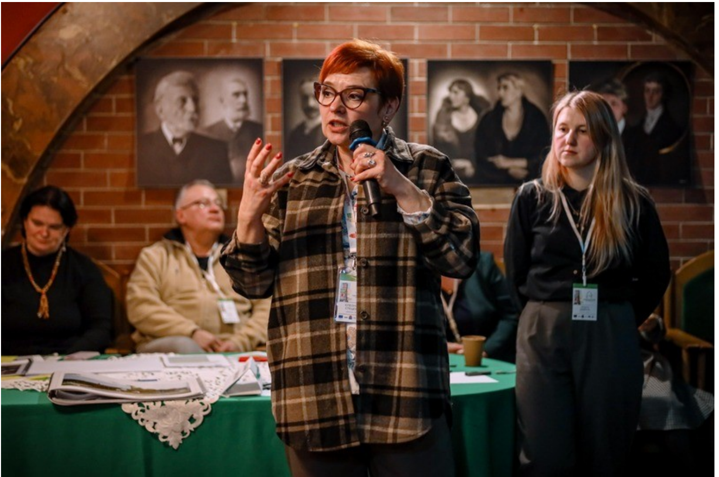
The Gothic Garden of the Organ Hall - a new cultural space in Rivne as an ecological renovation of the territory of the architectural monument