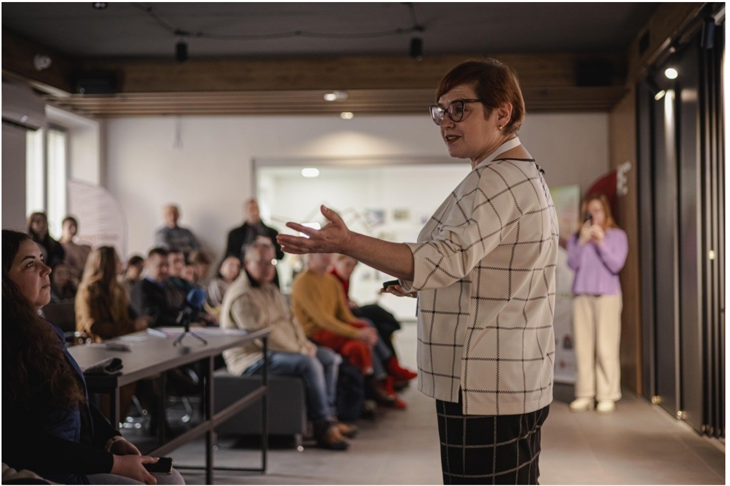
The Gothic Garden of the Organ Hall - a new cultural space in Rivne as an ecological renovation of the territory of the architectural monument