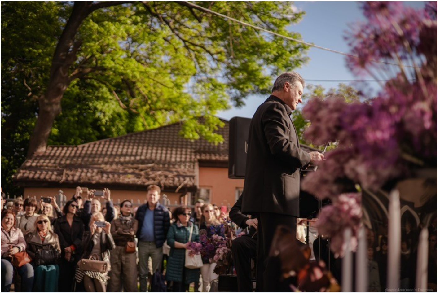
The Gothic Garden of the Organ Hall - a new cultural space in Rivne as an ecological renovation of the territory of the architectural monument