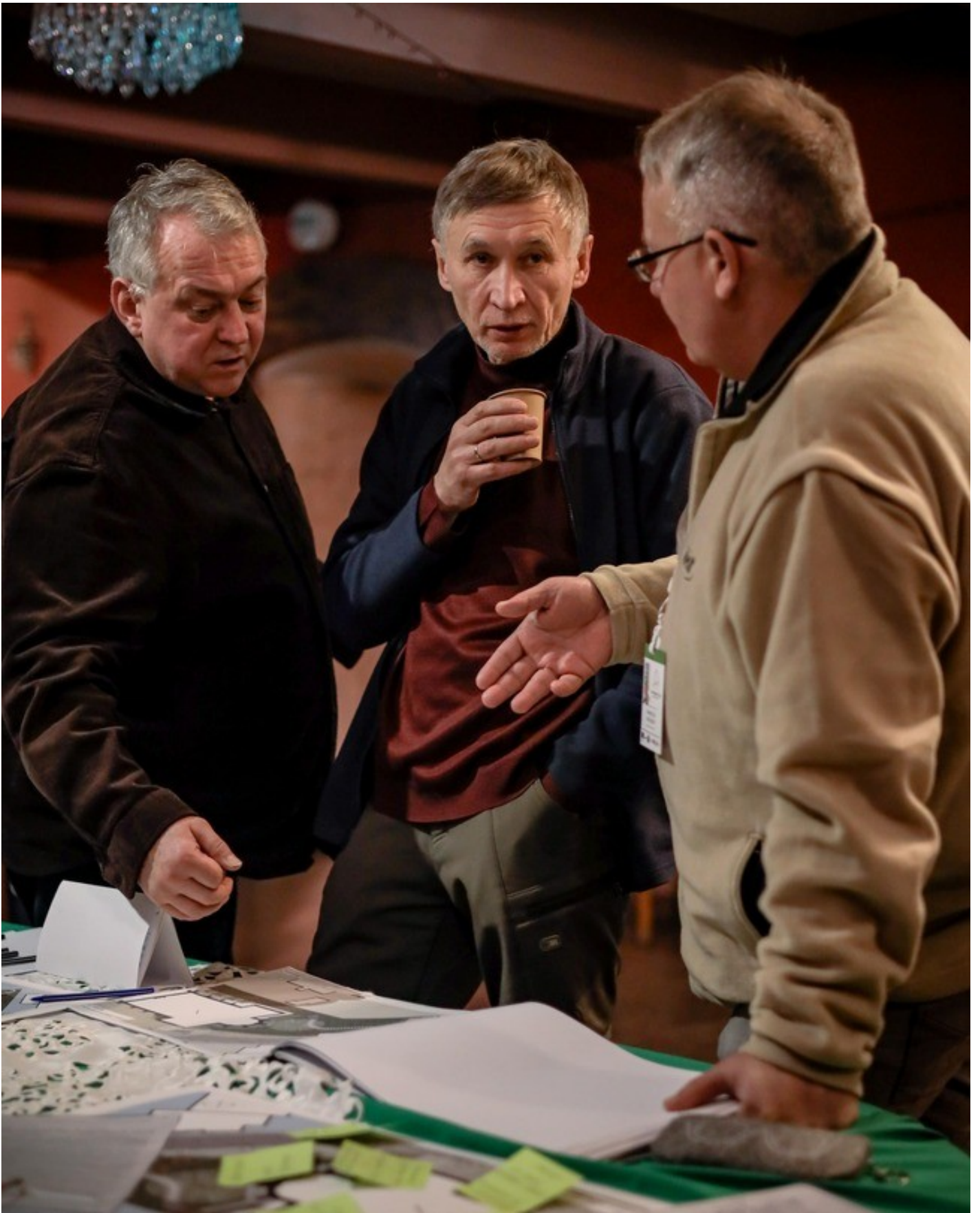
The Gothic Garden of the Organ Hall - a new cultural space in Rivne as an ecological renovation of the territory of the architectural monument