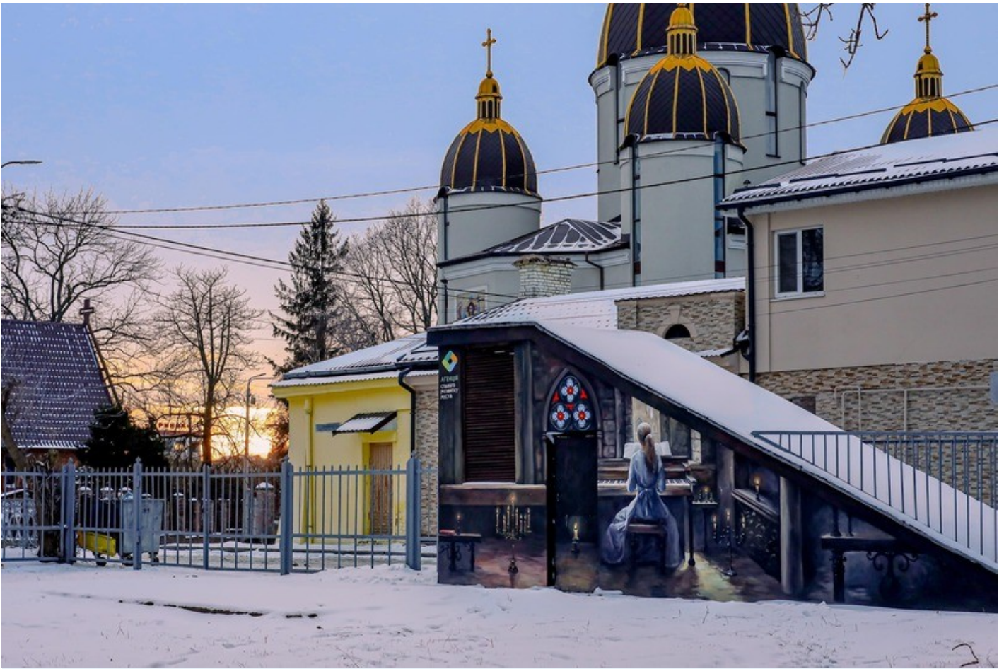
The Gothic Garden of the Organ Hall - a new cultural space in Rivne as an ecological renovation of the territory of the architectural monument