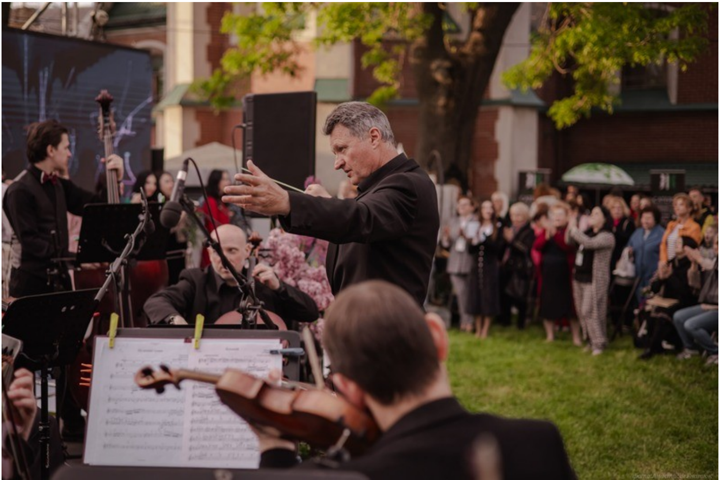
The Gothic Garden of the Organ Hall - a new cultural space in Rivne as an ecological renovation of the territory of the architectural monument