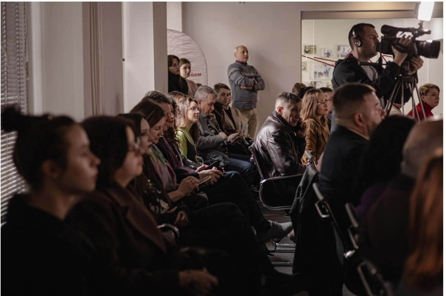
The Gothic Garden of the Organ Hall - a new cultural space in Rivne as an ecological renovation of the territory of the architectural monument