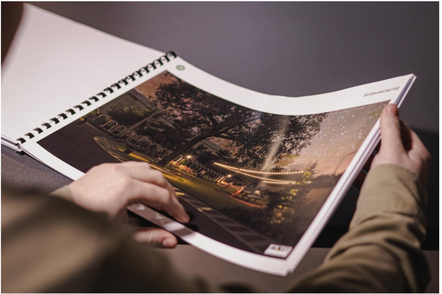
The Gothic Garden of the Organ Hall - a new cultural space in Rivne as an ecological renovation of the territory of the architectural monument