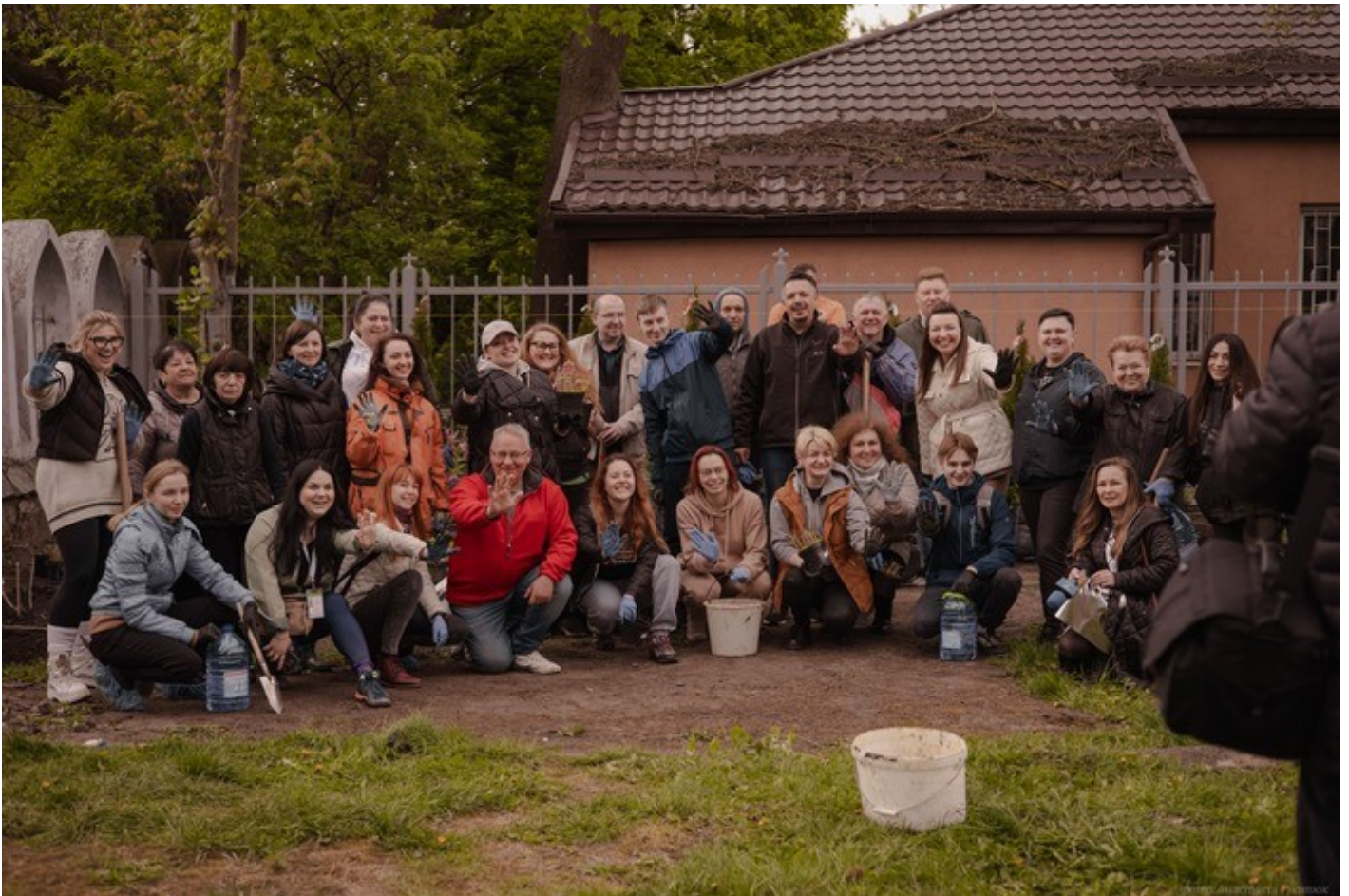
The Gothic Garden of the Organ Hall - a new cultural space in Rivne as an ecological renovation of the territory of the architectural monument