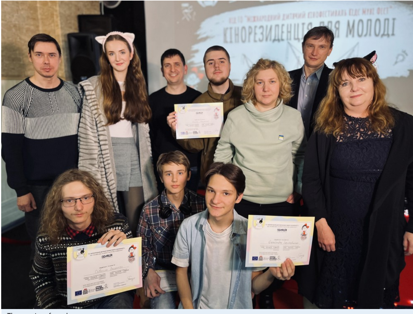
The country of my dreams