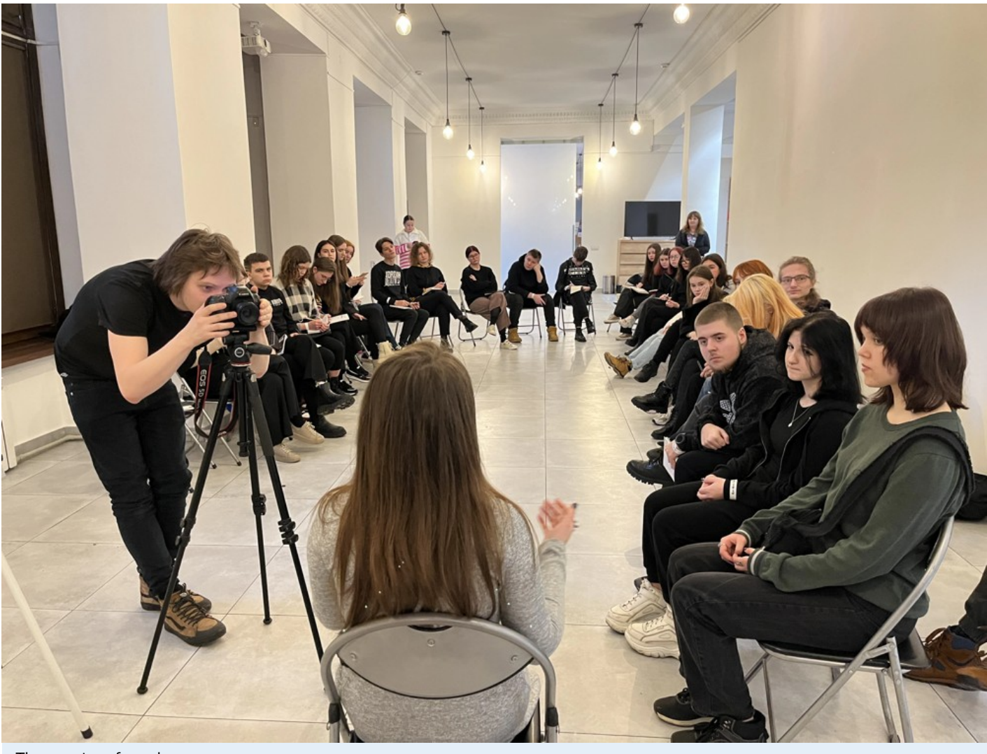
The country of my dreams