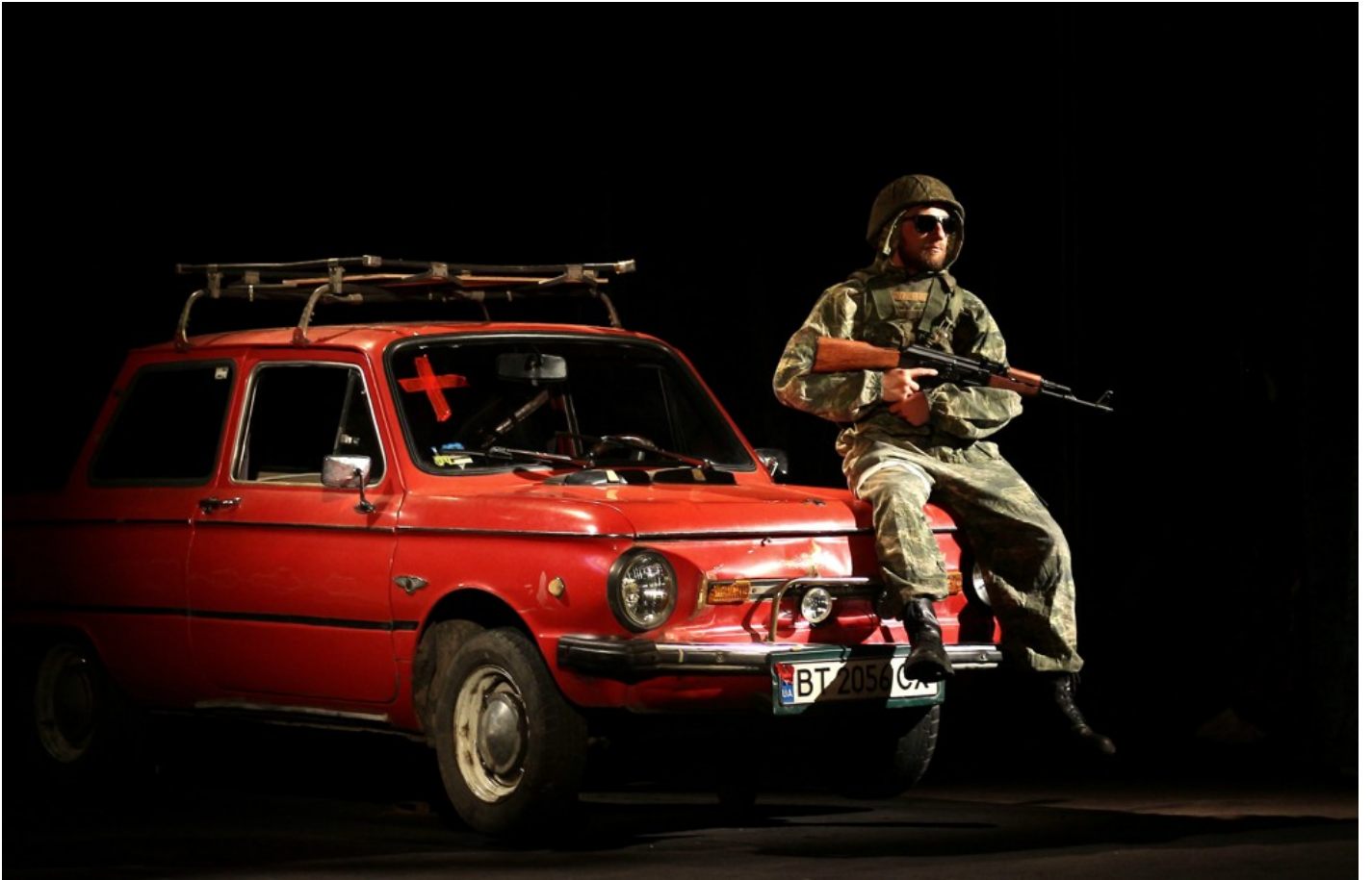
The "Carrier" performance about the south of Ukraine, which in the first days of a full-scale invasion was occupied by Russian military