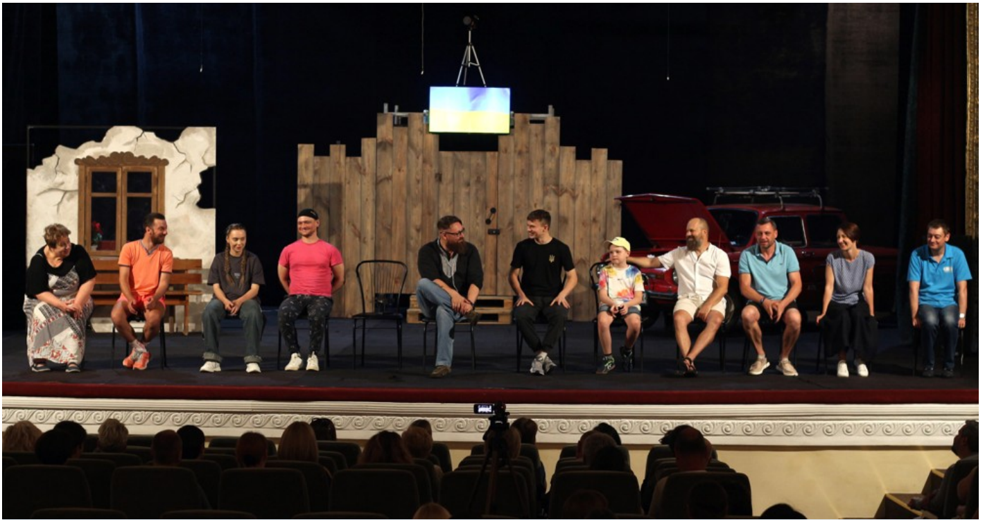
The "Carrier" performance about the south of Ukraine, which in the first days of a full-scale invasion was occupied by Russian military