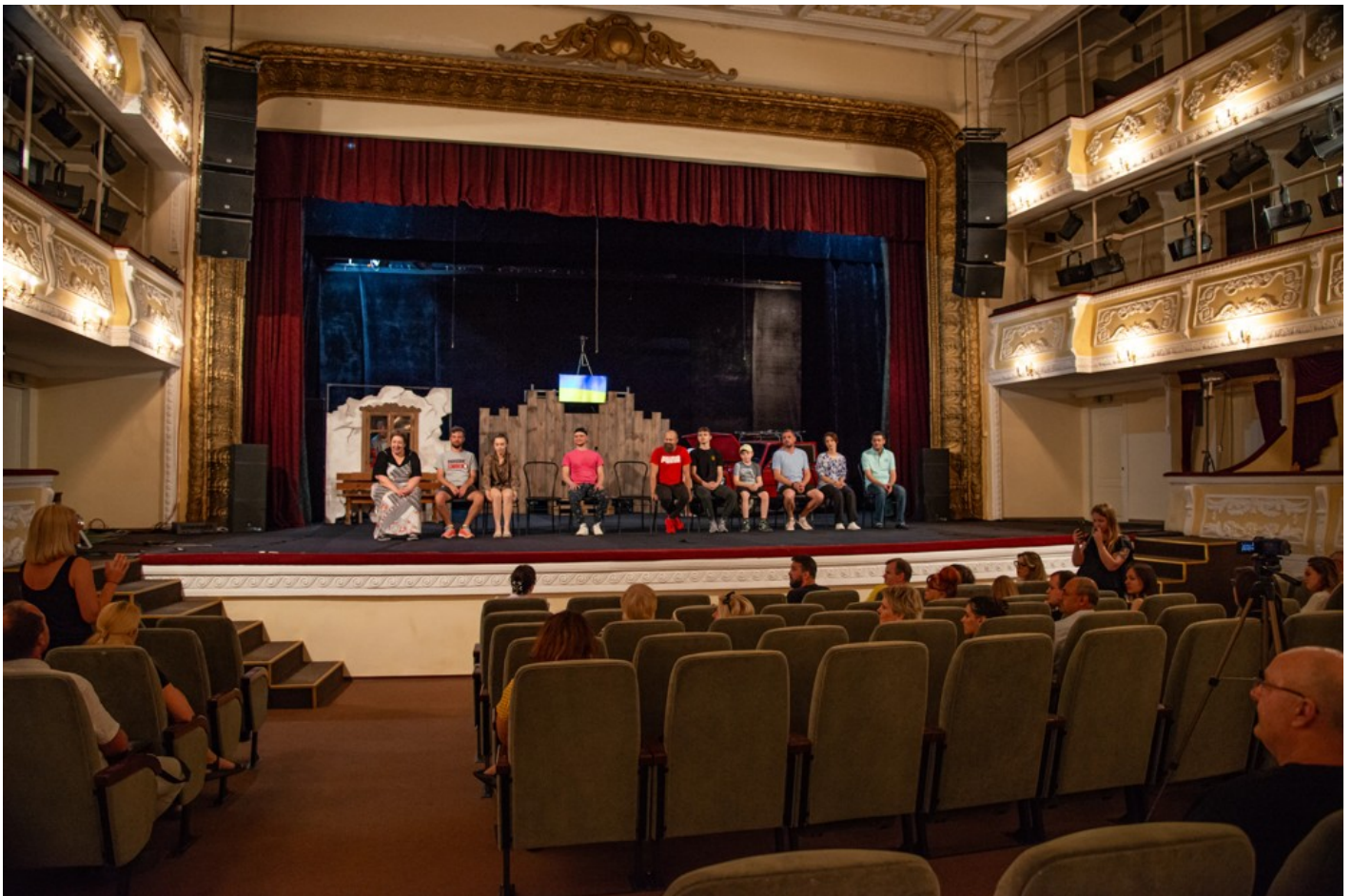
The "Carrier" performance about the south of Ukraine, which in the first days of a full-scale invasion was occupied by Russian military