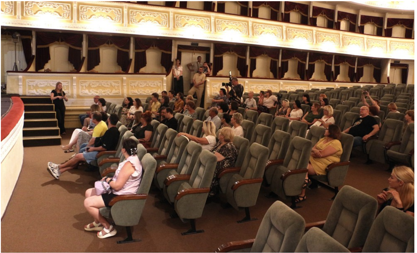
The "Carrier" performance about the south of Ukraine, which in the first days of a full-scale invasion was occupied by Russian military