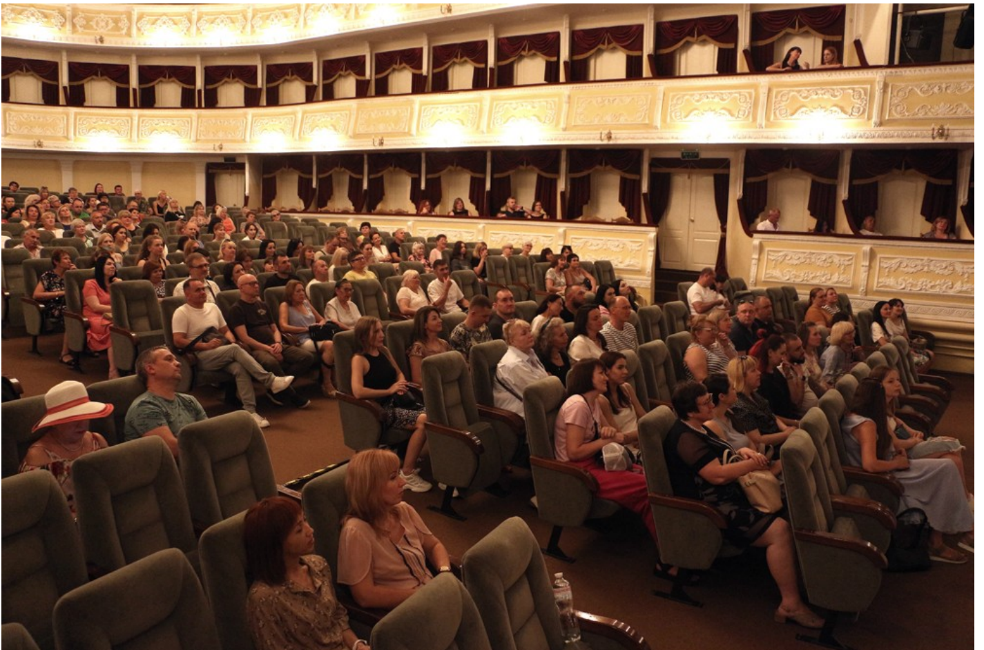
The "Carrier" performance about the south of Ukraine, which in the first days of a full-scale invasion was occupied by Russian military