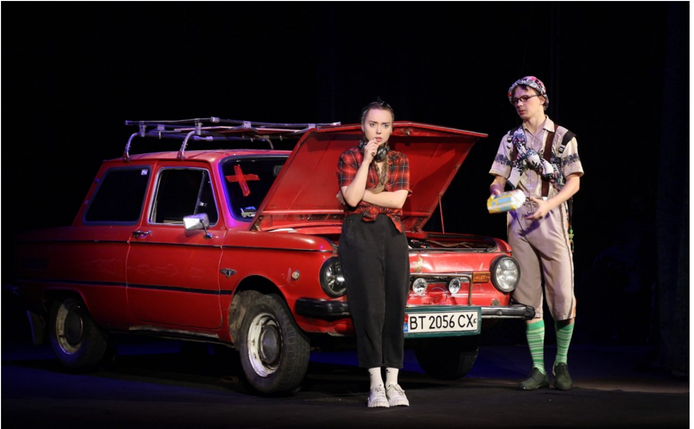
The "Carrier" performance about the south of Ukraine, which in the first days of a full-scale invasion was occupied by Russian military