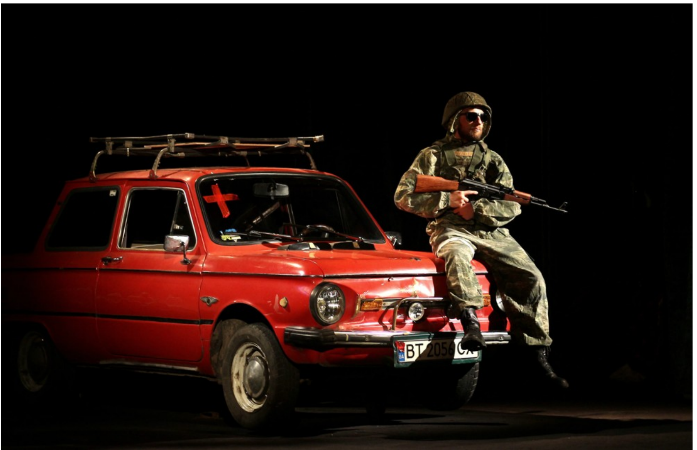
The "Carrier" performance about the south of Ukraine, which in the first days of a full-scale invasion was occupied by Russian military