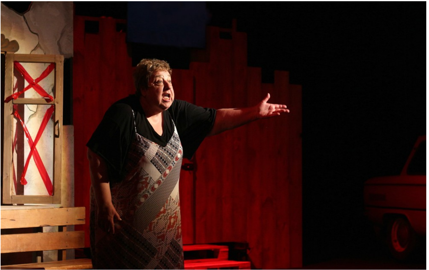
The "Carrier" performance about the south of Ukraine, which in the first days of a full-scale invasion was occupied by Russian military