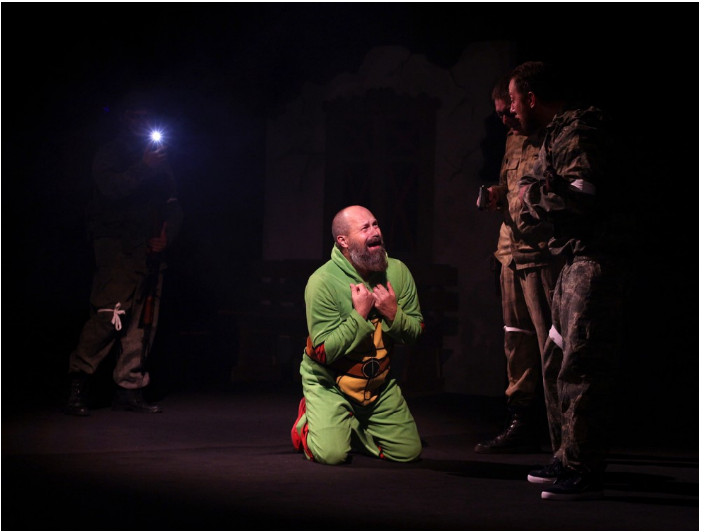
The "Carrier" performance about the south of Ukraine, which in the first days of a full-scale invasion was occupied by Russian military