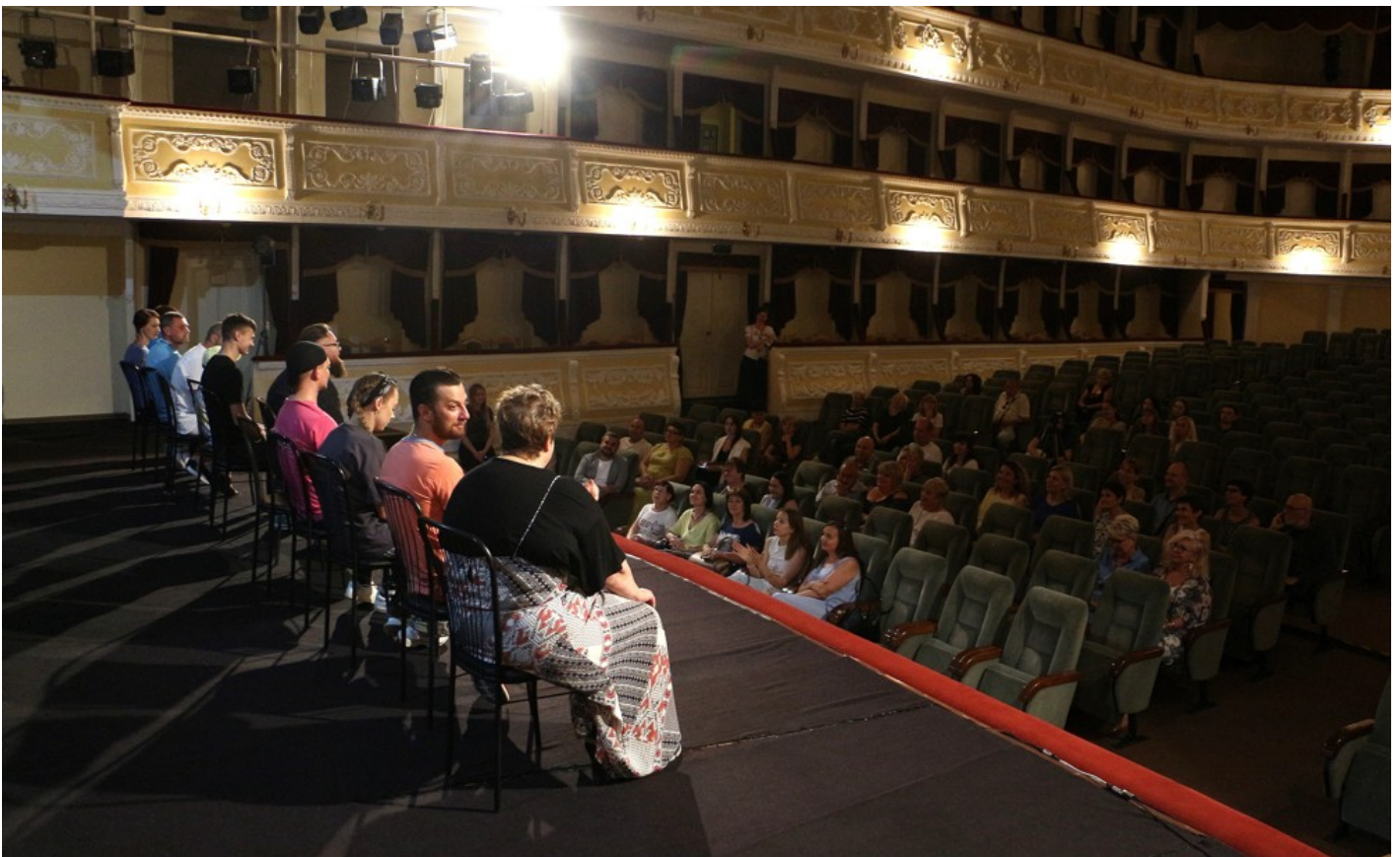
The "Carrier" performance about the south of Ukraine, which in the first days of a full-scale invasion was occupied by Russian military