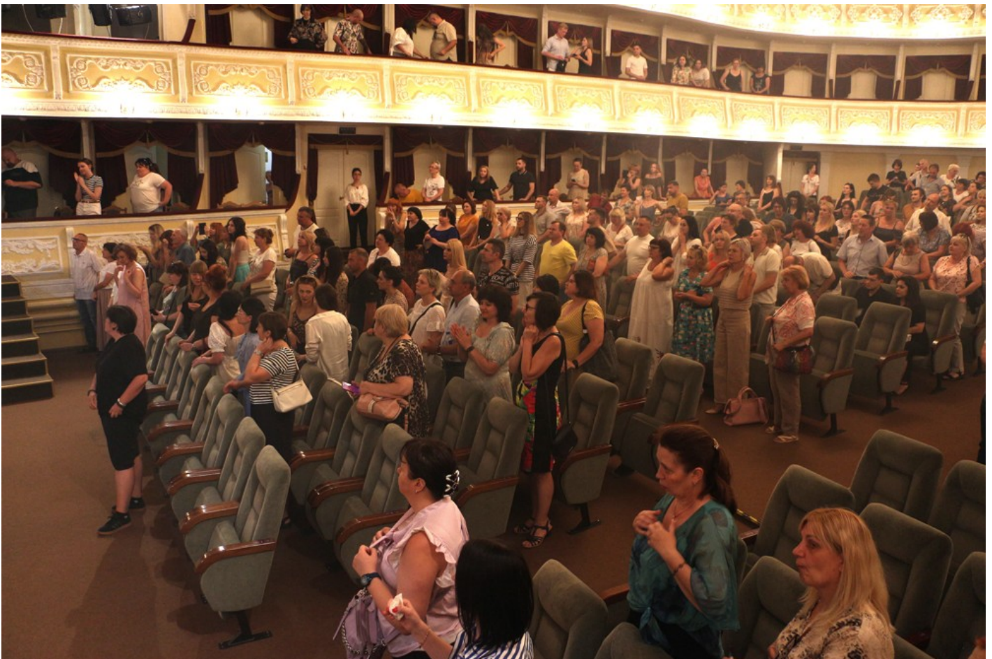
The "Carrier" performance about the south of Ukraine, which in the first days of a full-scale invasion was occupied by Russian military