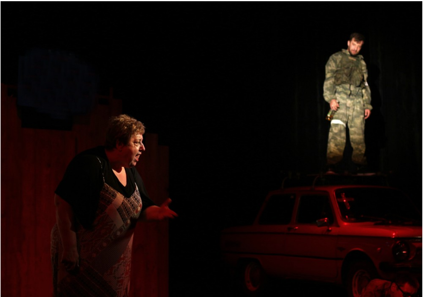
The "Carrier" performance about the south of Ukraine, which in the first days of a full-scale invasion was occupied by Russian military