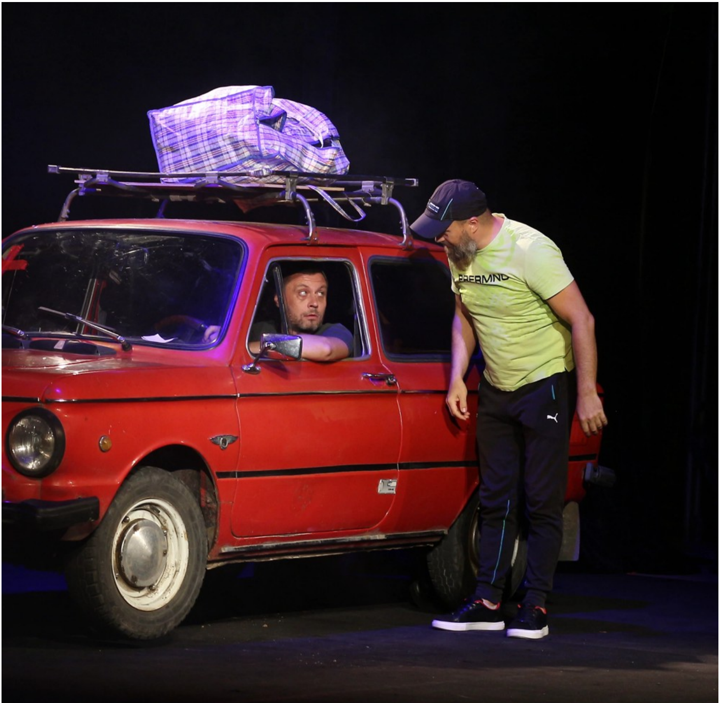
The "Carrier" performance about the south of Ukraine, which in the first days of a full-scale invasion was occupied by Russian military