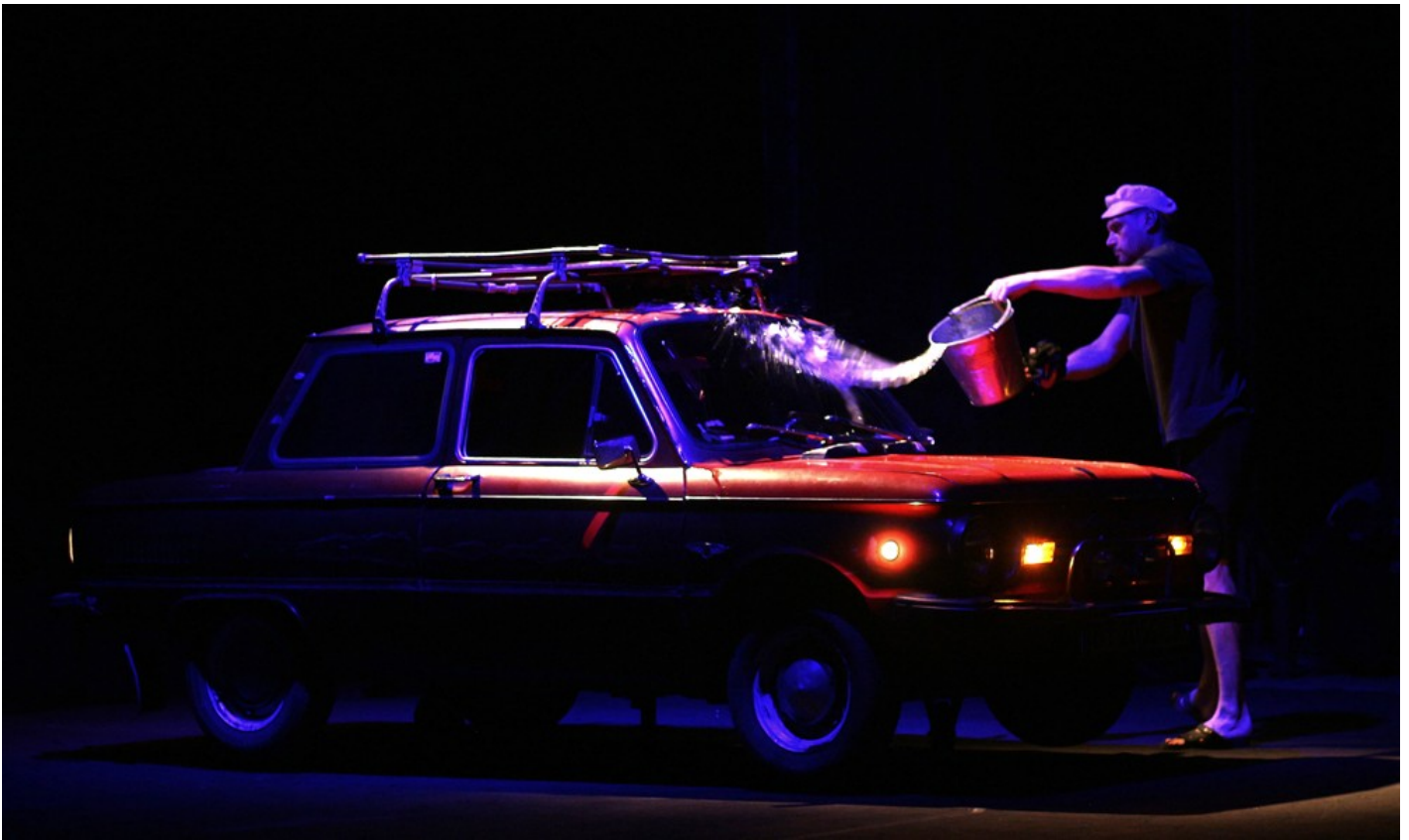
The "Carrier" performance about the south of Ukraine, which in the first days of a full-scale invasion was occupied by Russian military