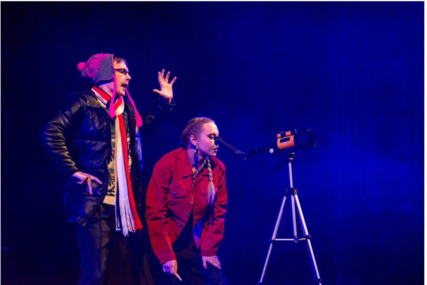
The "Carrier" performance about the south of Ukraine, which in the first days of a full-scale invasion was occupied by Russian military