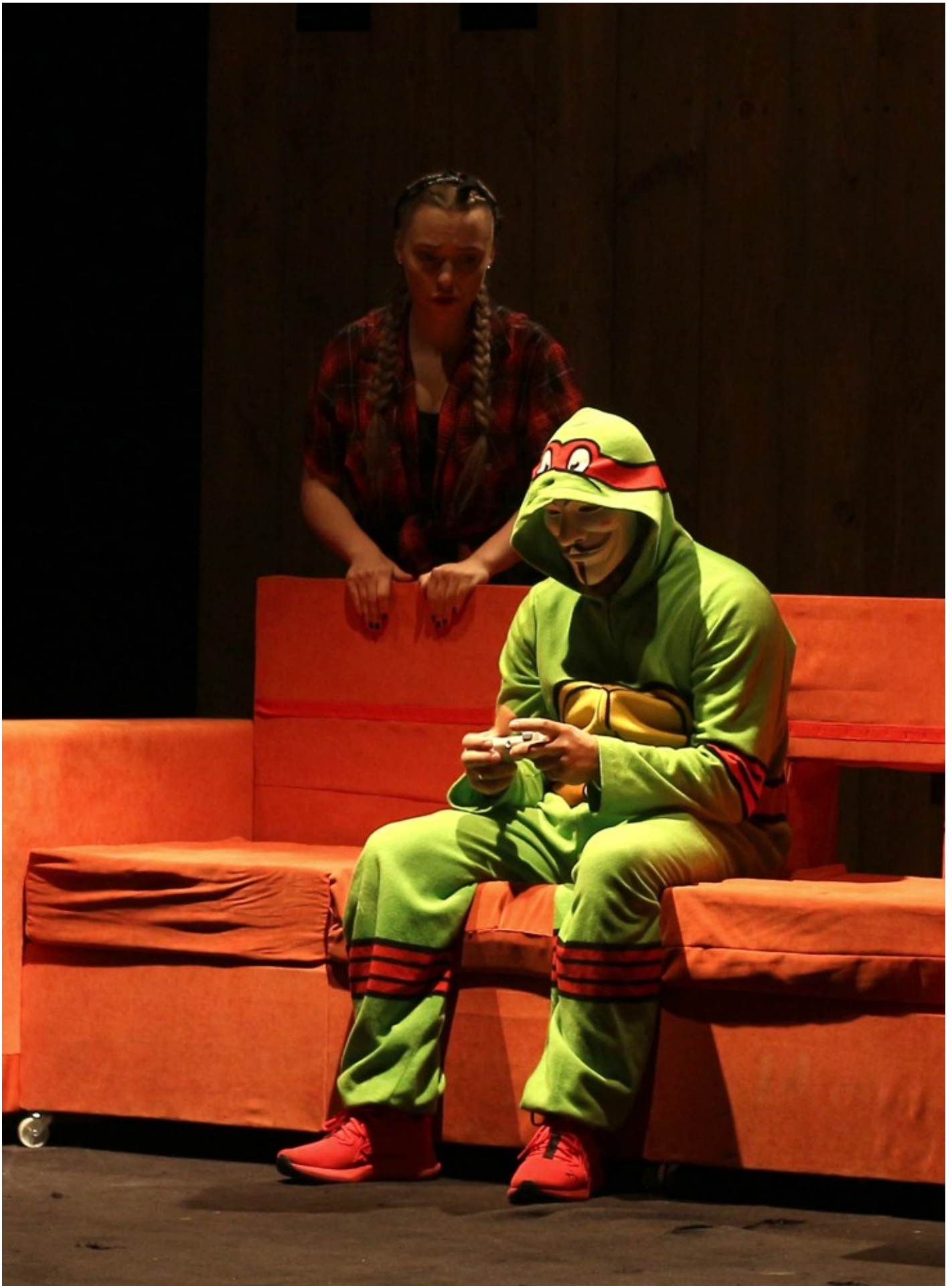
The "Carrier" performance about the south of Ukraine, which in the first days of a full-scale invasion was occupied by Russian military