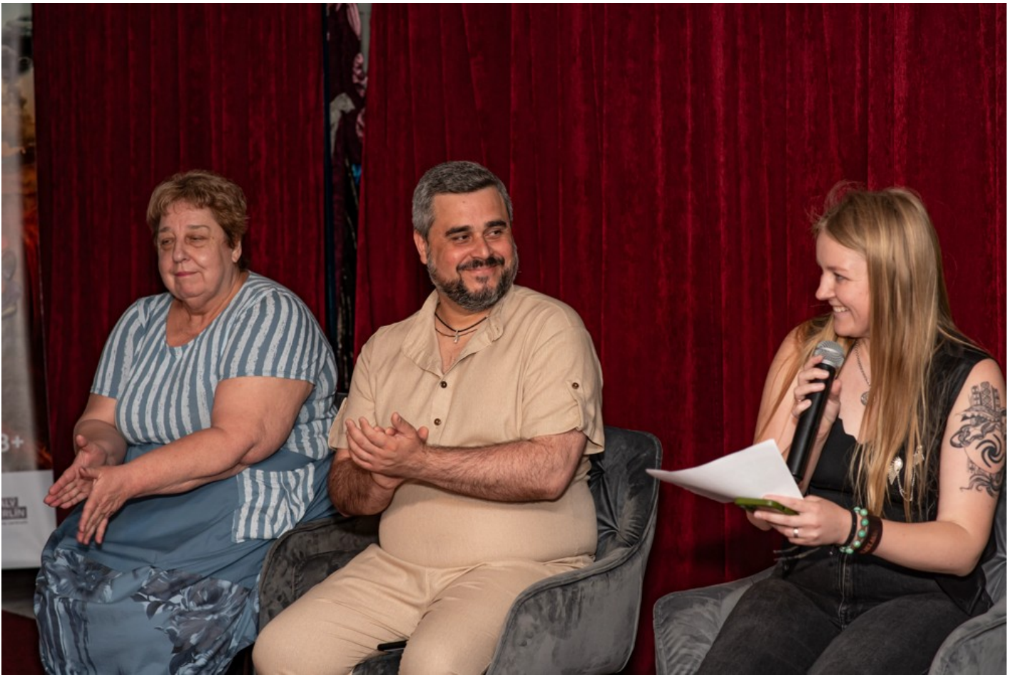
The "Carrier" performance about the south of Ukraine, which in the first days of a full-scale invasion was occupied by Russian military