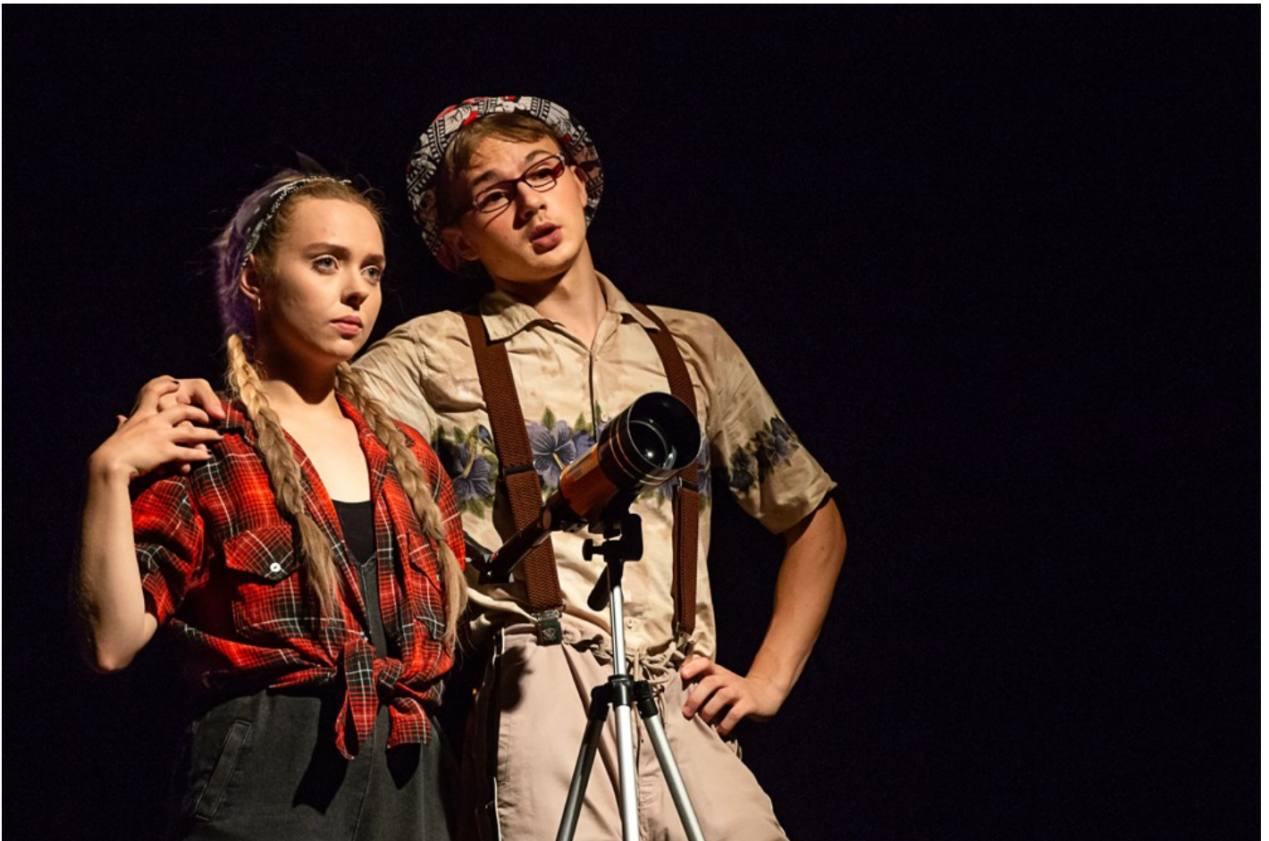
The "Carrier" performance about the south of Ukraine, which in the first days of a full-scale invasion was occupied by Russian military