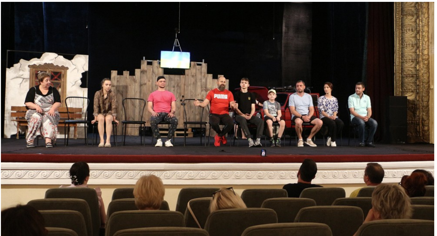
The "Carrier" performance about the south of Ukraine, which in the first days of a full-scale invasion was occupied by Russian military