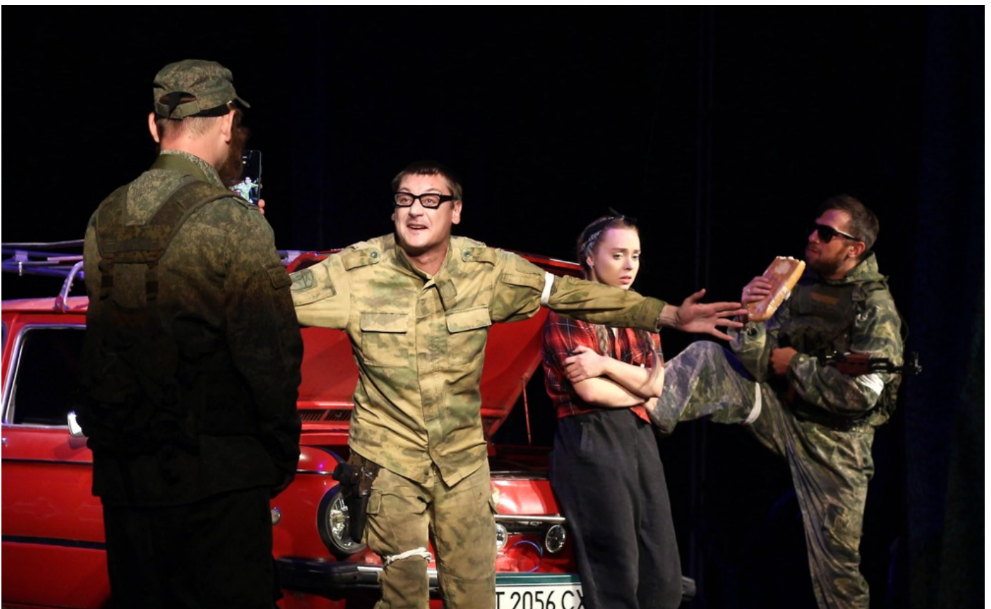
The "Carrier" performance about the south of Ukraine, which in the first days of a full-scale invasion was occupied by Russian military