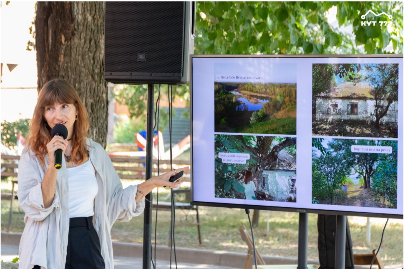
Architectural and artistic research residence "Angle 772"