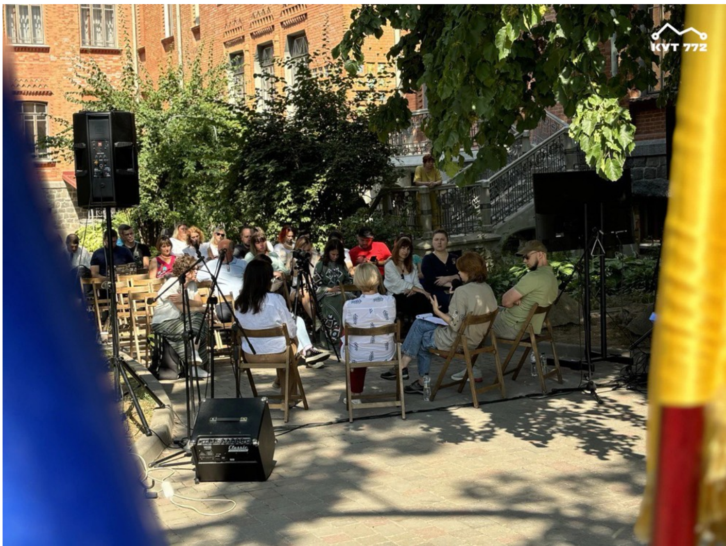
Architectural and artistic research residence "Angle 772"