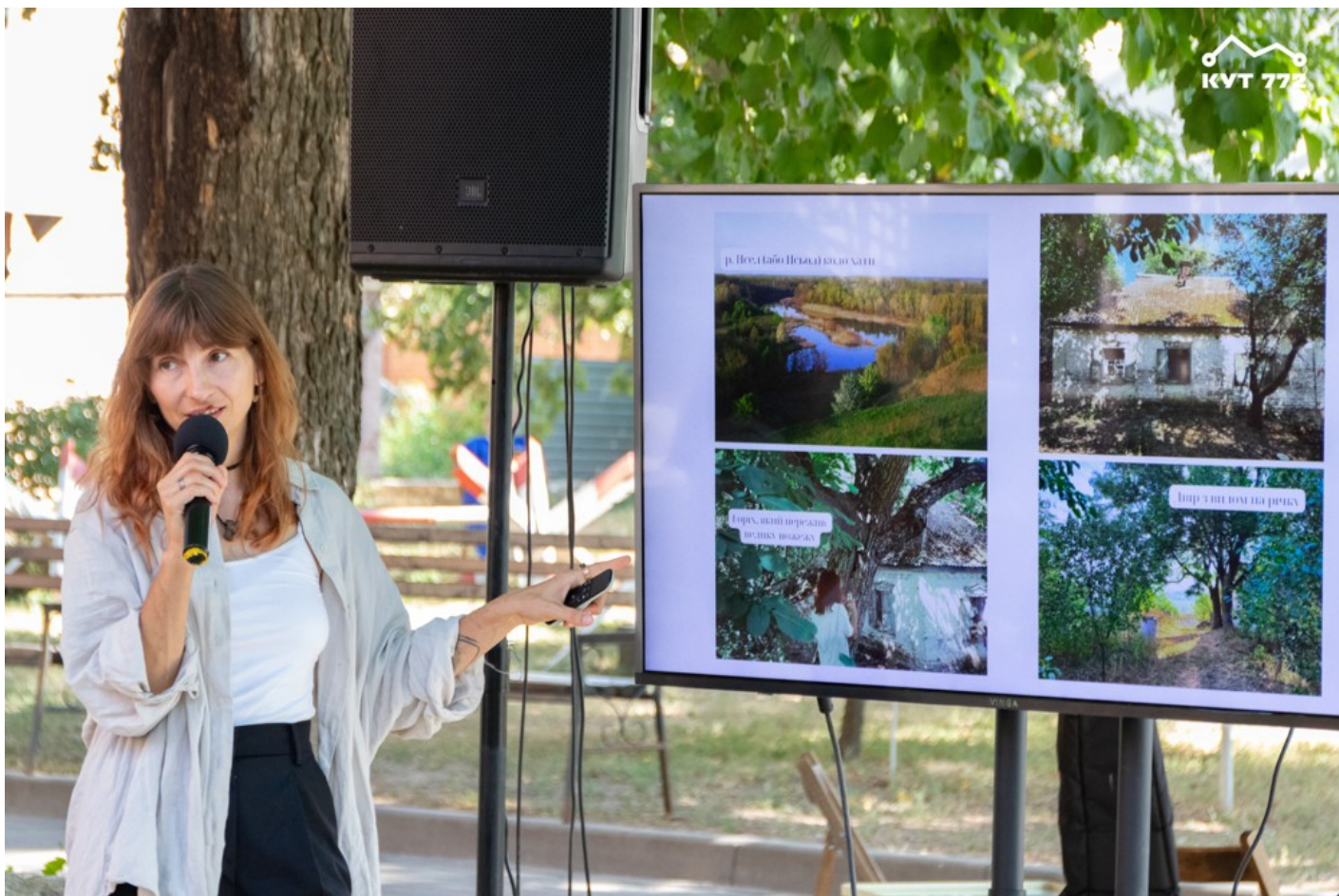
Architectural and artistic research residence "Angle 772"