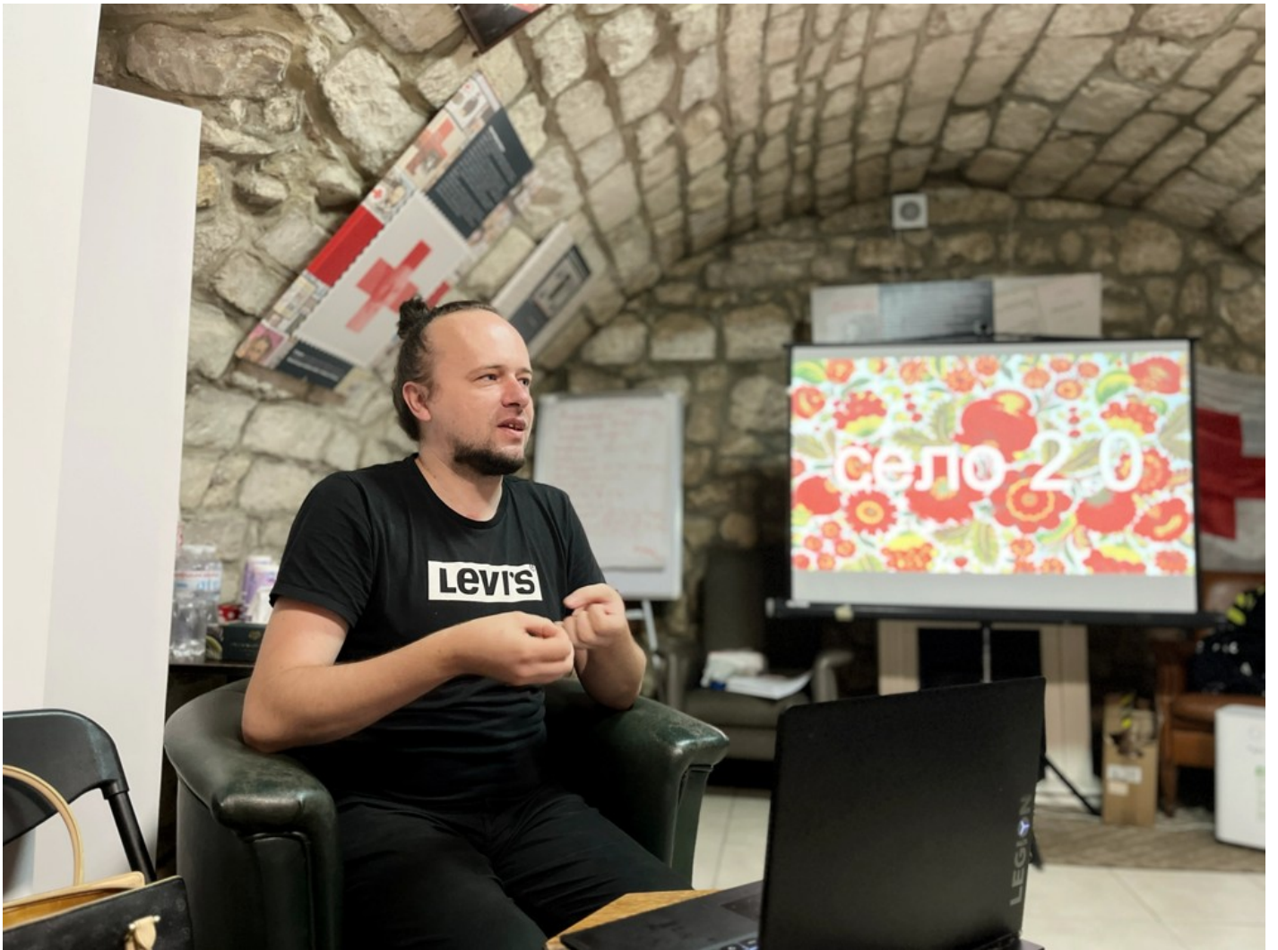
Architectural and artistic research residence "Angle 772"