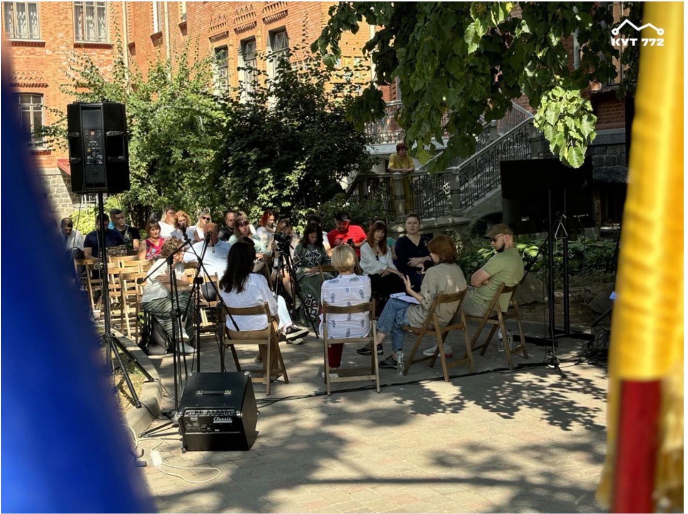
Architectural and artistic research residence "Angle 772"