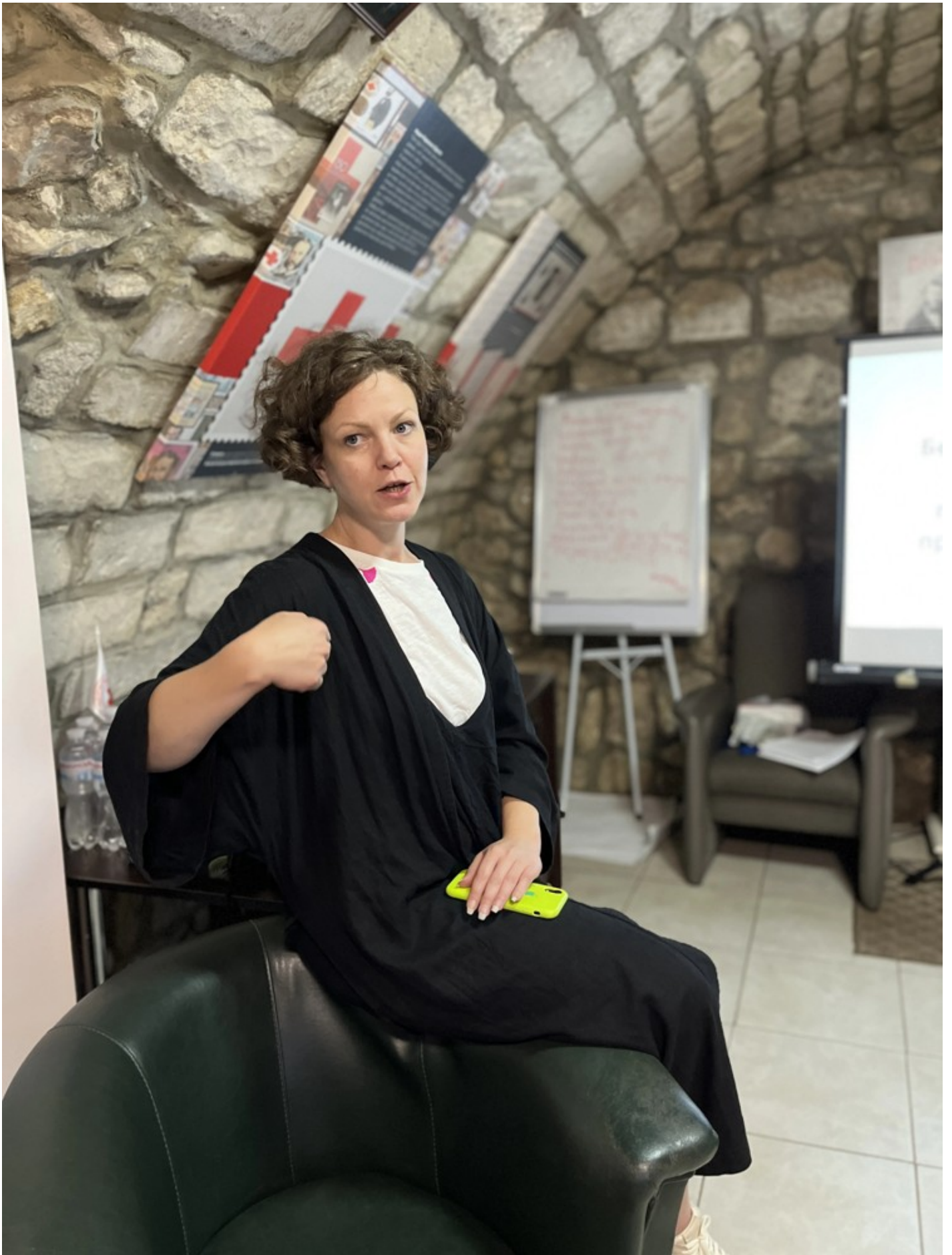
Architectural and artistic research residence "Angle 772"