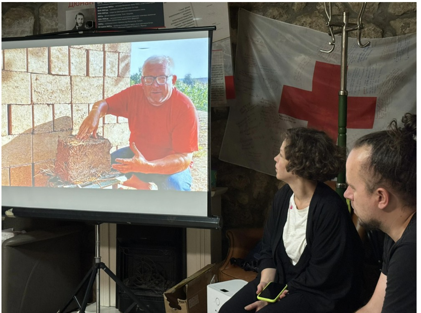
Architectural and artistic research residence "Angle 772"