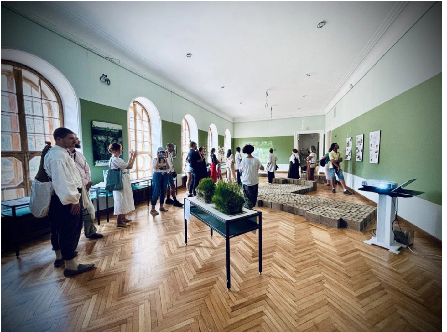
Architectural and artistic research residence "Angle 772"