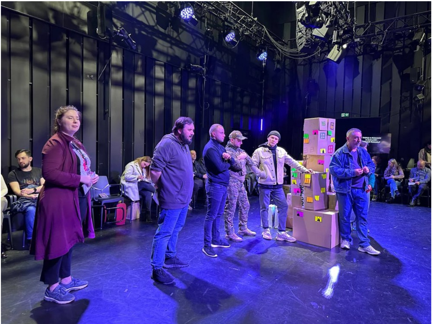
Tour of the interactive show-performance of art therapy "Mariupol #nadiya_na_svitanok"