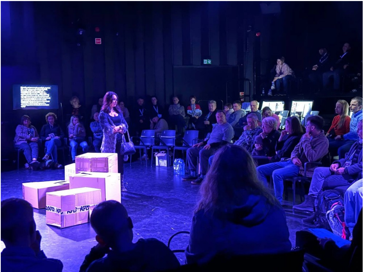
Tour of the interactive show-performance of art therapy "Mariupol #nadiya_na_svitanok"