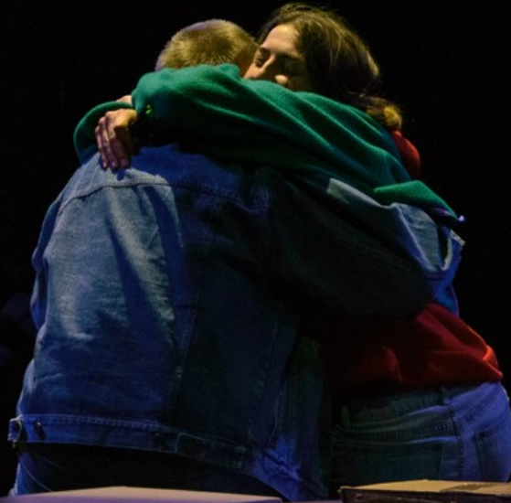
Tour of the interactive show-performance of art therapy "Mariupol #nadiya_na_svitanok"

Tata, mamo, ja i nasz mały Yurczyk. I dobrze, że żyjemy tu razem, w przyjazny sposób. Bo w mieście Maryi każdy musi być kochany. Tatusiu, bardzo Cię kocham! ALEKSANDER: I ja cię bardzo kocham! ZOINIERZ-Padnij! Oślanaj mnie! Ojciec to boli! VIOLETTA-Pomocy proszę panii! Coś musimy robić! Jego boli! MARYJA-Przełot ciębie prosiii! VIOLETTA-Ale ja nie umiem! I ten...no... MARYJA-Wed się w garść! Widziałeś jak on ogarnął? Jednym kłaskiem! Dawaj, wierz w ciebie!