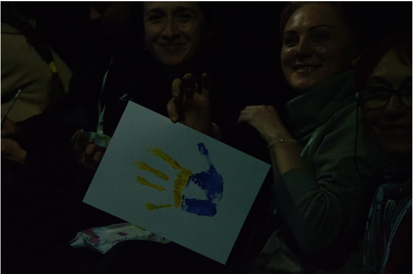
Tour of the interactive show-performance of art therapy "Mariupol #nadiya_na_svitanok"