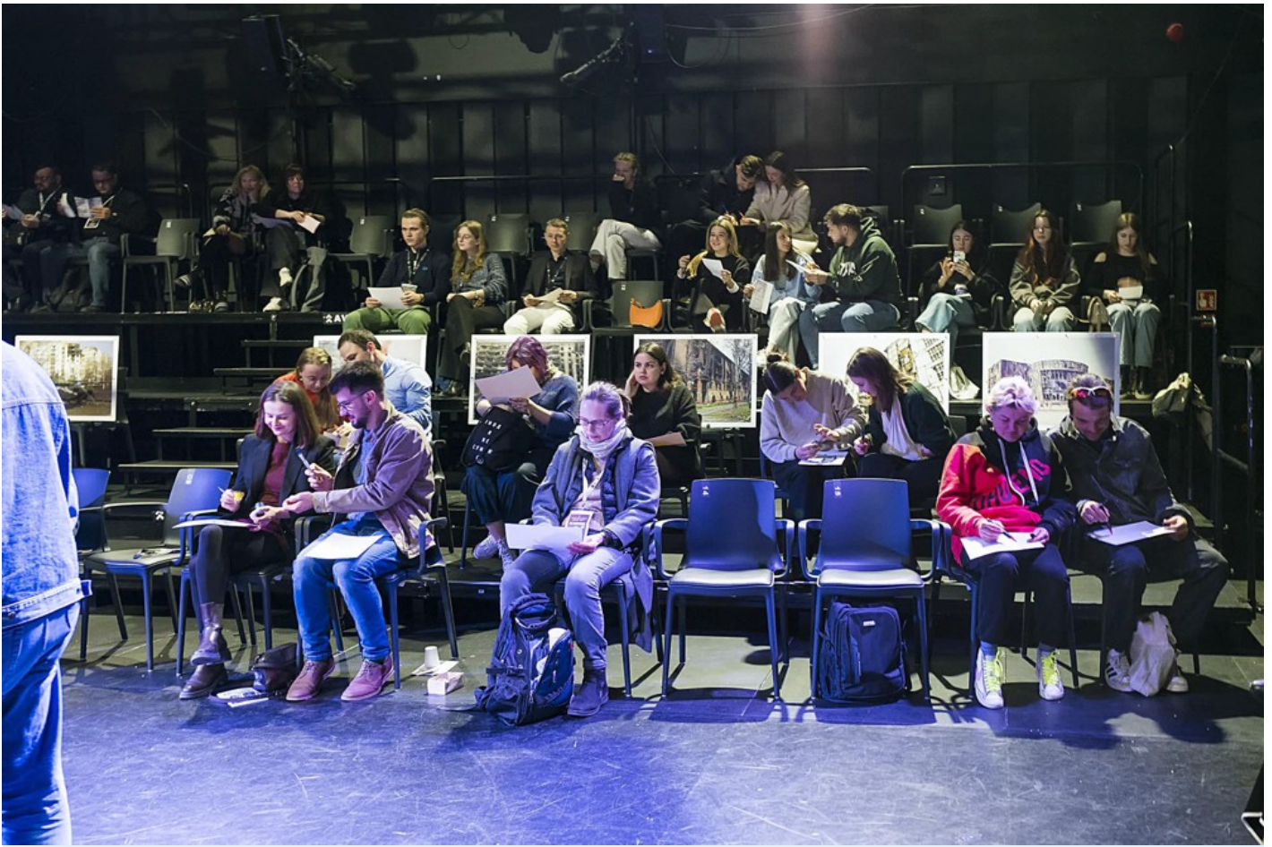
Tour of the interactive show-performance of art therapy "Mariupol #nadiya_na_svitanok"