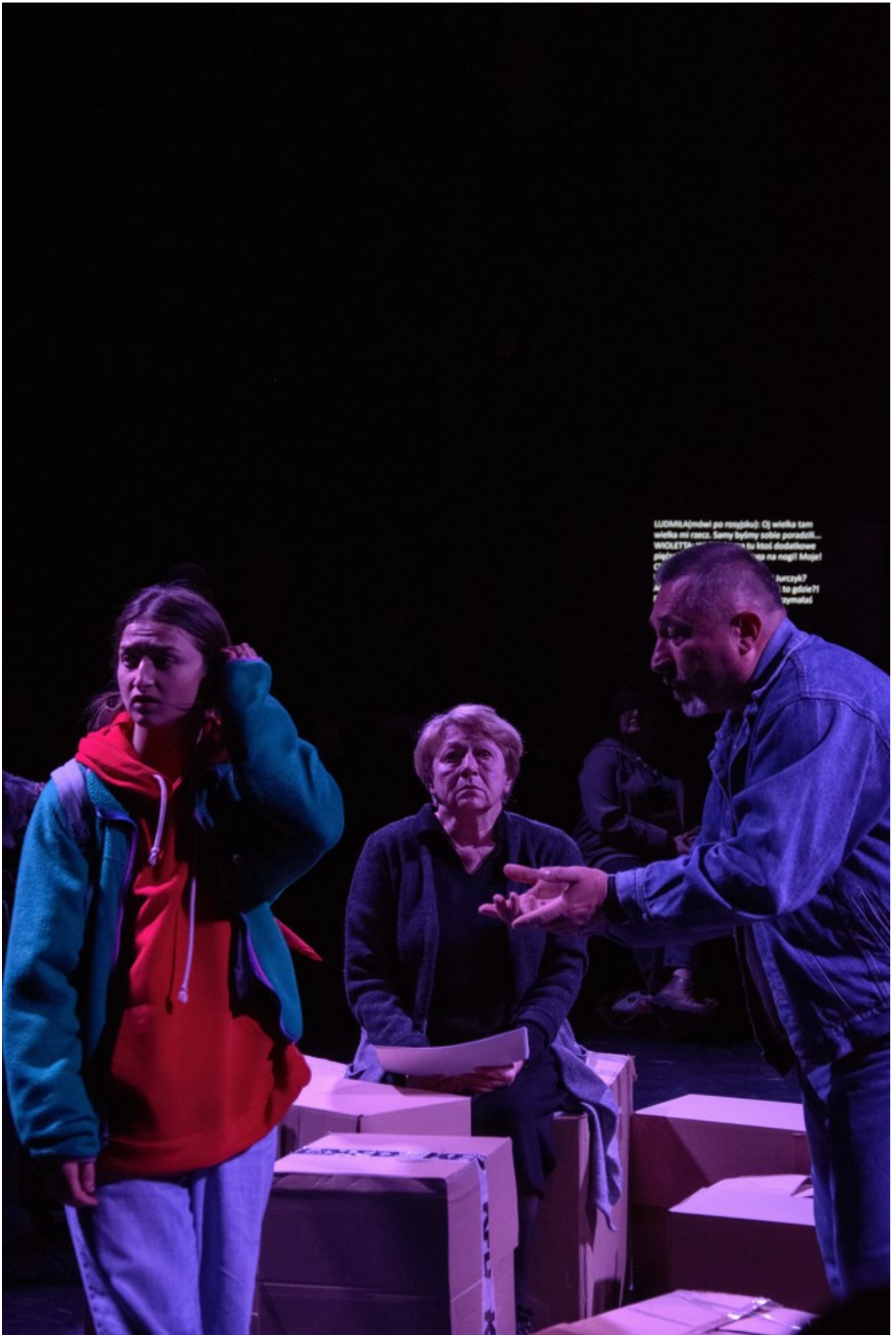
Tour of the interactive show-performance of art therapy "Mariupol #nadiya_na_svitanok"