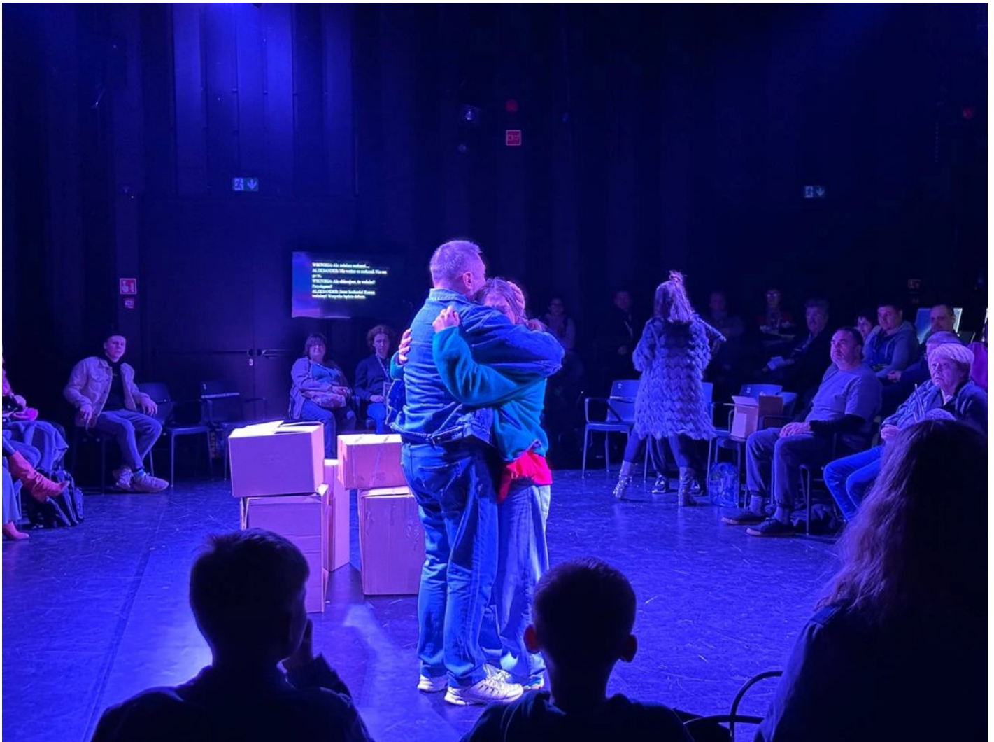
Tour of the interactive show-performance of art therapy "Mariupol #nadiya_na_svitanok"