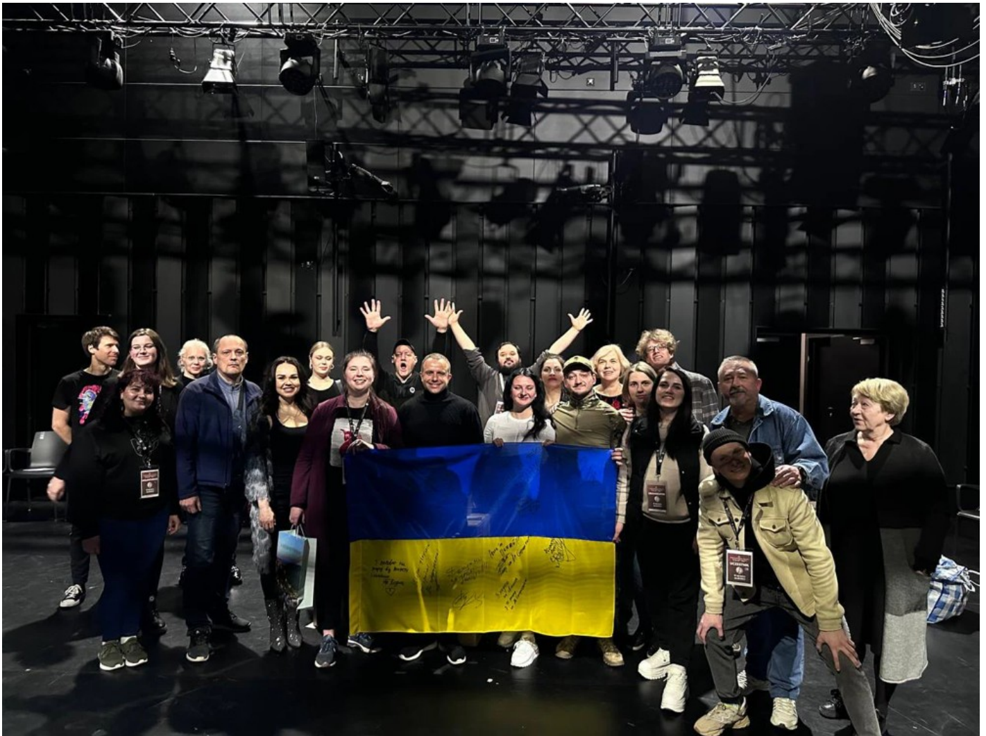
Tour of the interactive show-performance of art therapy "Mariupol #nadiya_na_svitanok"