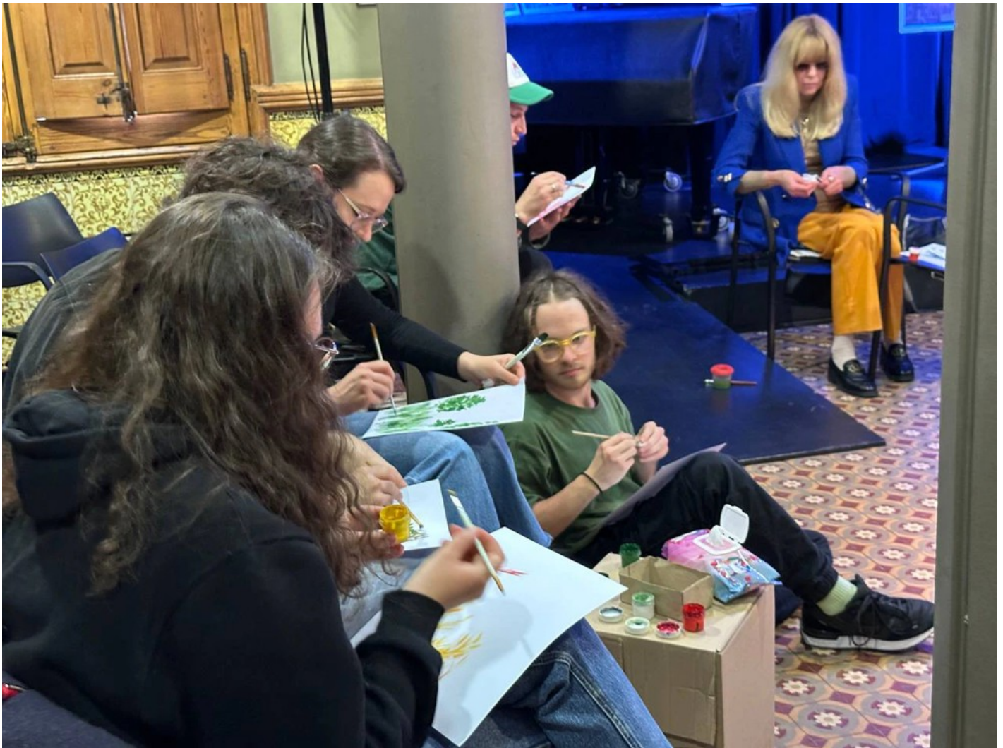
Tour of the interactive show-performance of art therapy "Mariupol #nadiya_na_svitanok"