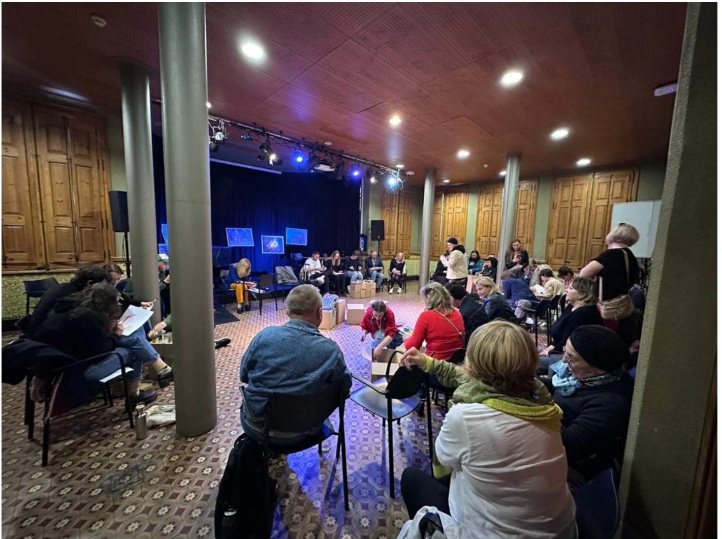
Tour of the interactive show-performance of art therapy "Mariupol #nadiya_na_svitanok"