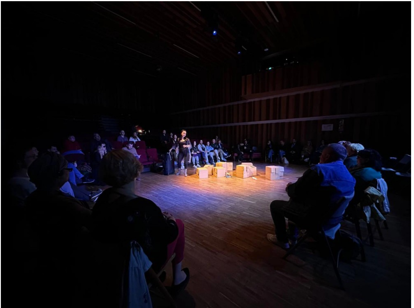
Tour of the interactive show-performance of art therapy "Mariupol #nadiya_na_svitanok"