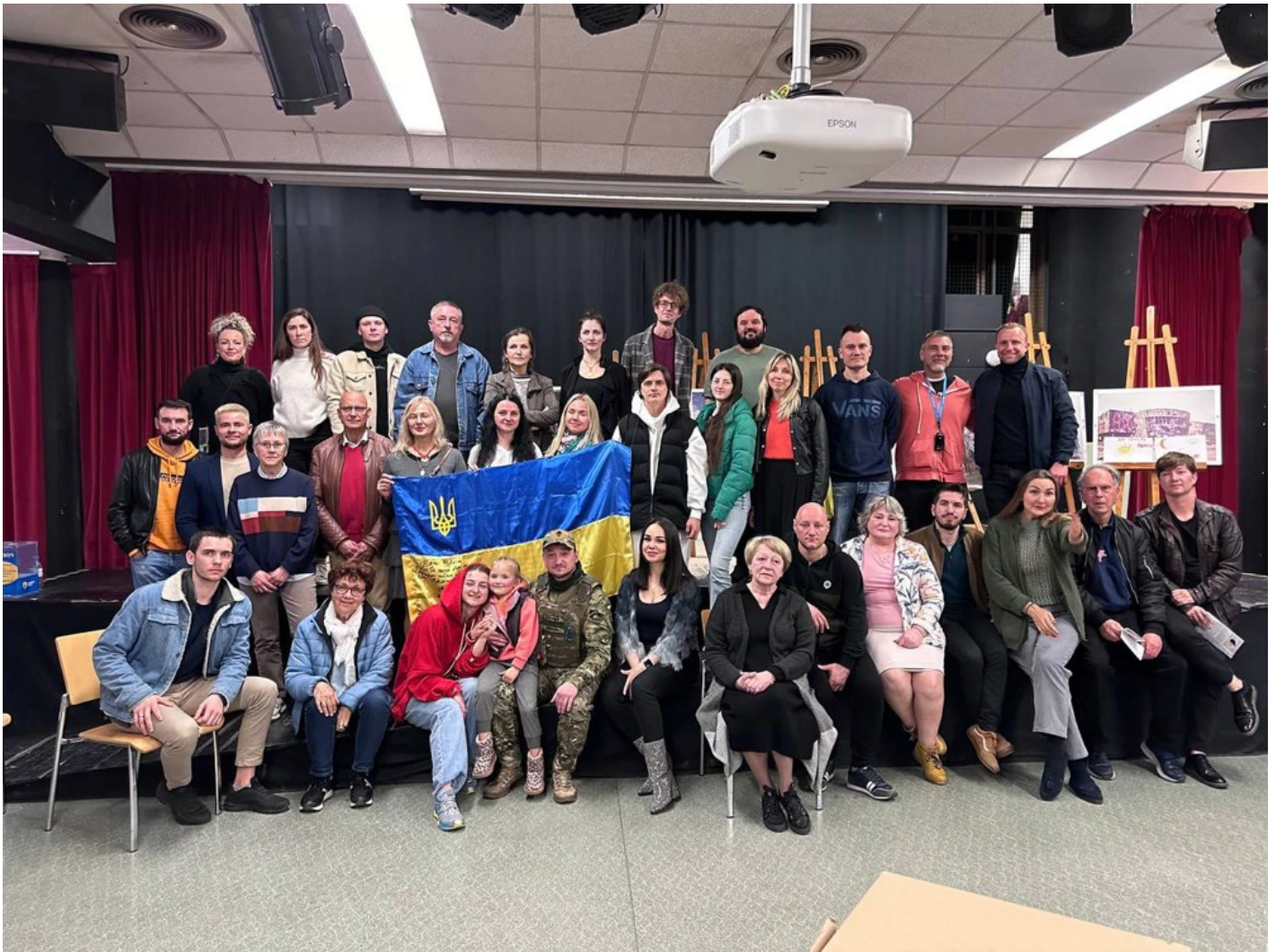
Tour of the interactive show-performance of art therapy "Mariupol #nadiya_na_svitanok"