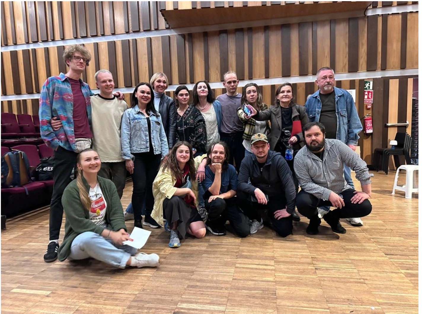
Tour of the interactive show-performance of art therapy "Mariupol #nadiya_na_svitanok"