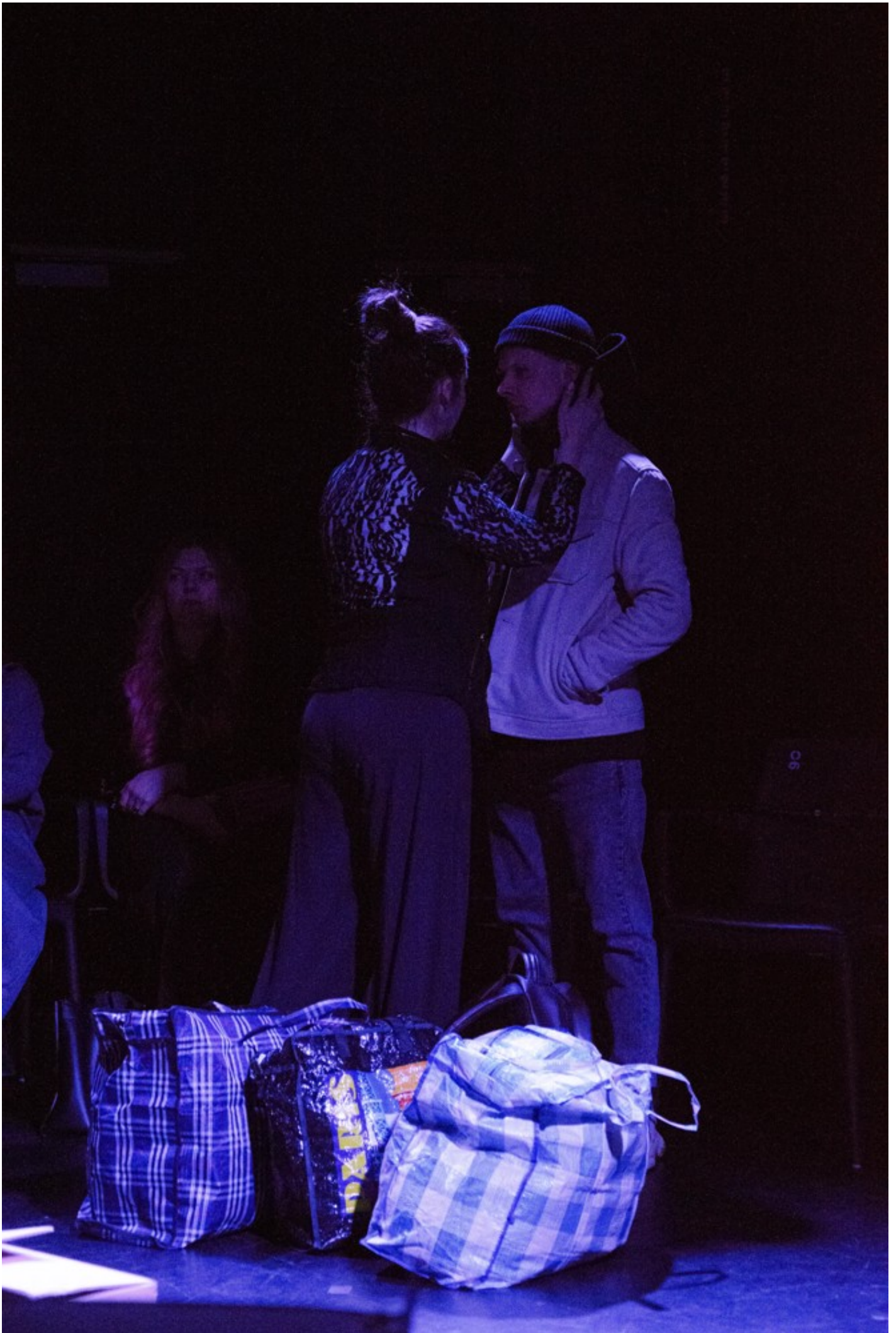
Tour of the interactive show-performance of art therapy "Mariupol #nadiya_na_svitanok"