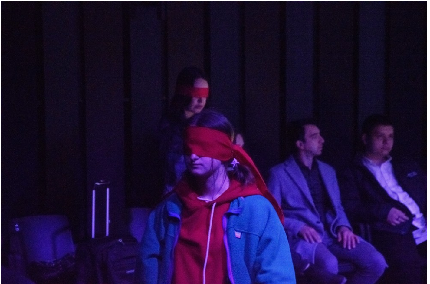
Tour of the interactive show-performance of art therapy "Mariupol #nadiya_na_svitanok"