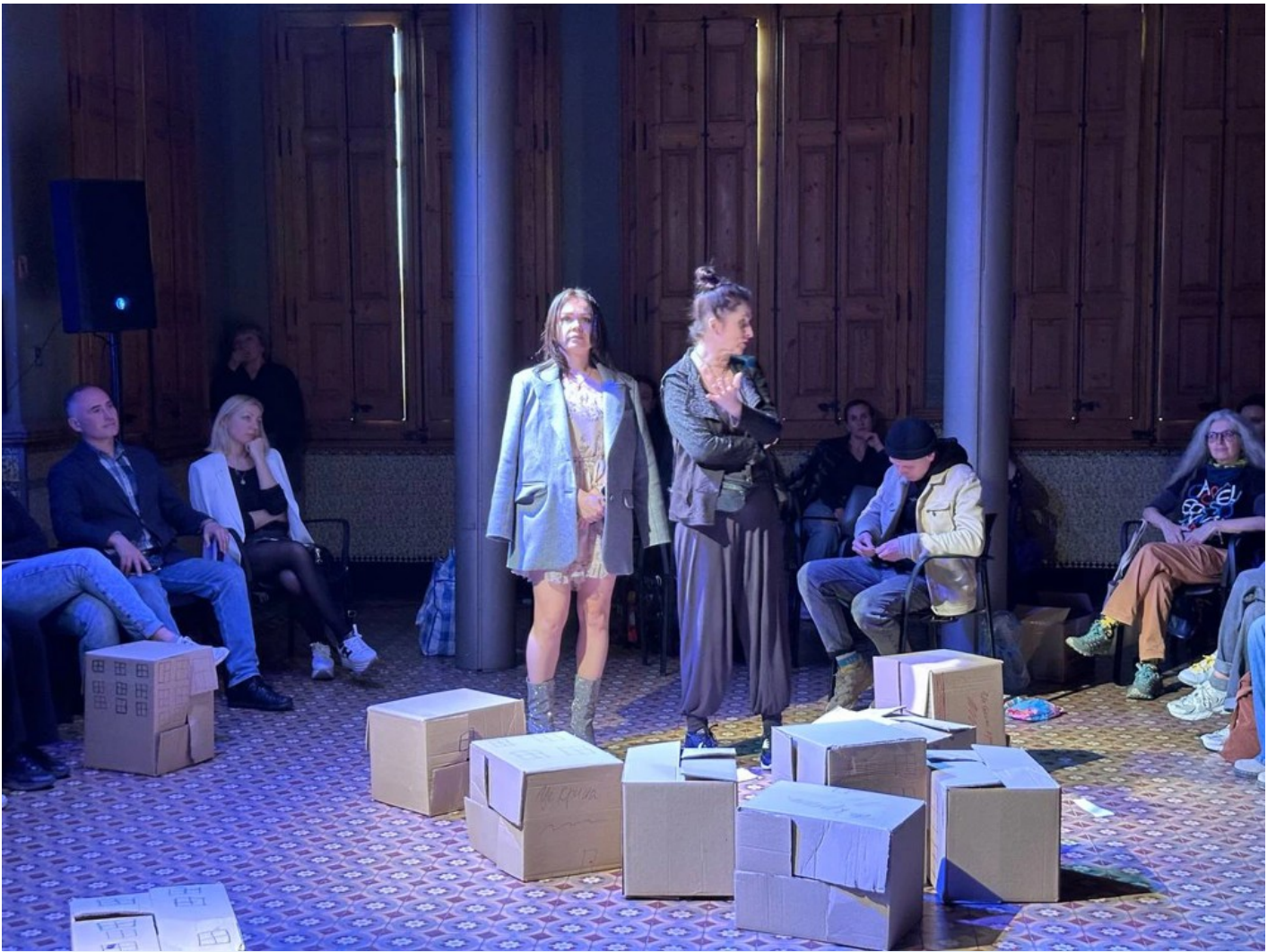
Tour of the interactive show-performance of art therapy "Mariupol #nadiya_na_svitanok"