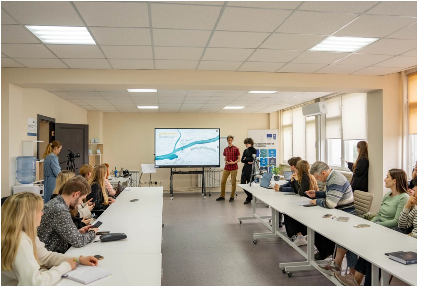
Living Way The river in the city. Answers to frequently asked questions