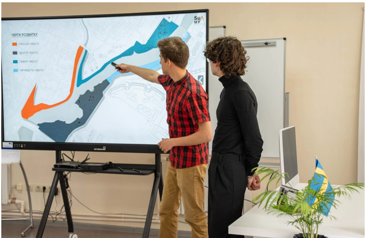
Living Way The river in the city. Answers to frequently asked questions