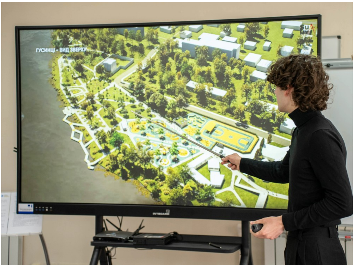
Living Way The river in the city. Answers to frequently asked questions