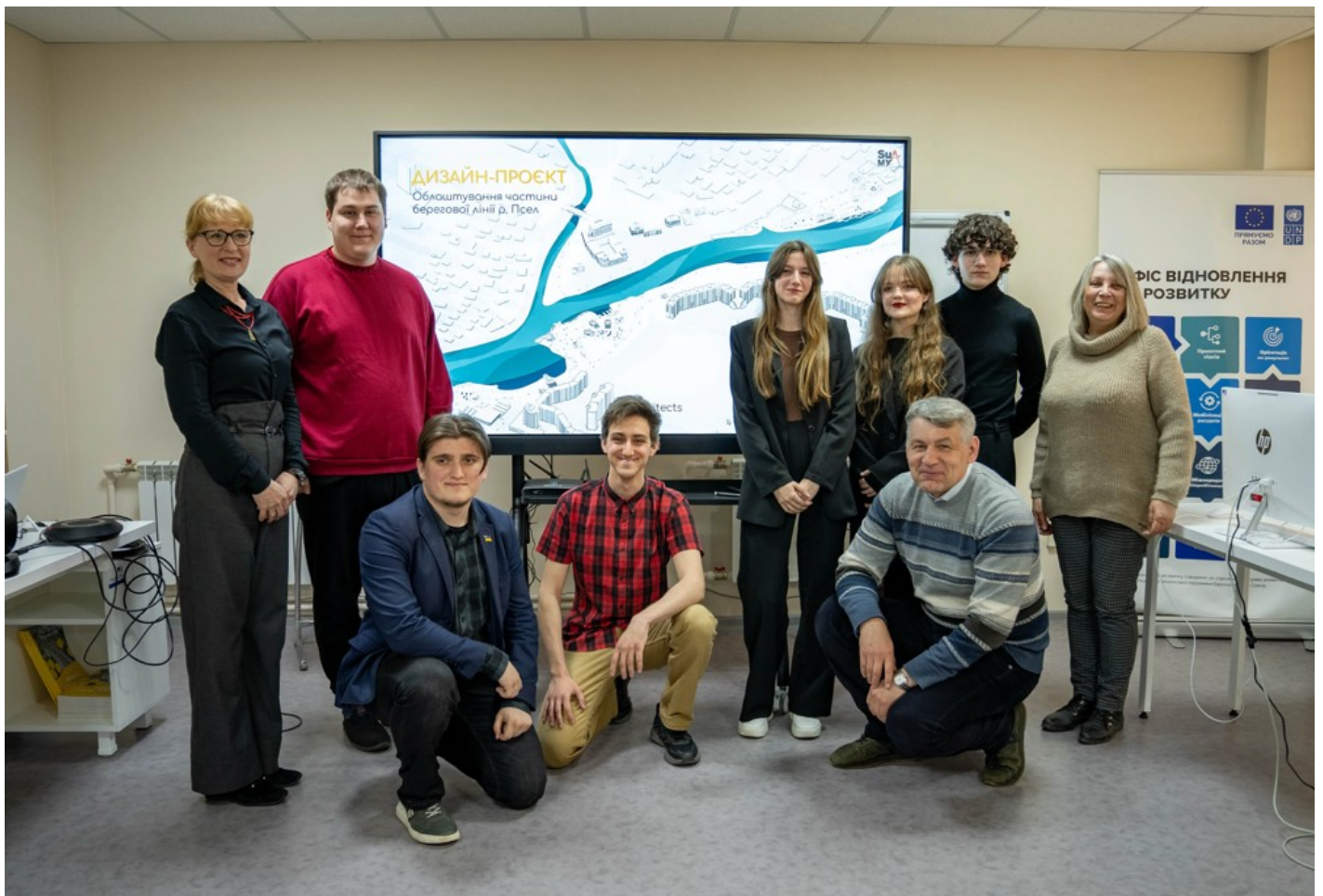
Living Way The river in the city. Answers to frequently asked questions