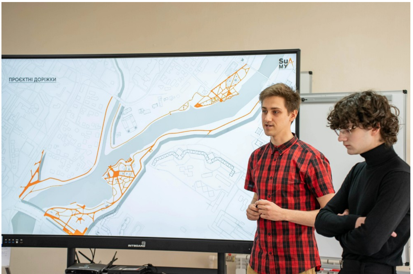
Living Way The river in the city. Answers to frequently asked questions