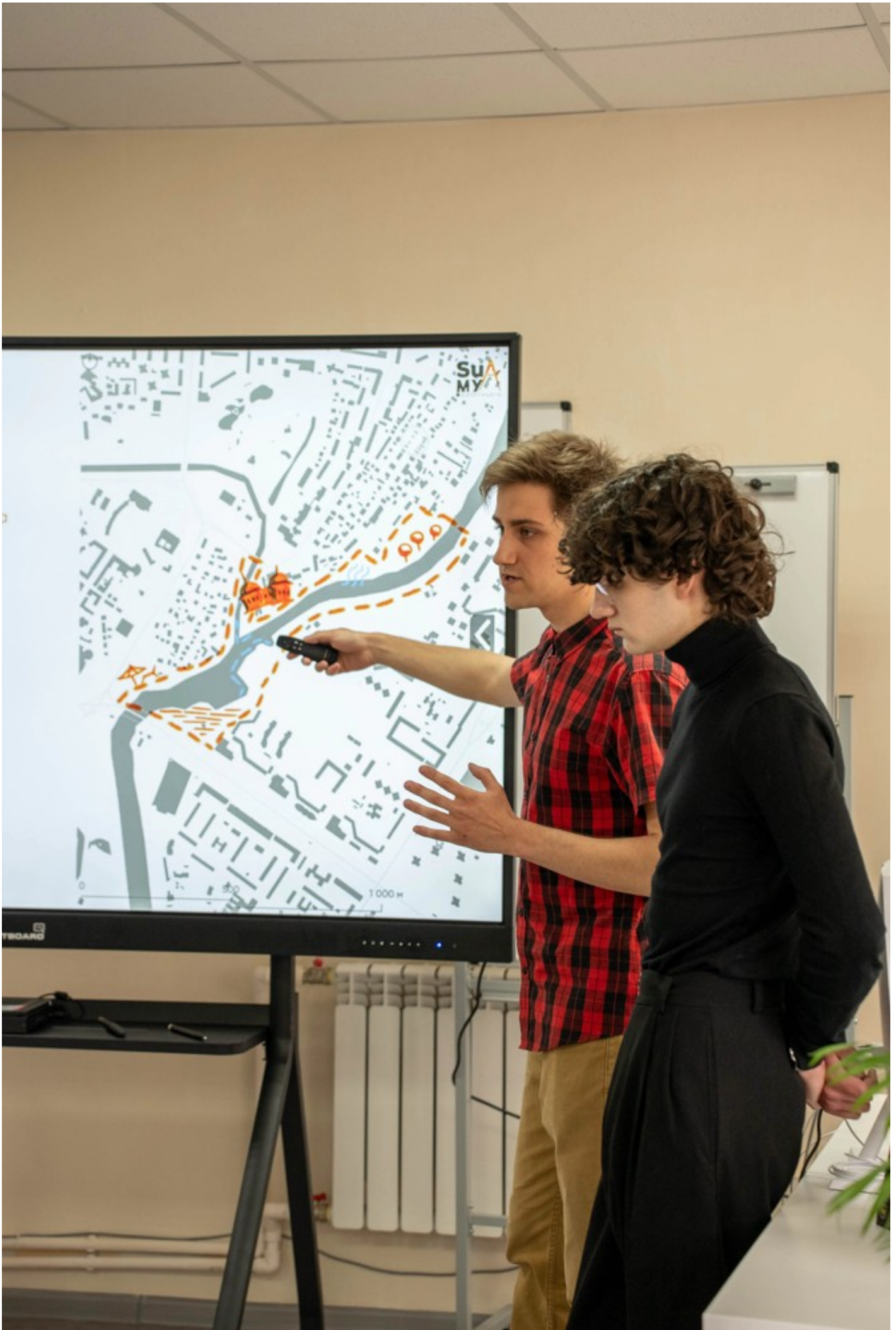
Living Way The river in the city. Answers to frequently asked questions