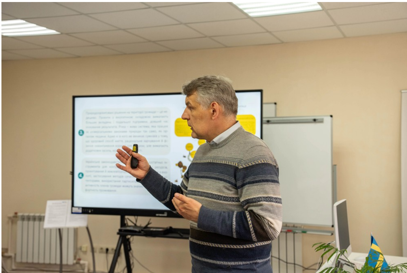
Living Way The river in the city. Answers to frequently asked questions