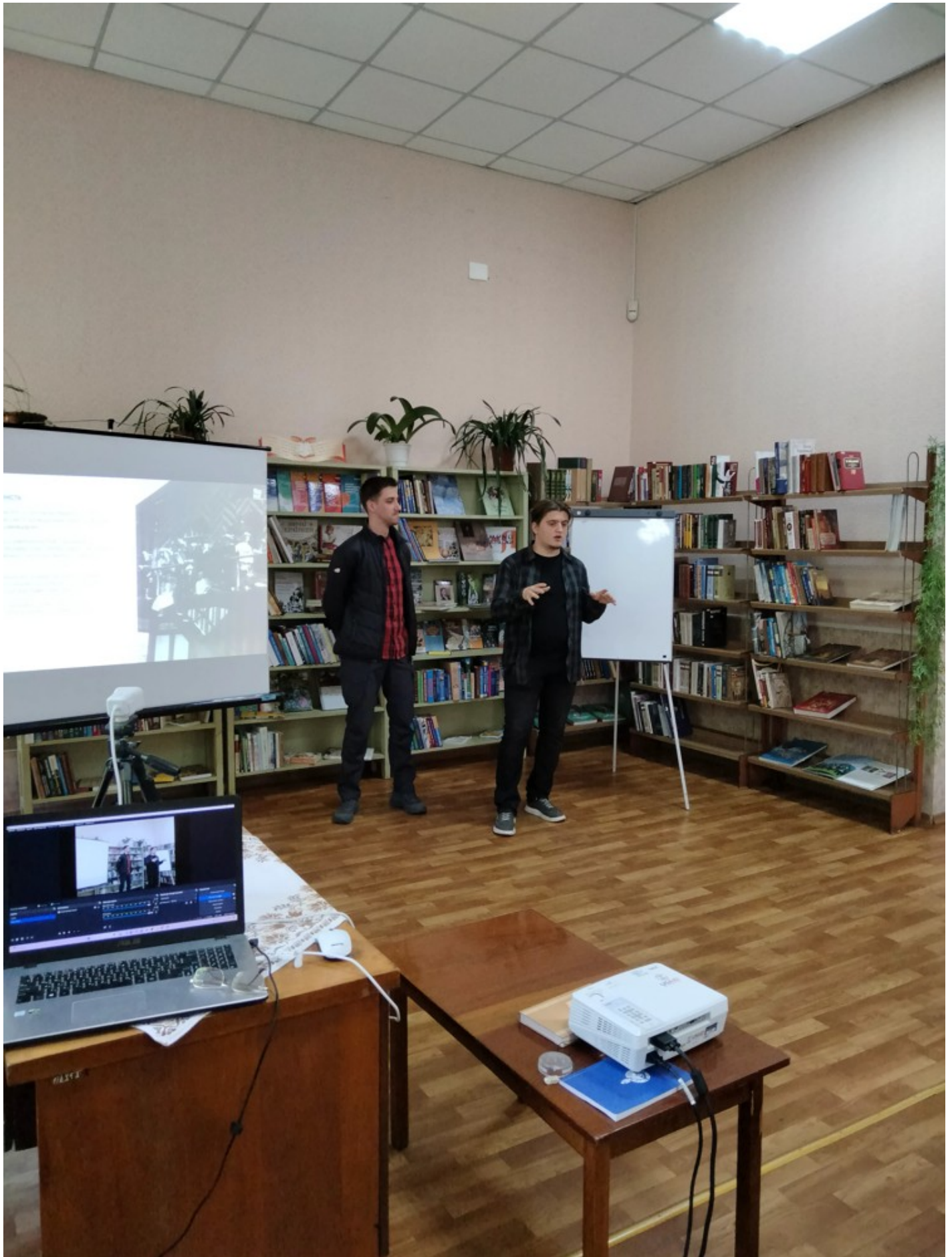
Living Way The river in the city. Answers to frequently asked questions