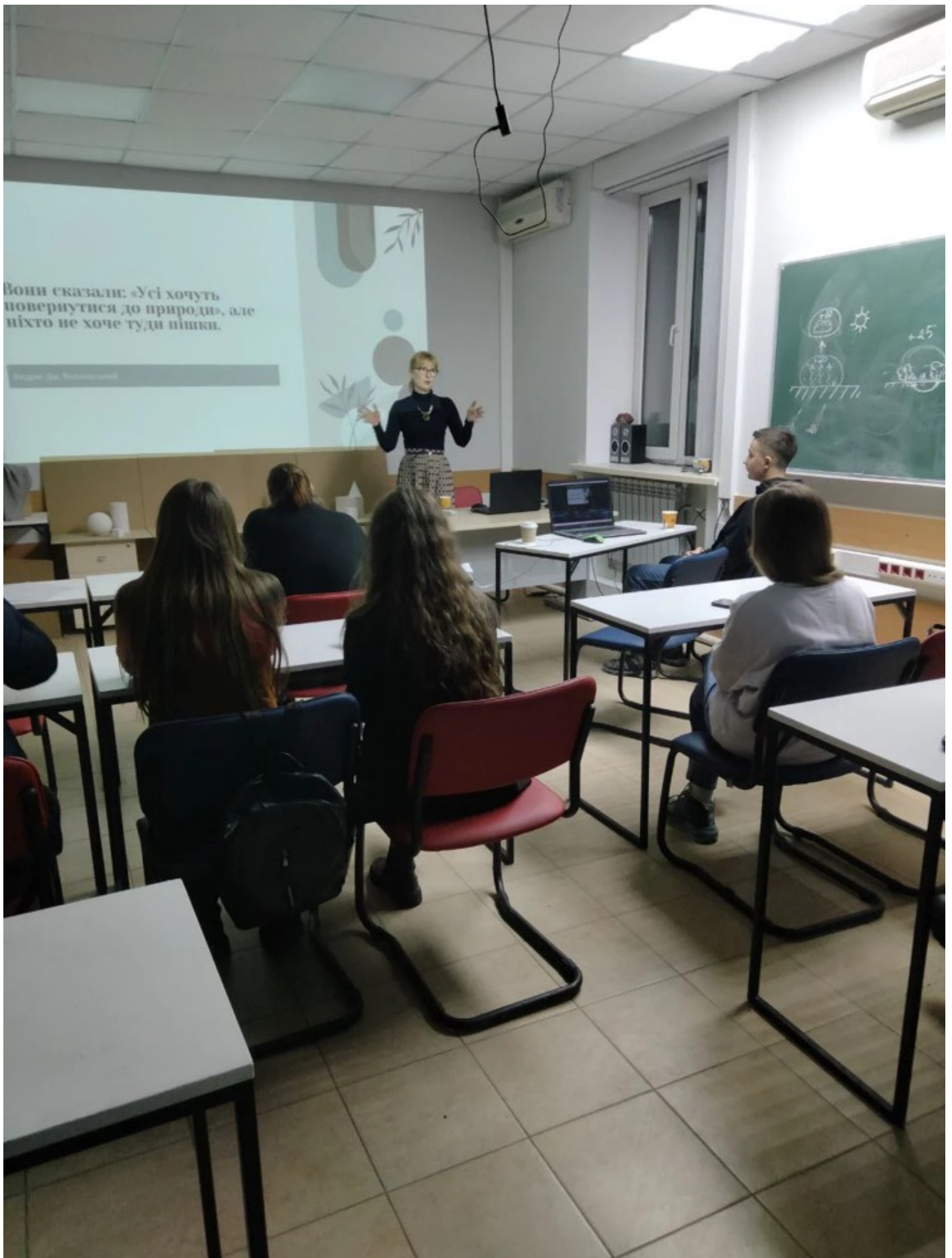
Living Way The river in the city. Answers to frequently asked questions