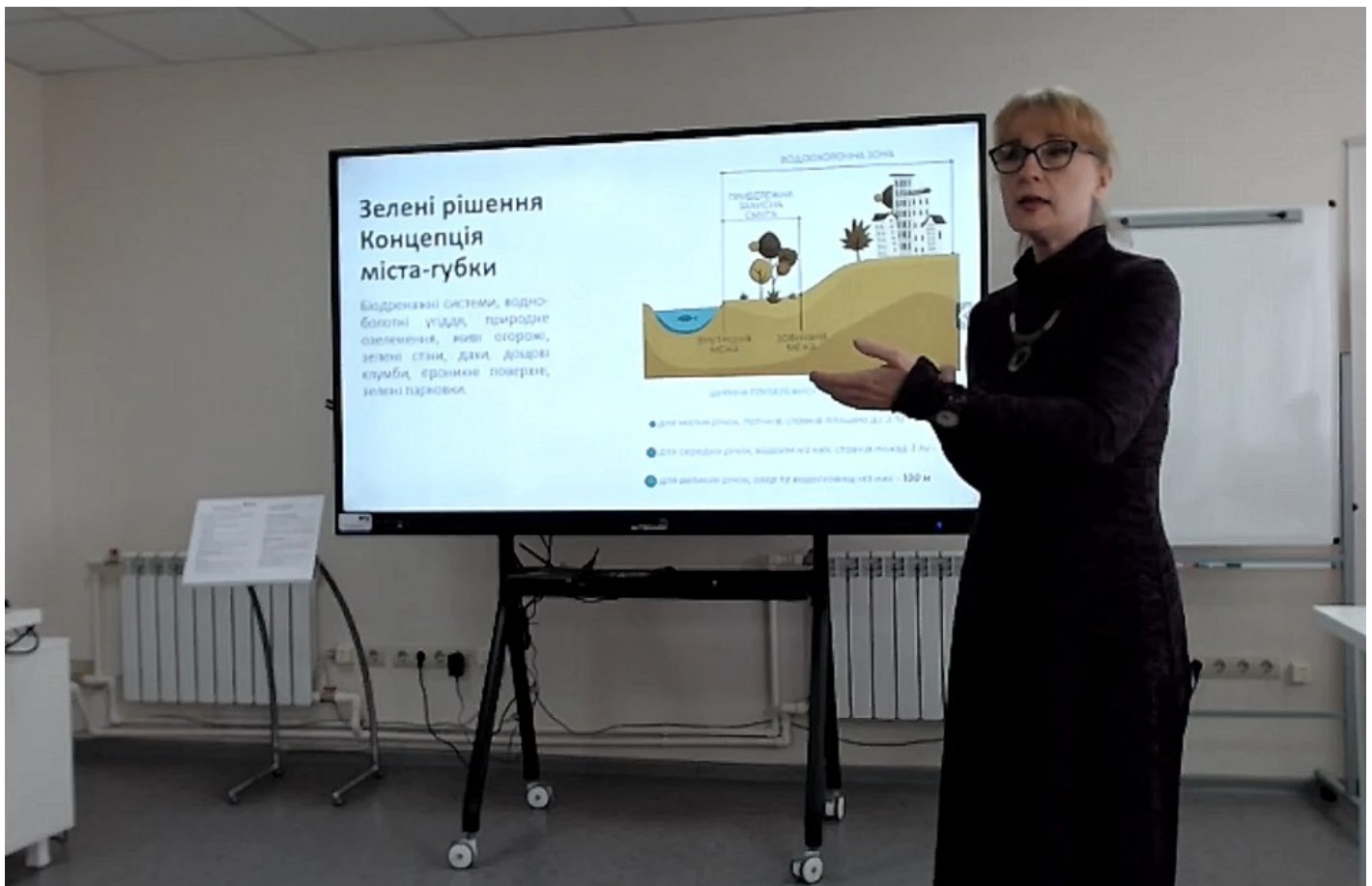
Living Way The river in the city. Answers to frequently asked questions