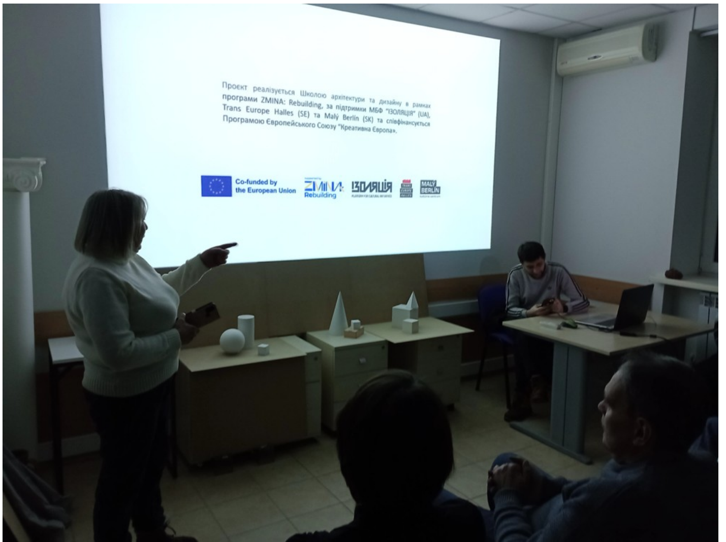
Living Way The river in the city. Answers to frequently asked questions