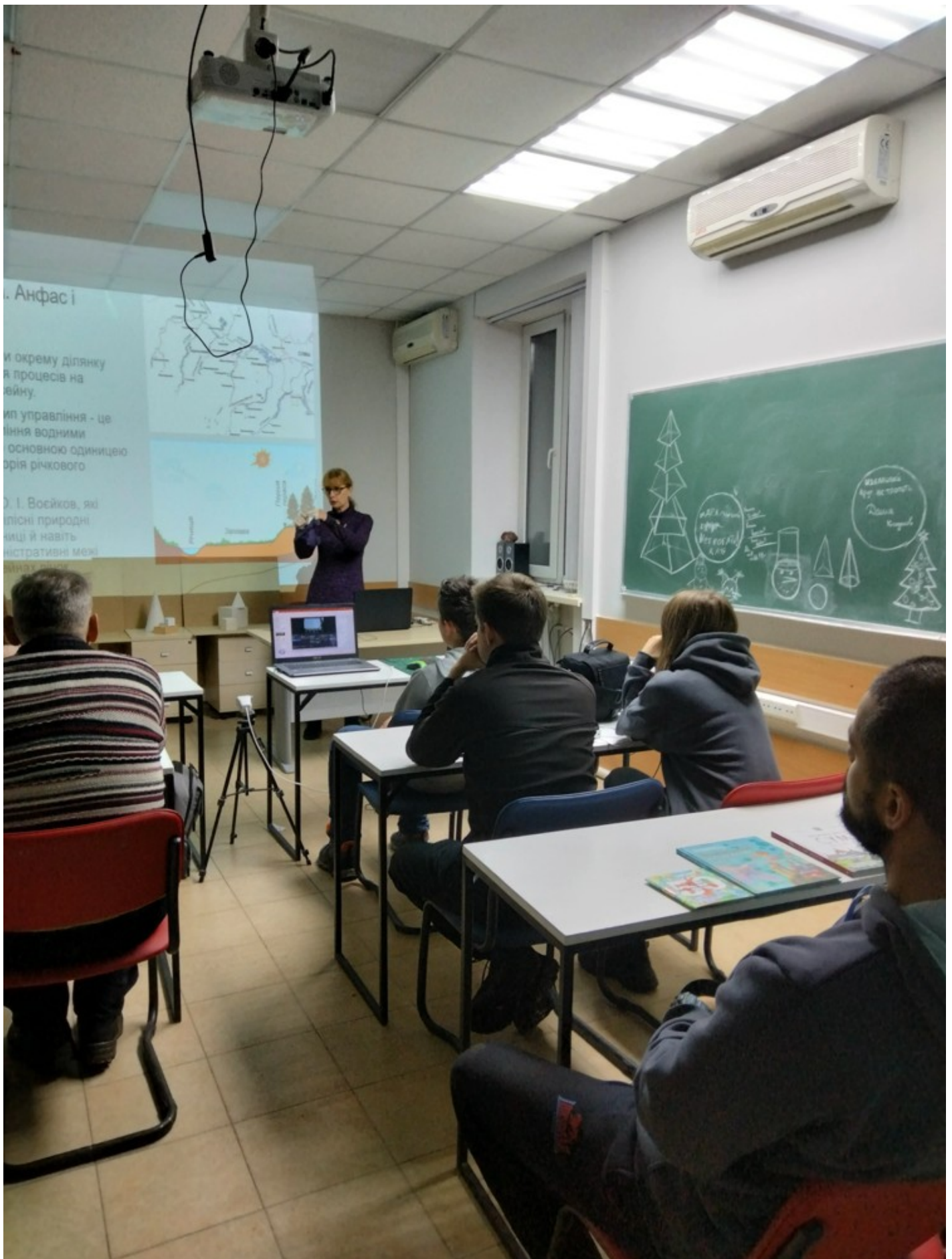
Living Way The river in the city. Answers to frequently asked questions