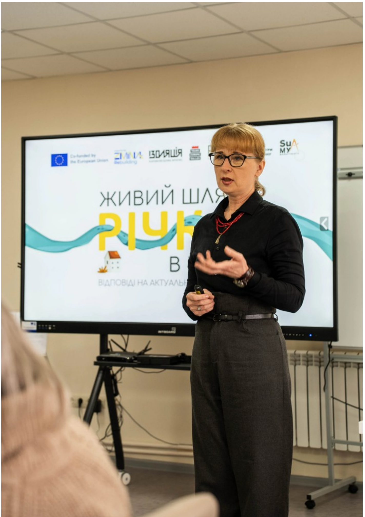
Living Way The river in the city. Answers to frequently asked questions