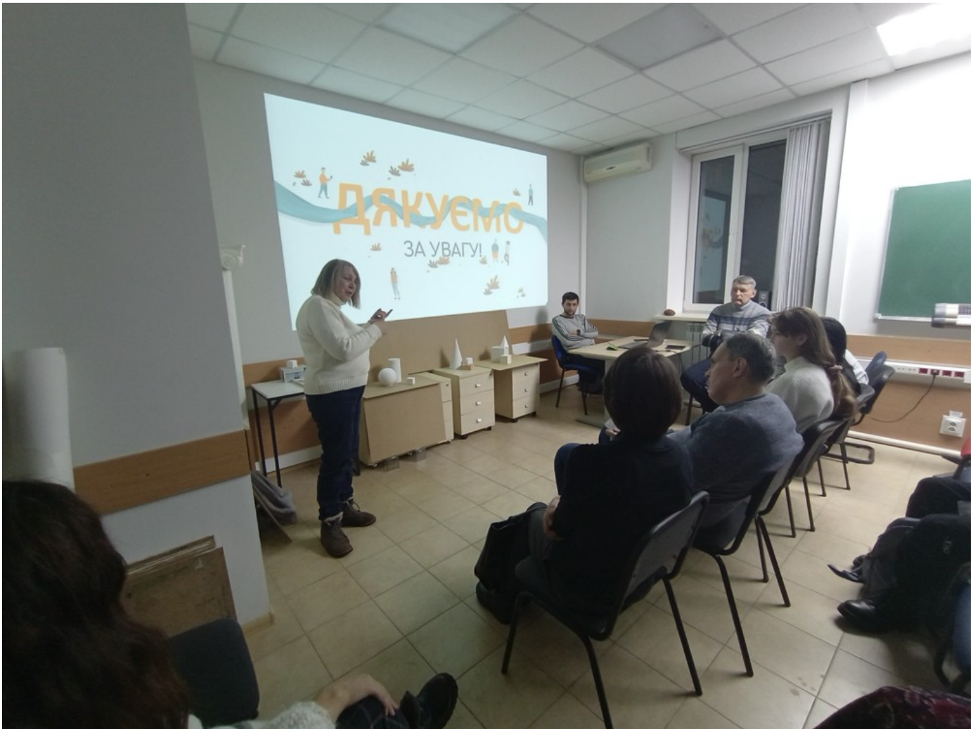
Living Way The river in the city. Answers to frequently asked questions