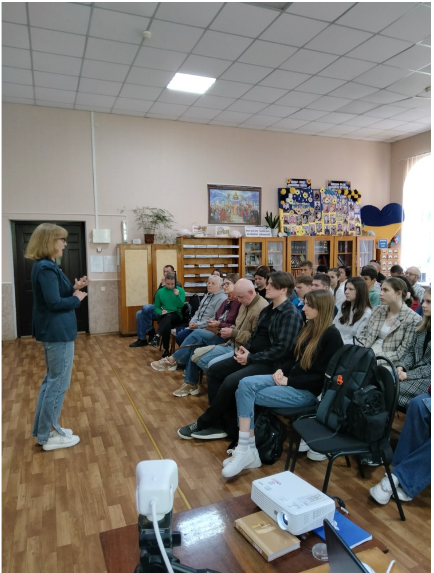
Living Way The river in the city. Answers to frequently asked questions