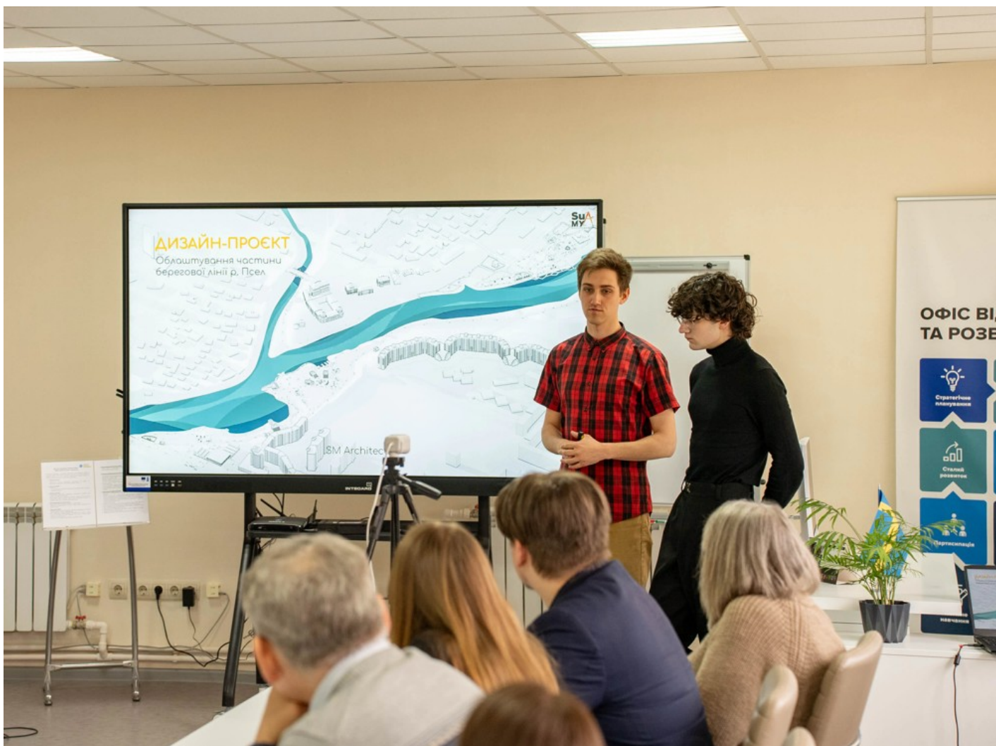
Living Way The river in the city. Answers to frequently asked questions