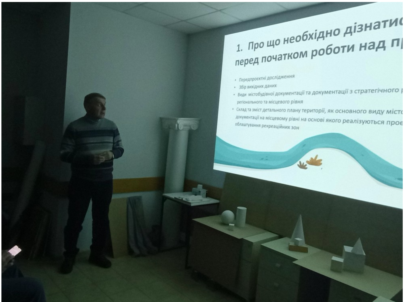
Living Way The river in the city. Answers to frequently asked questions