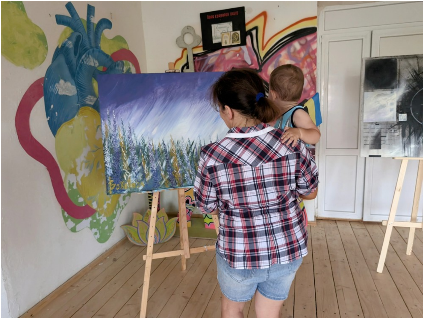
Life after: Dialogue