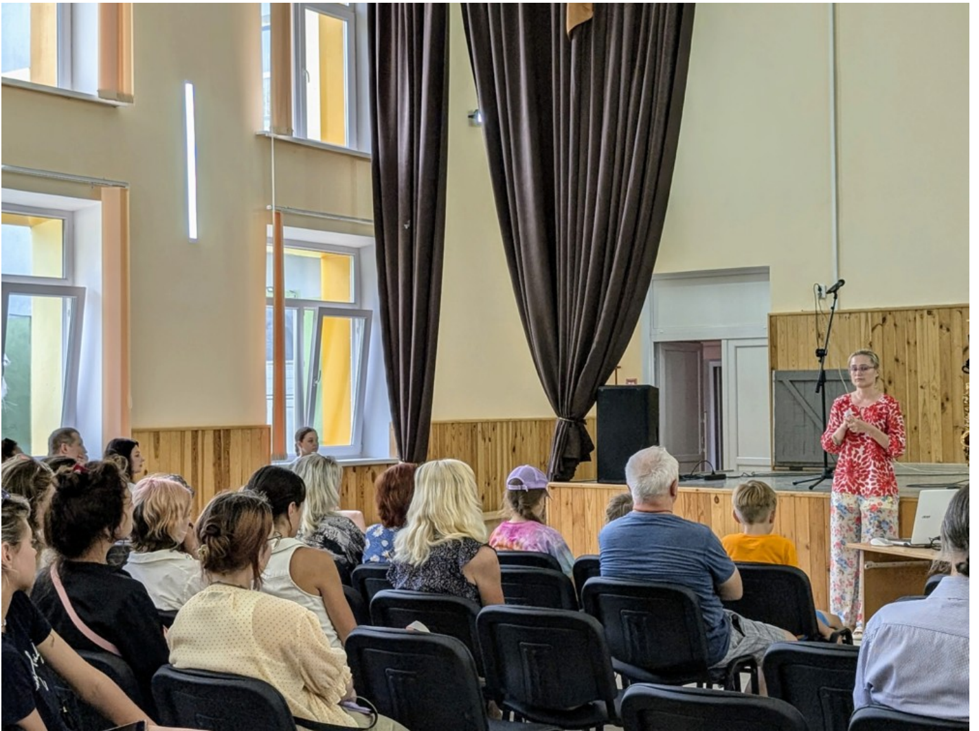
Life after: Dialogue