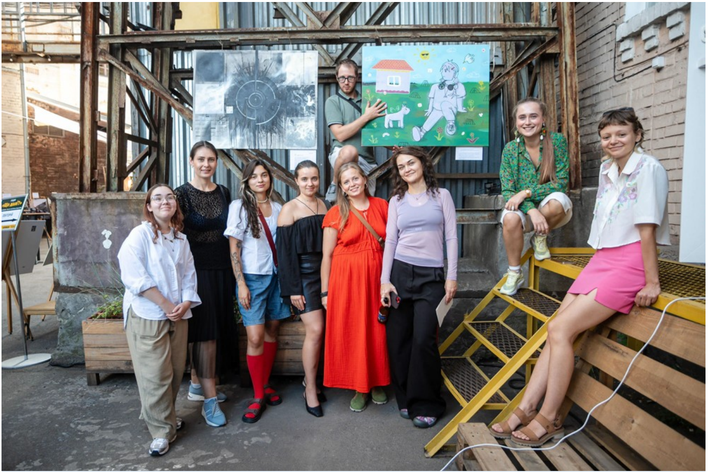
Life after: Dialogue