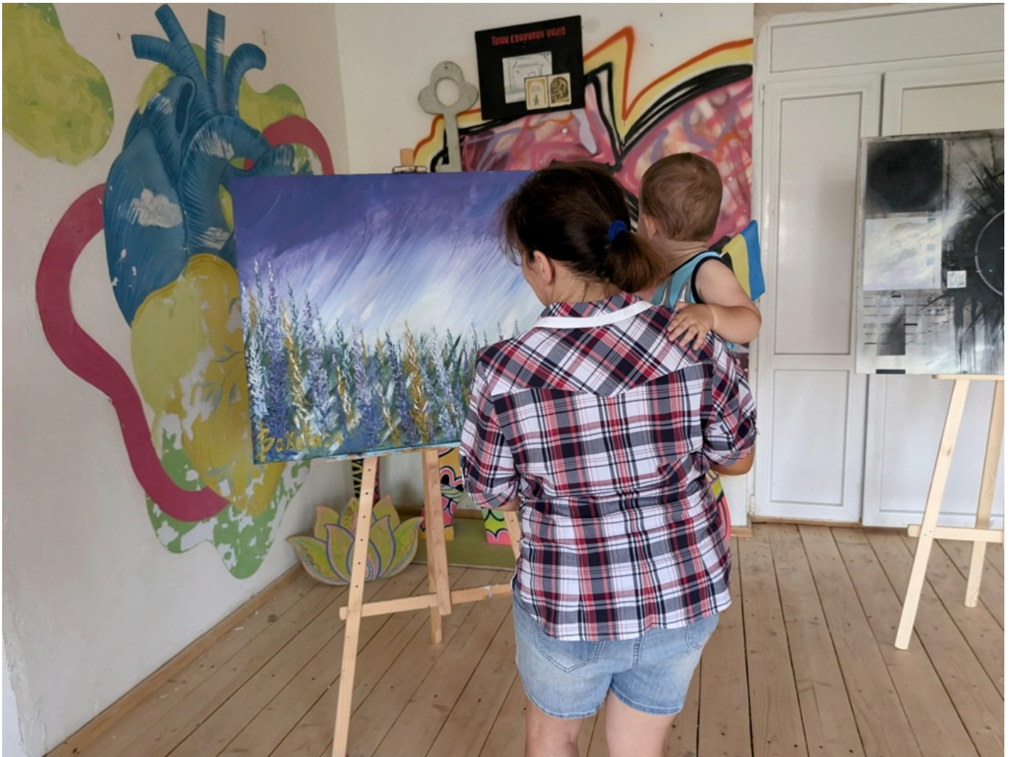
Life after: Dialogue