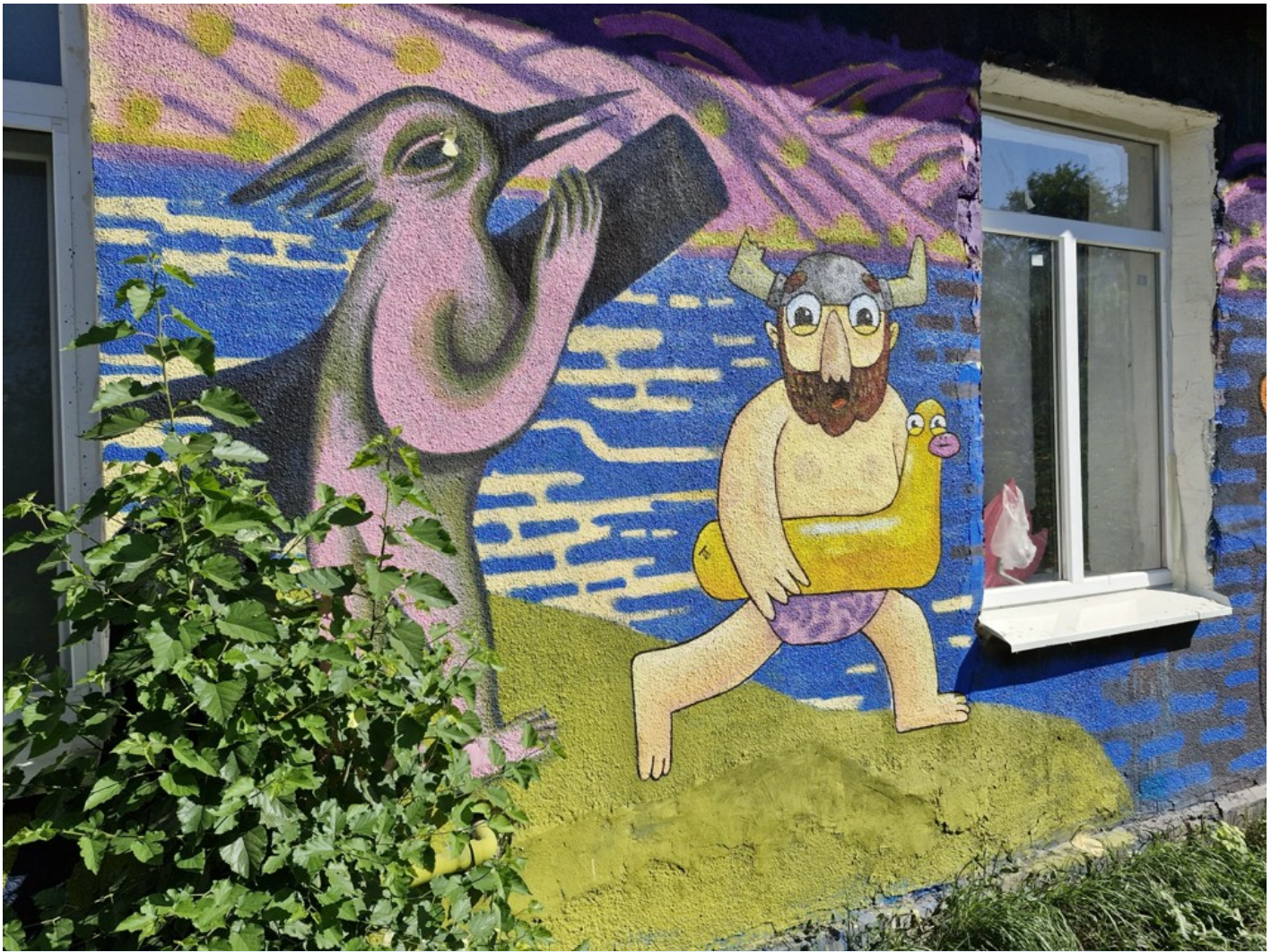
Life after: Dialogue