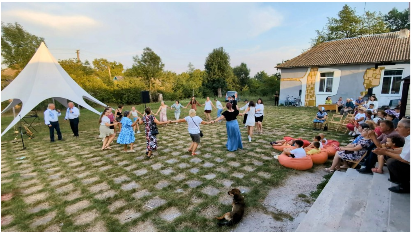
Life after: Dialogue