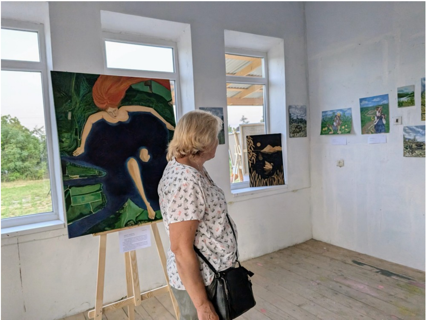
Life after: Dialogue