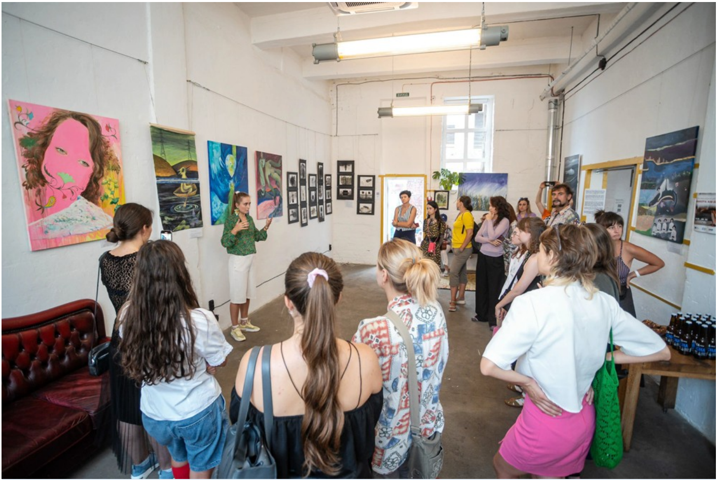
Life after: Dialogue