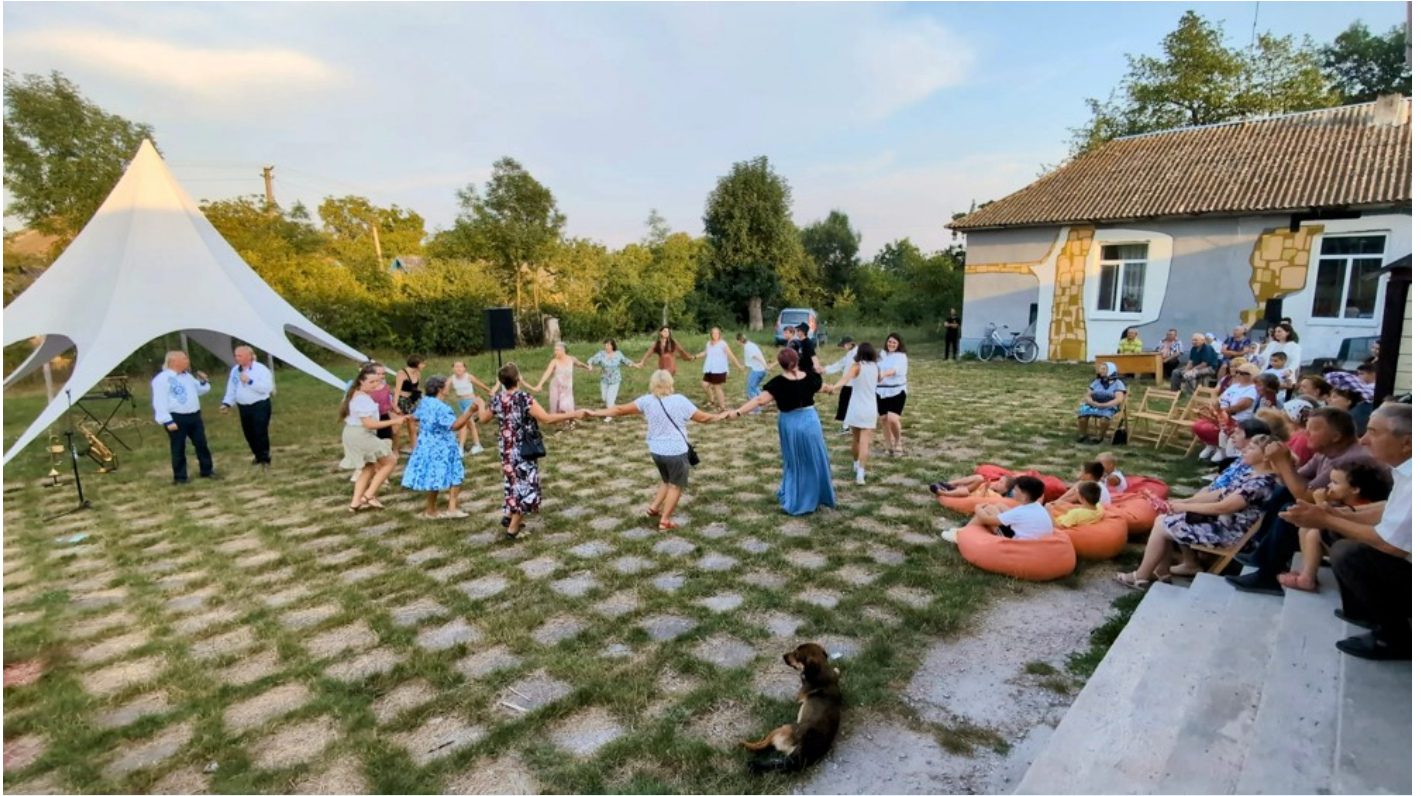
Life after: Dialogue