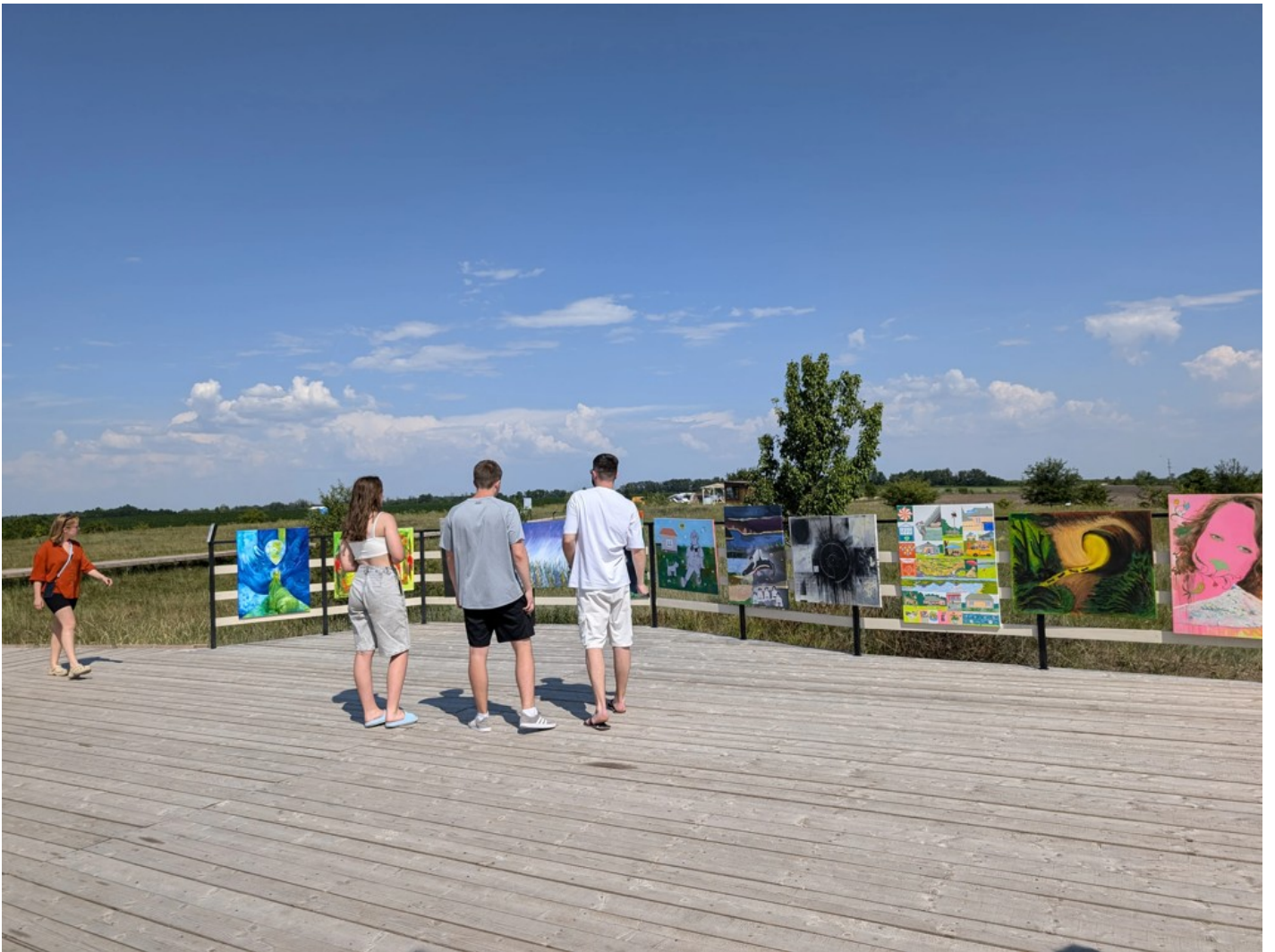
Life after: Dialogue