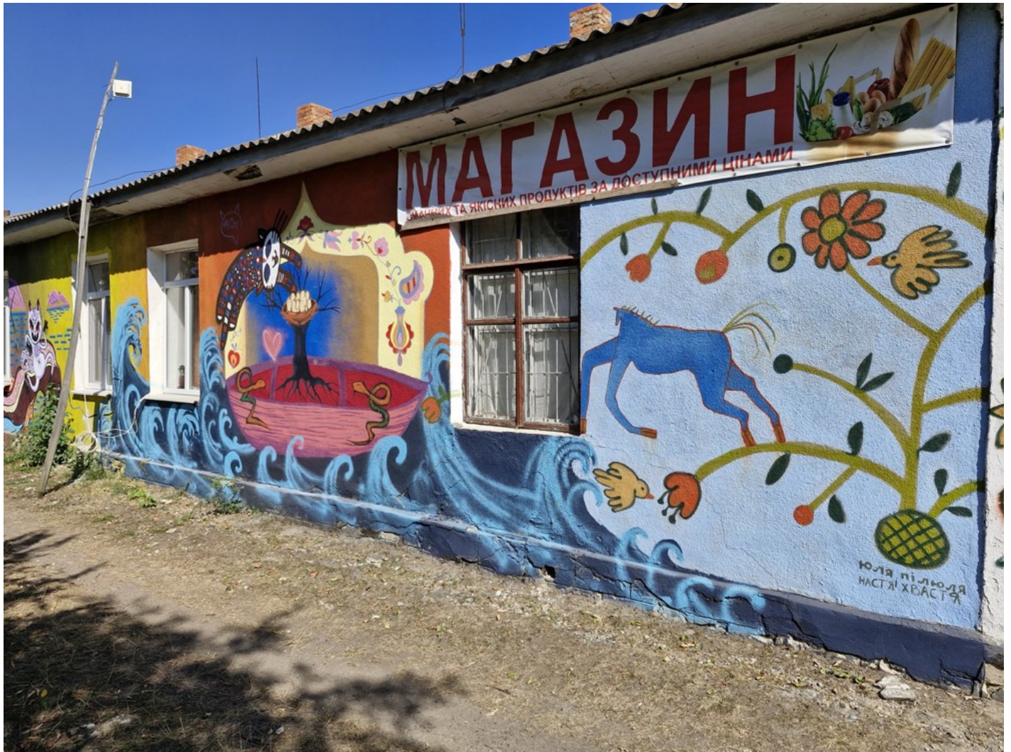
Life after: Dialogue