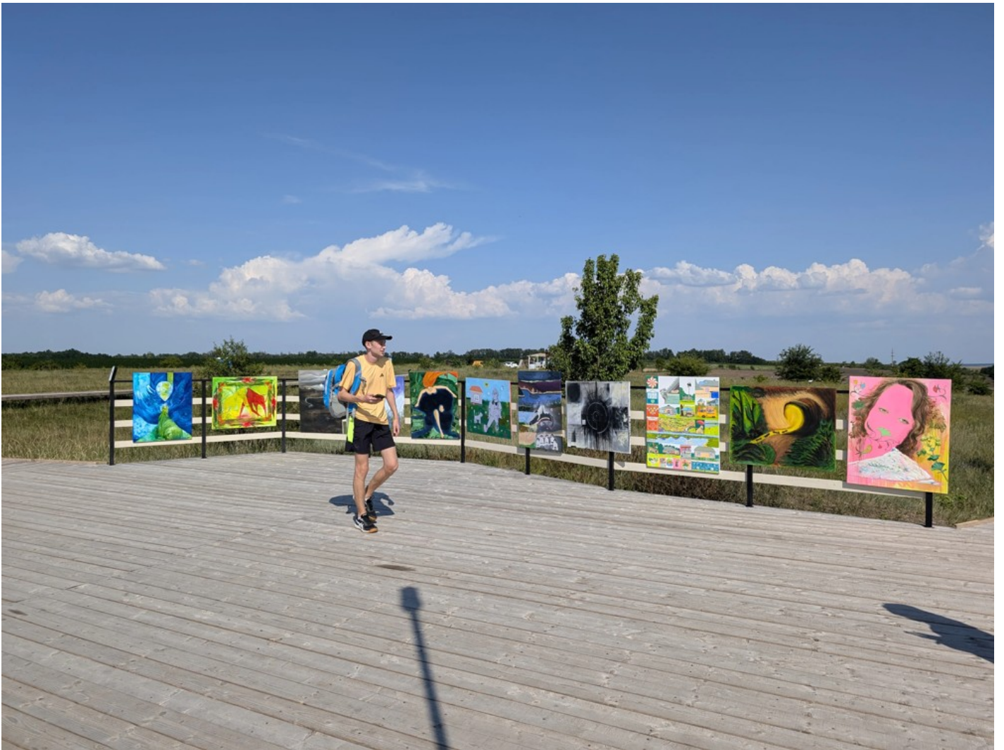
Life after: Dialogue