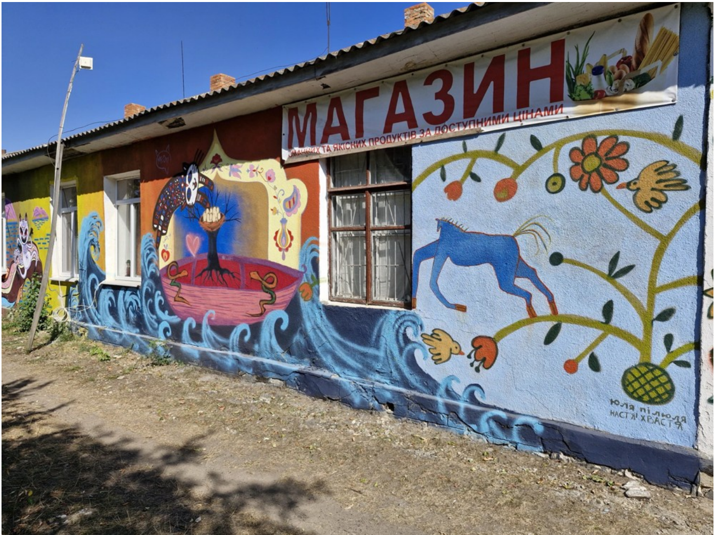
Life after: Dialogue