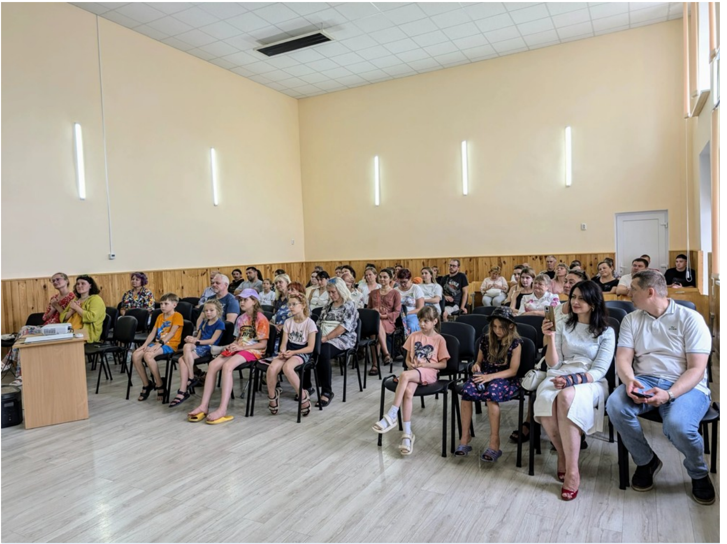
Life after: Dialogue