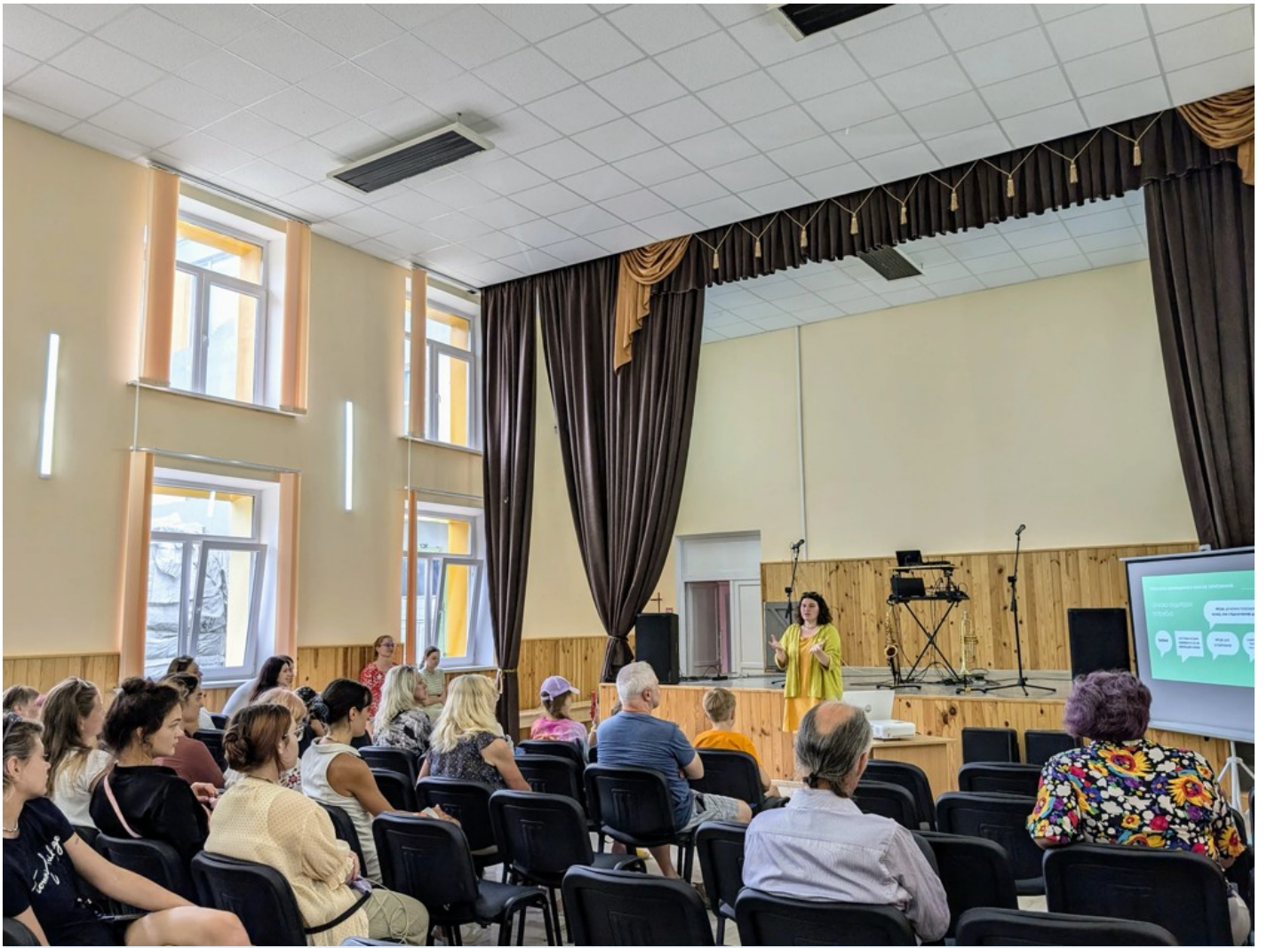
Life after: Dialogue