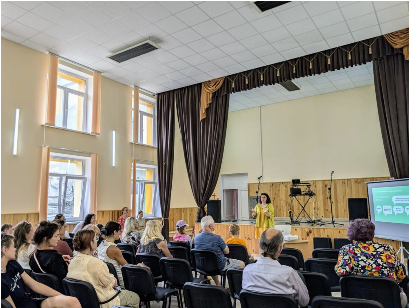
Life after: Dialogue