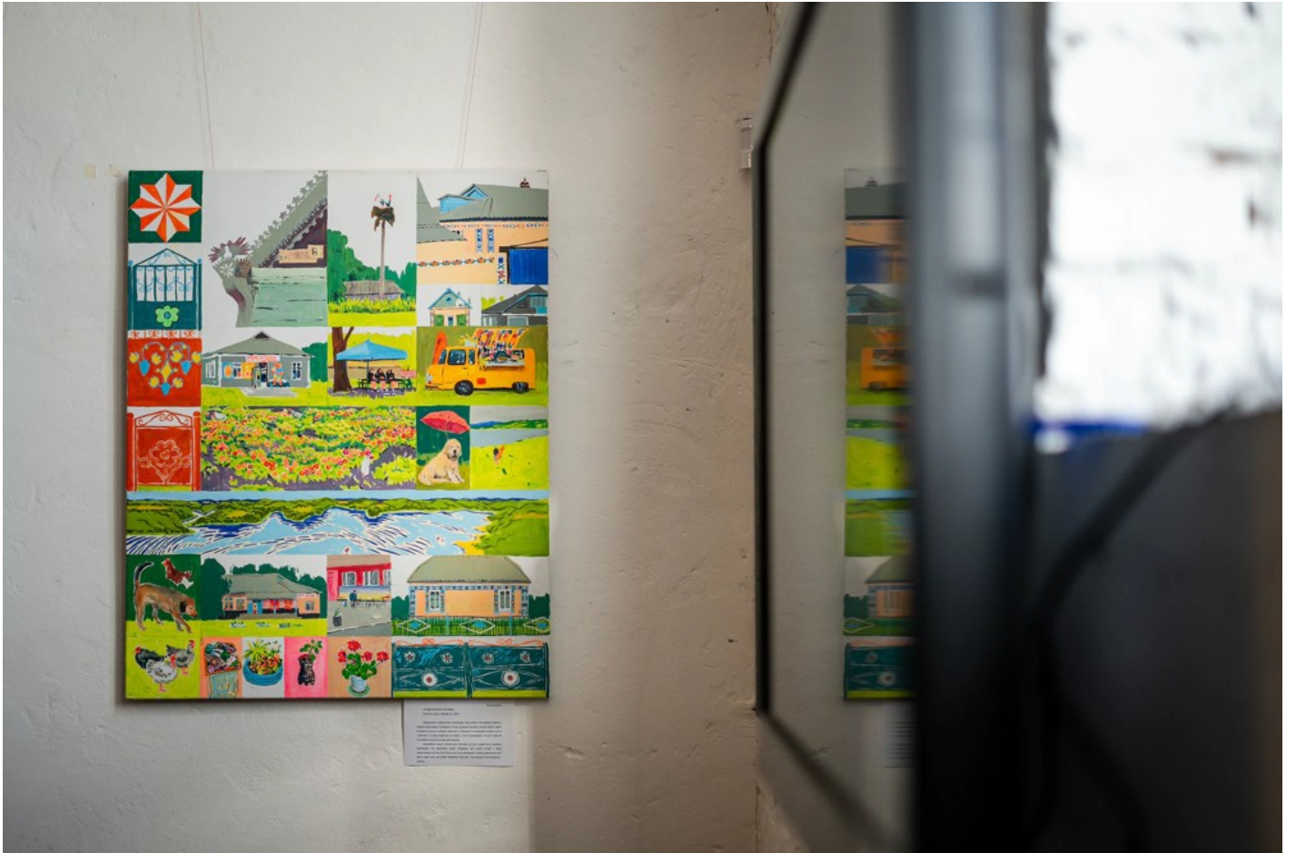
Life after: Dialogue