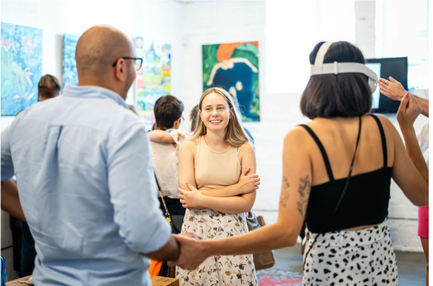
Life after: Dialogue