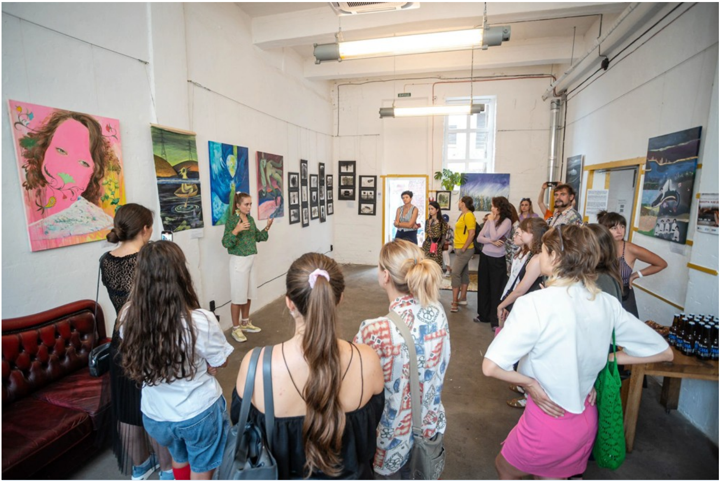
Life after: Dialogue