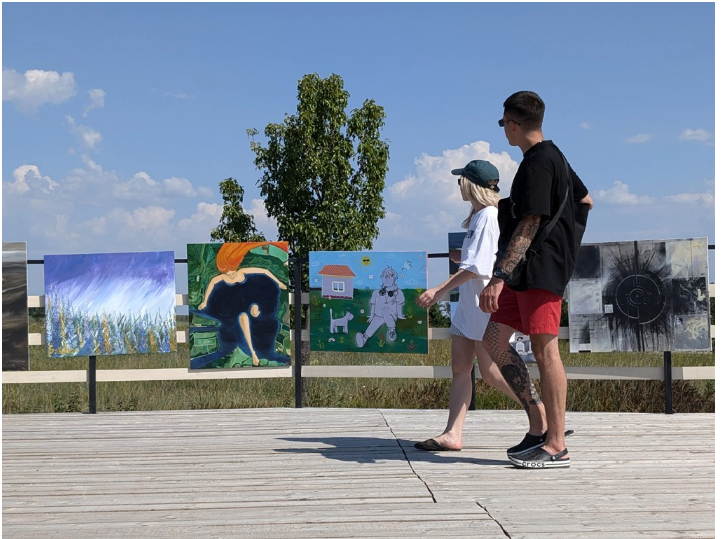
Life after: Dialogue