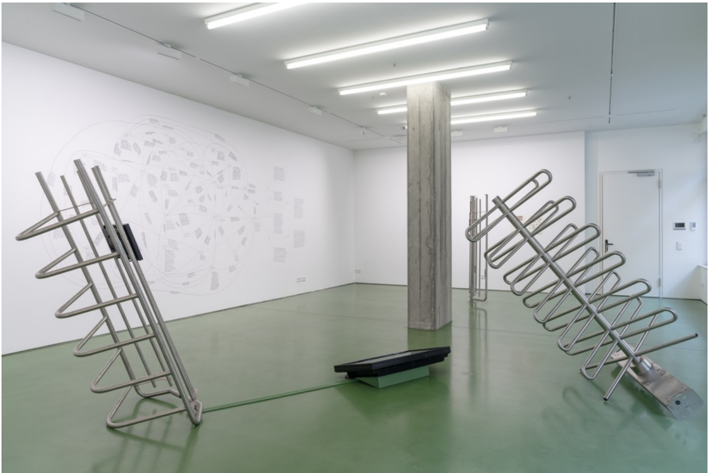
A Time in Pieces – on the occasion of Kyiv Perennial