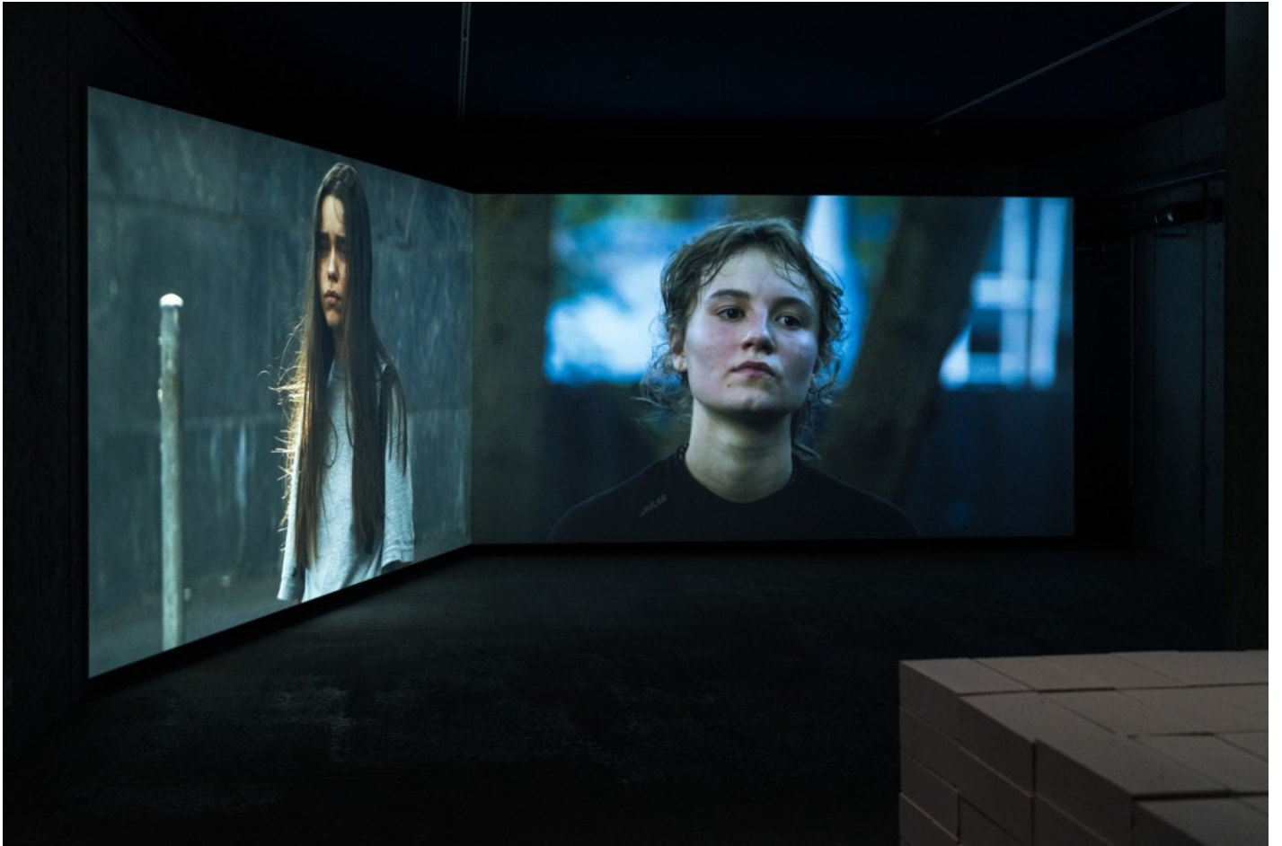
A Time in Pieces – on the occasion of Kyiv Perennial