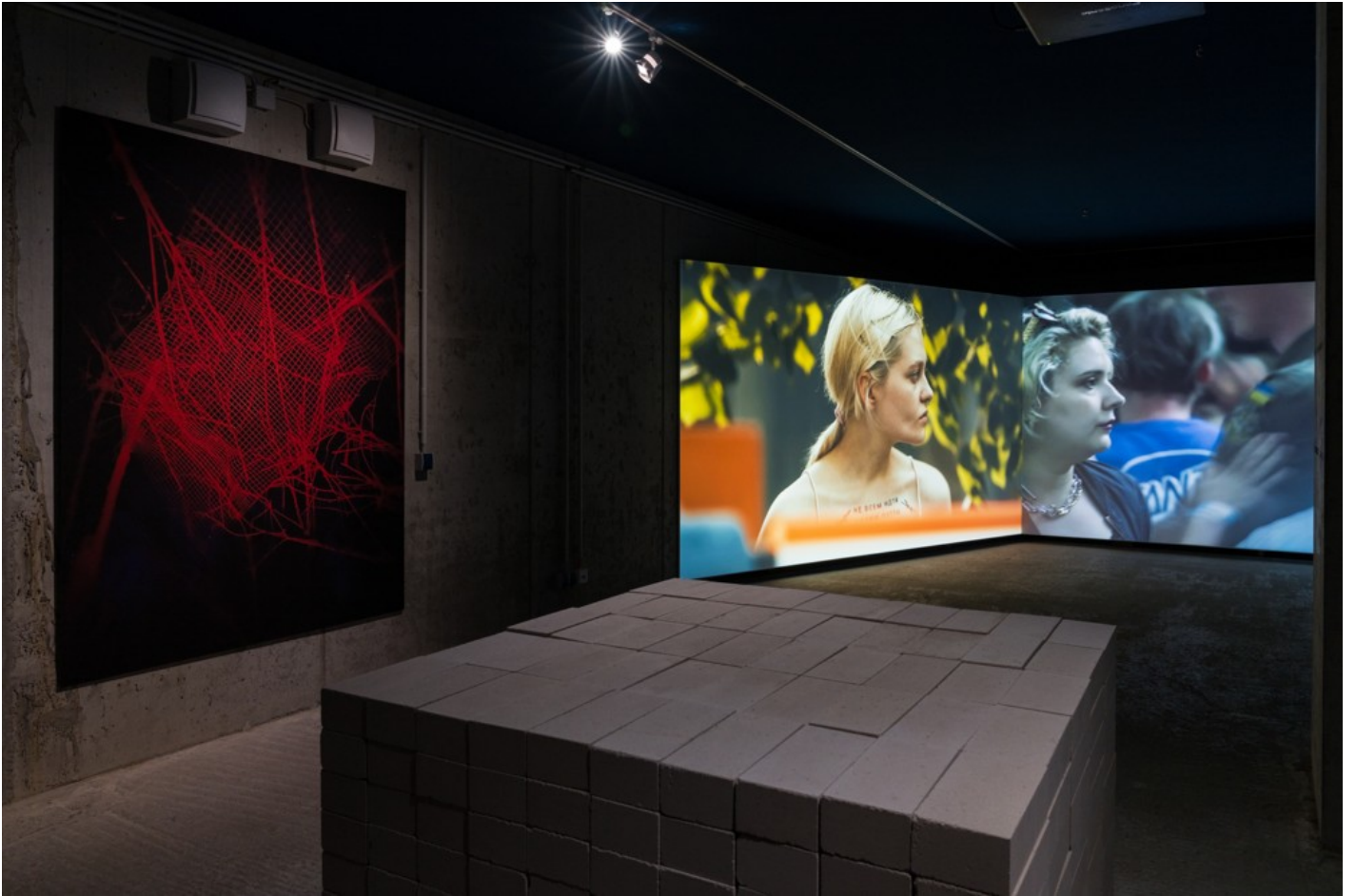
A Time in Pieces – on the occasion of Kyiv Perennial