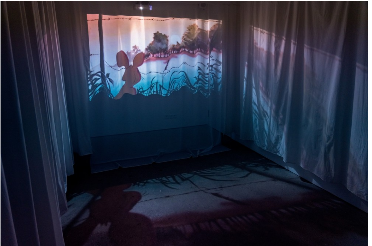
A Time in Pieces – on the occasion of Kyiv Perennial