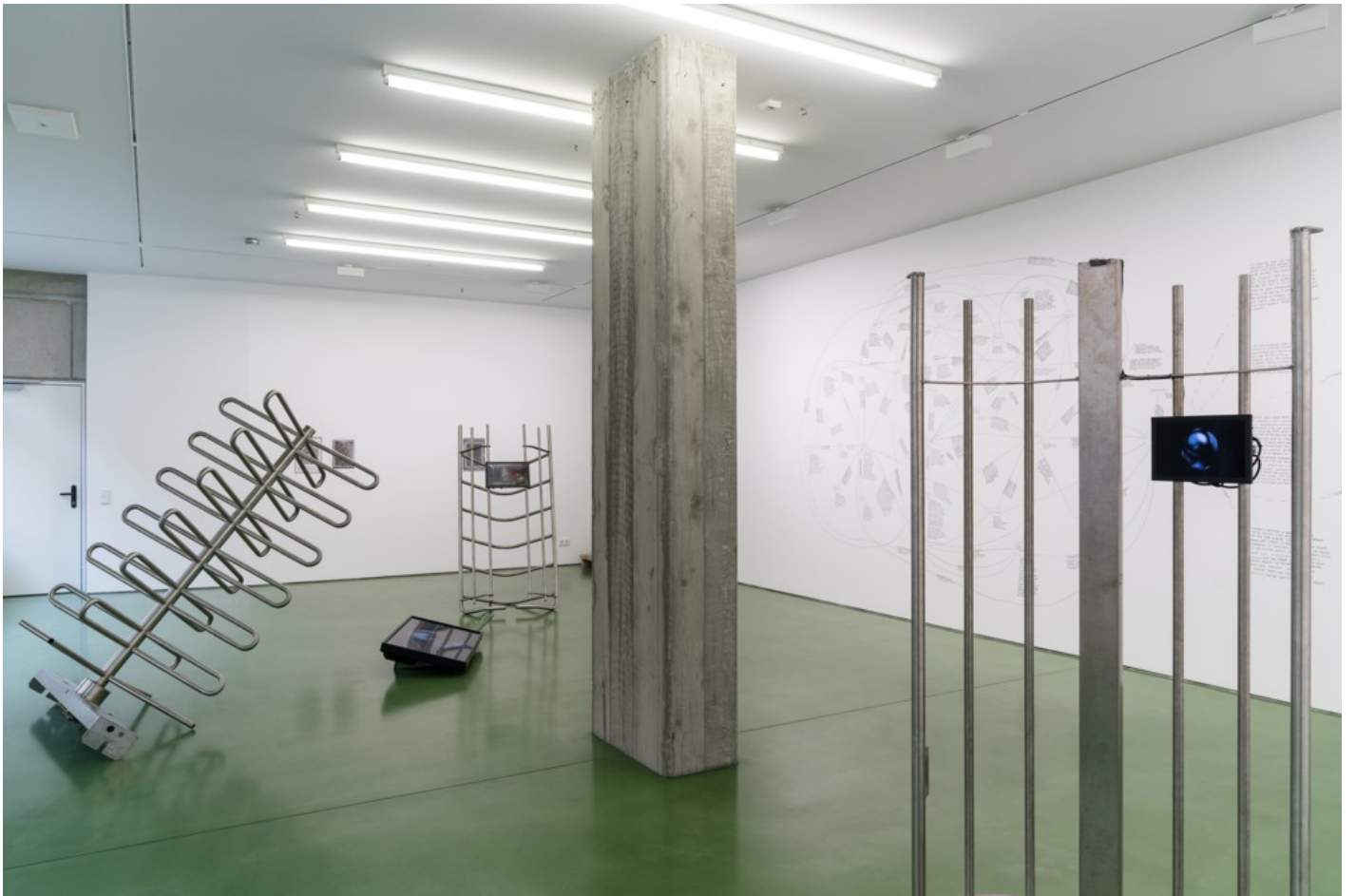
A Time in Pieces – on the occasion of Kyiv Perennial