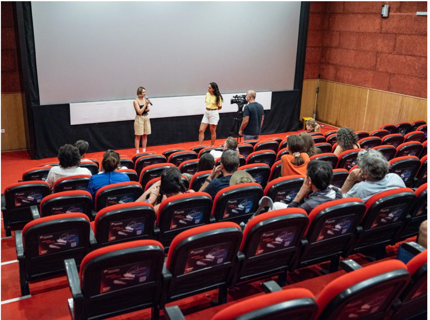
Focus Ukraine (Docudays at DokuFest)