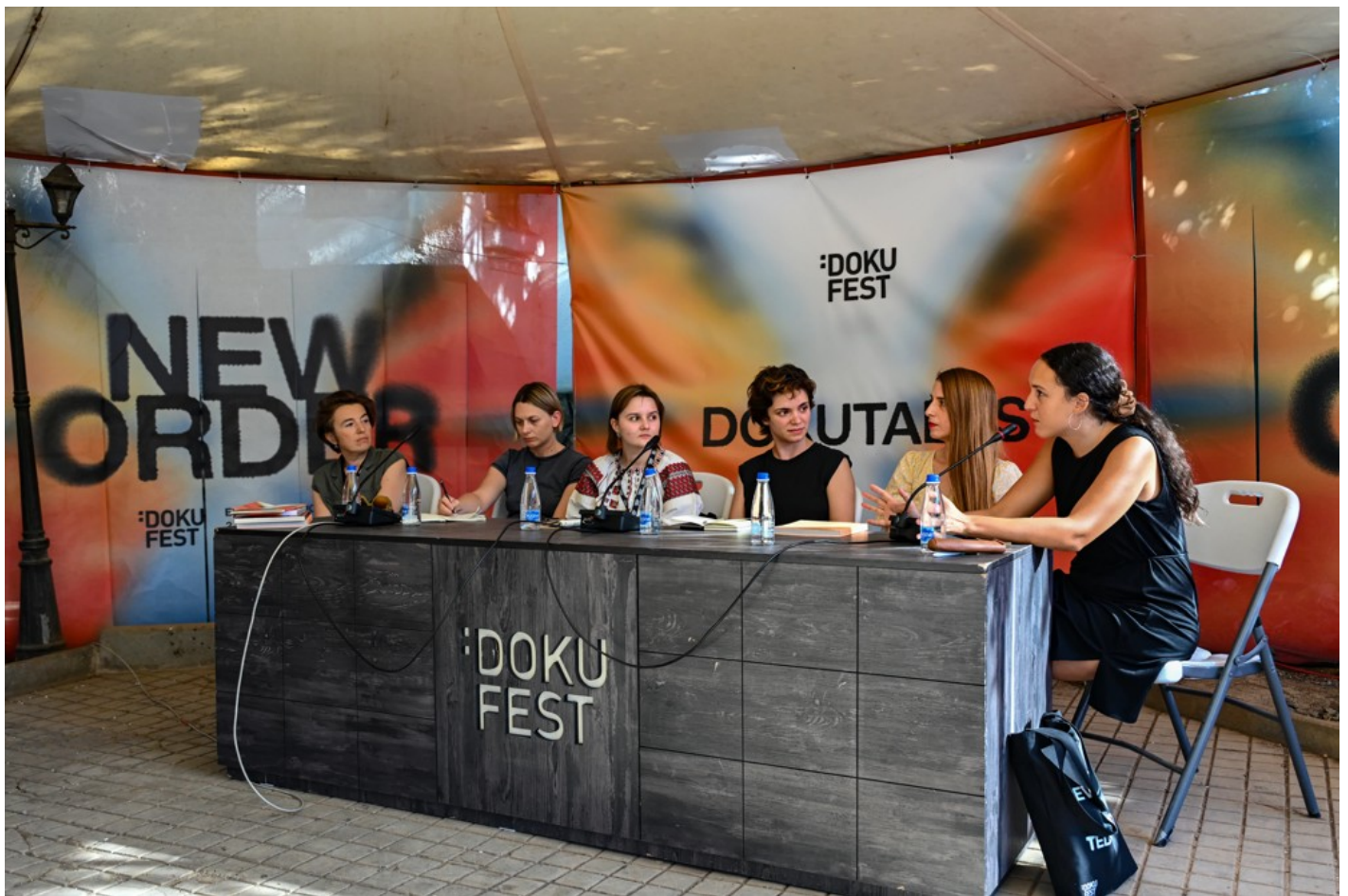
Focus Ukraine (Docudays at DokuFest)