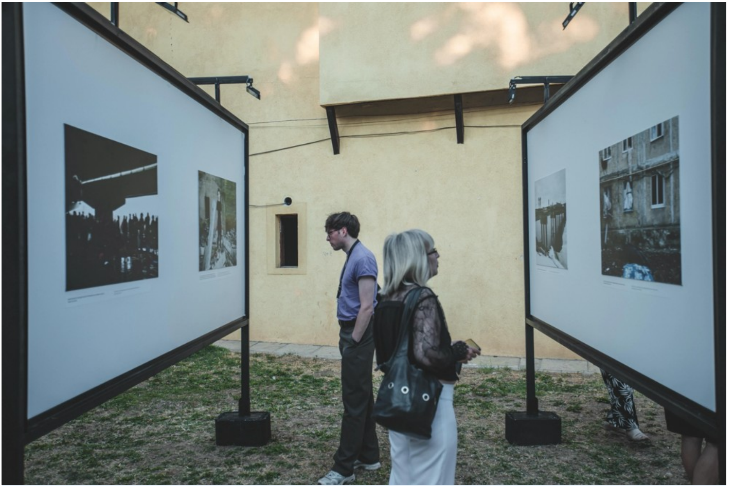
Focus Ukraine (Docudays at DokuFest)