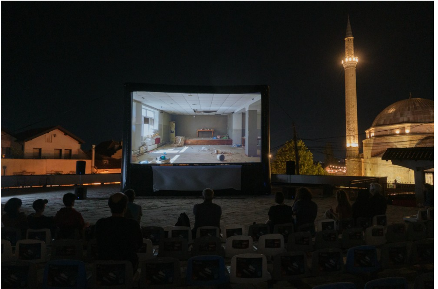
Focus Ukraine (Docudays at DokuFest)