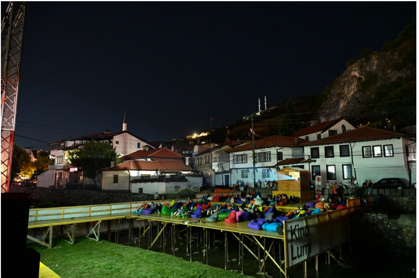
Focus Ukraine (Docudays at DokuFest)