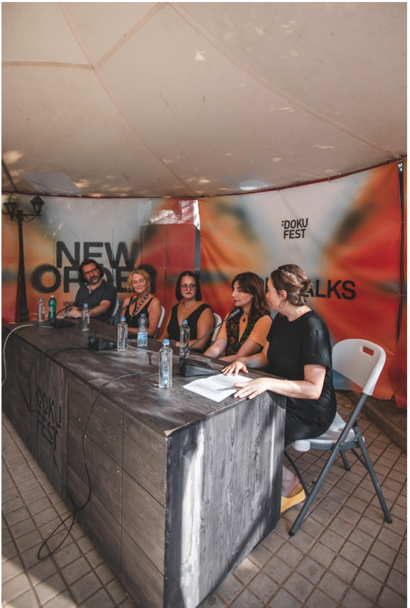
Focus Ukraine (Docudays at DokuFest)