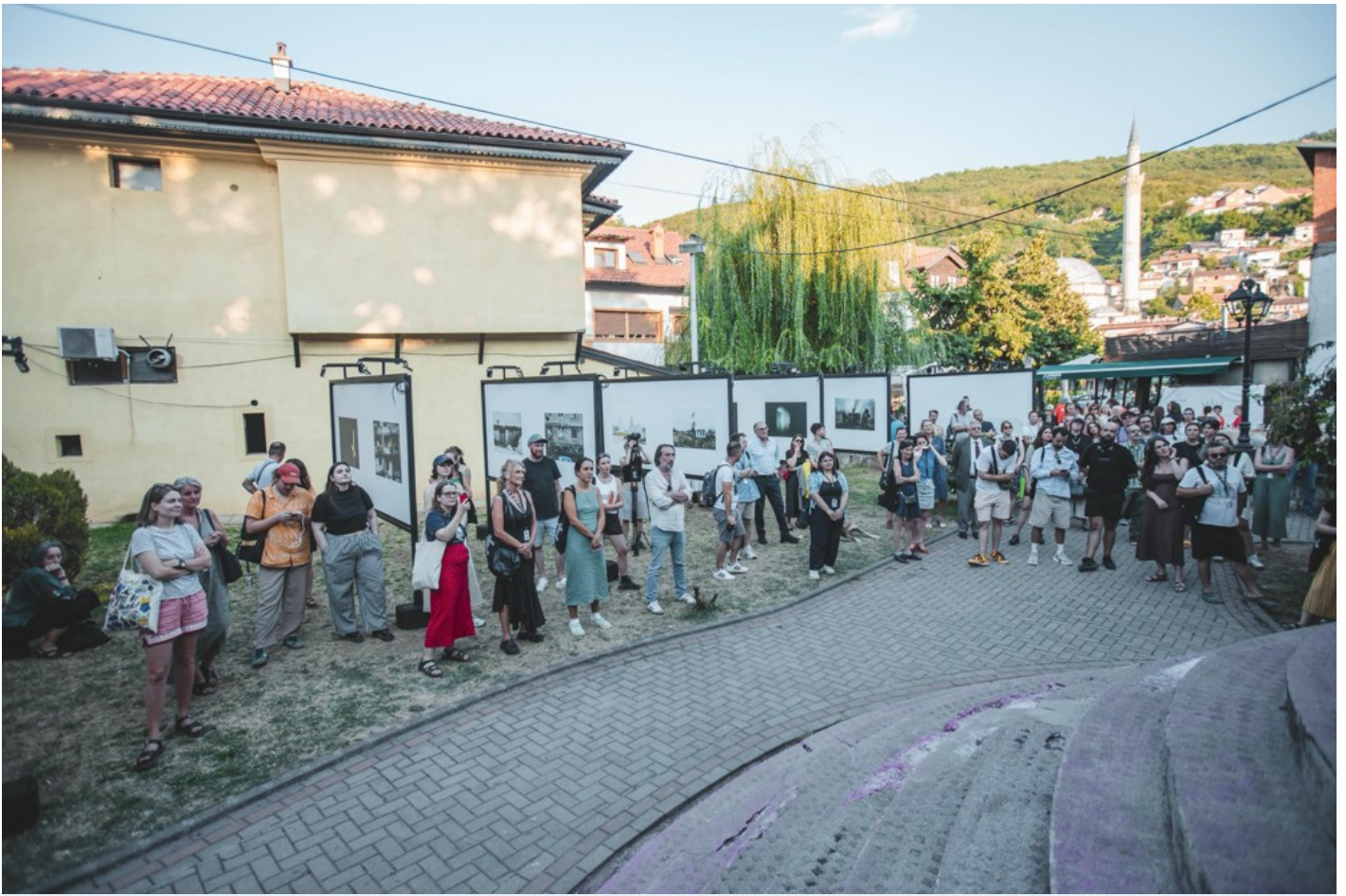
Focus Ukraine (Docudays at DokuFest)