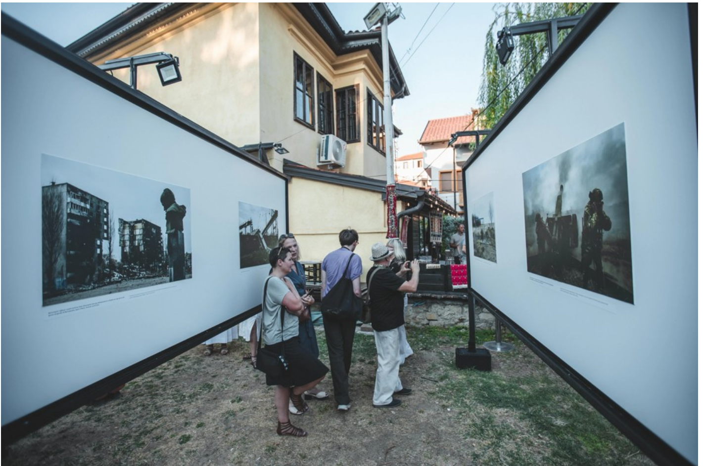
Focus Ukraine (Docudays at DokuFest)