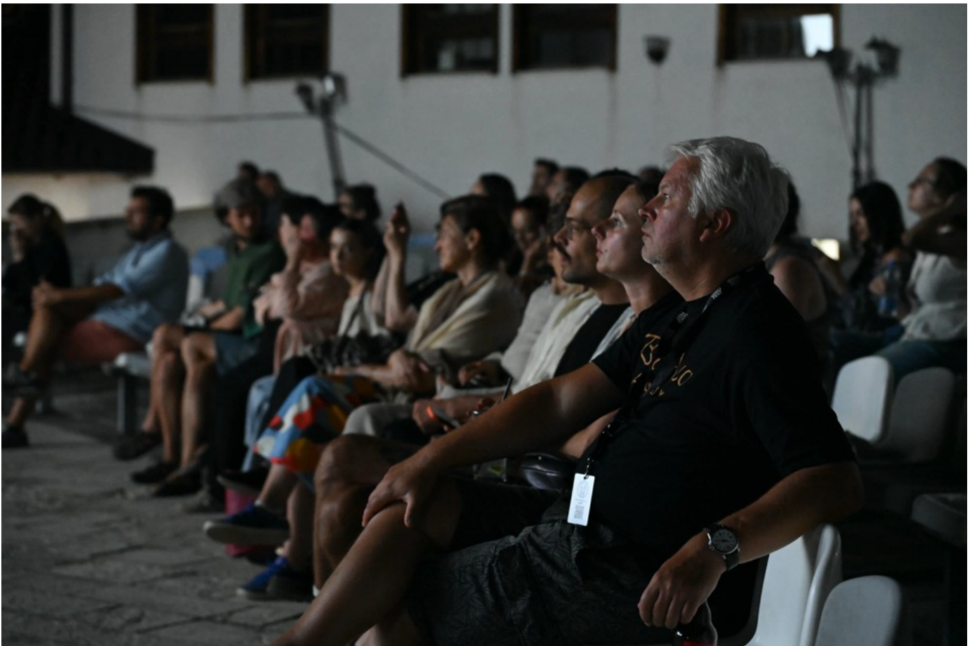
Focus Ukraine (Docudays at DokuFest)