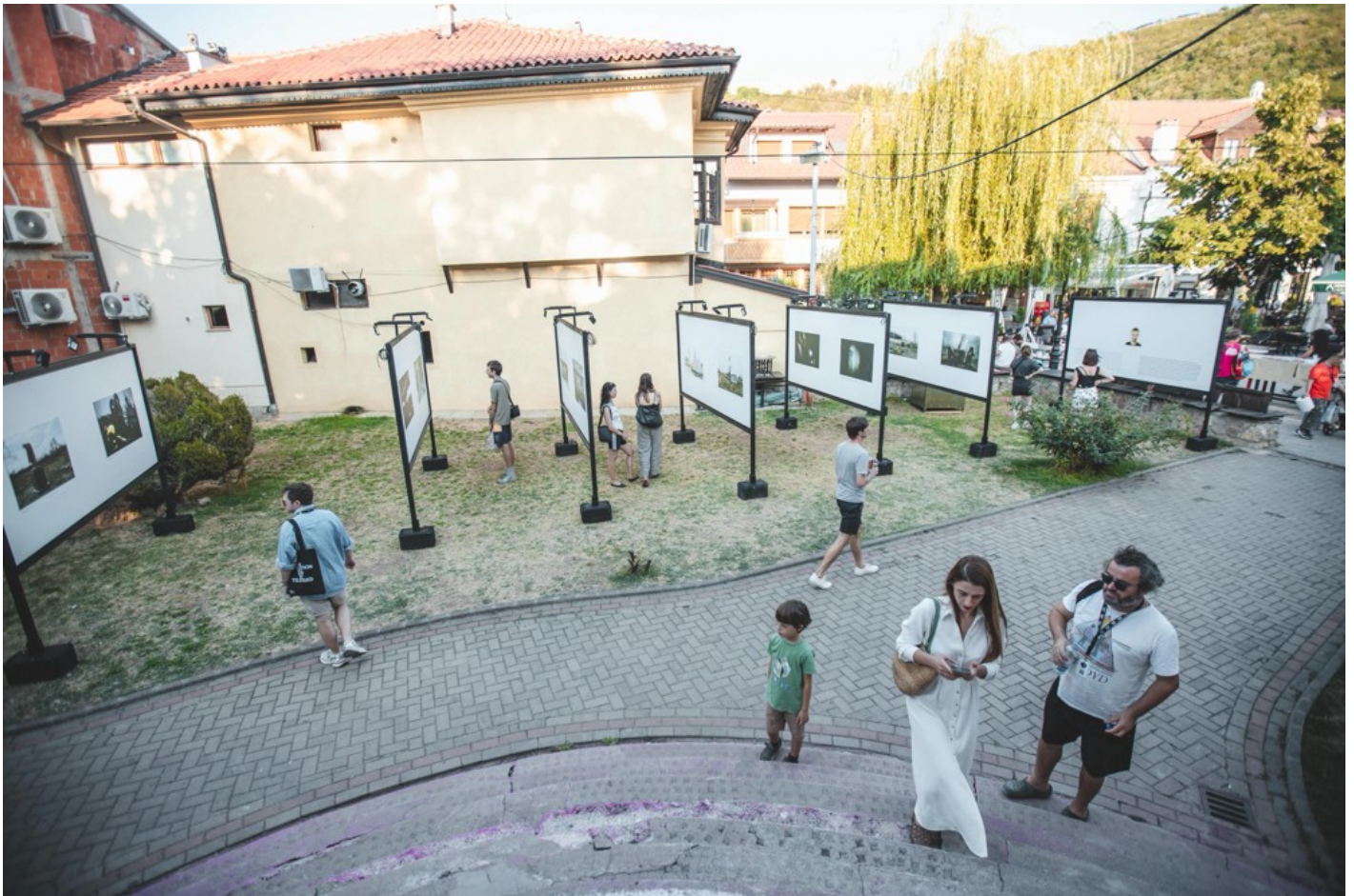
Focus Ukraine (Docudays at DokuFest)