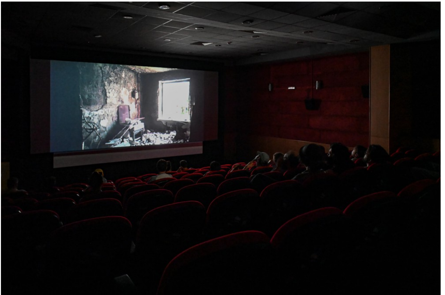
Focus Ukraine (Docudays at DokuFest)