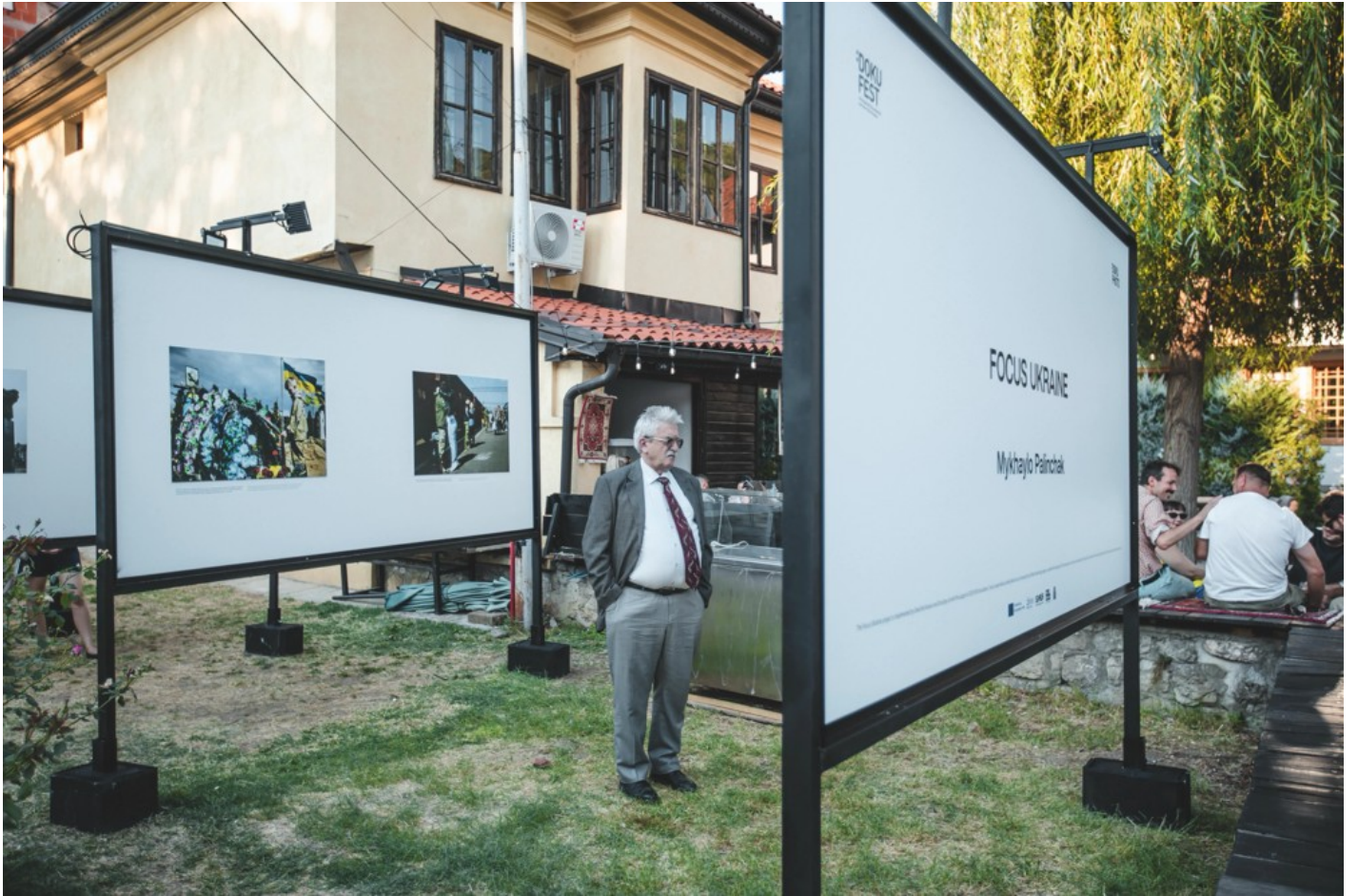
Focus Ukraine (Docudays at DokuFest)