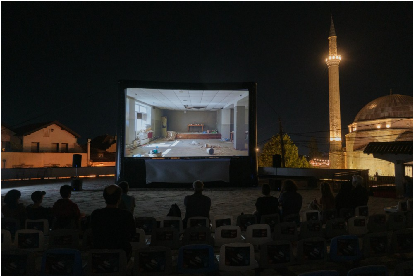
Focus Ukraine (Docudays at DokuFest)