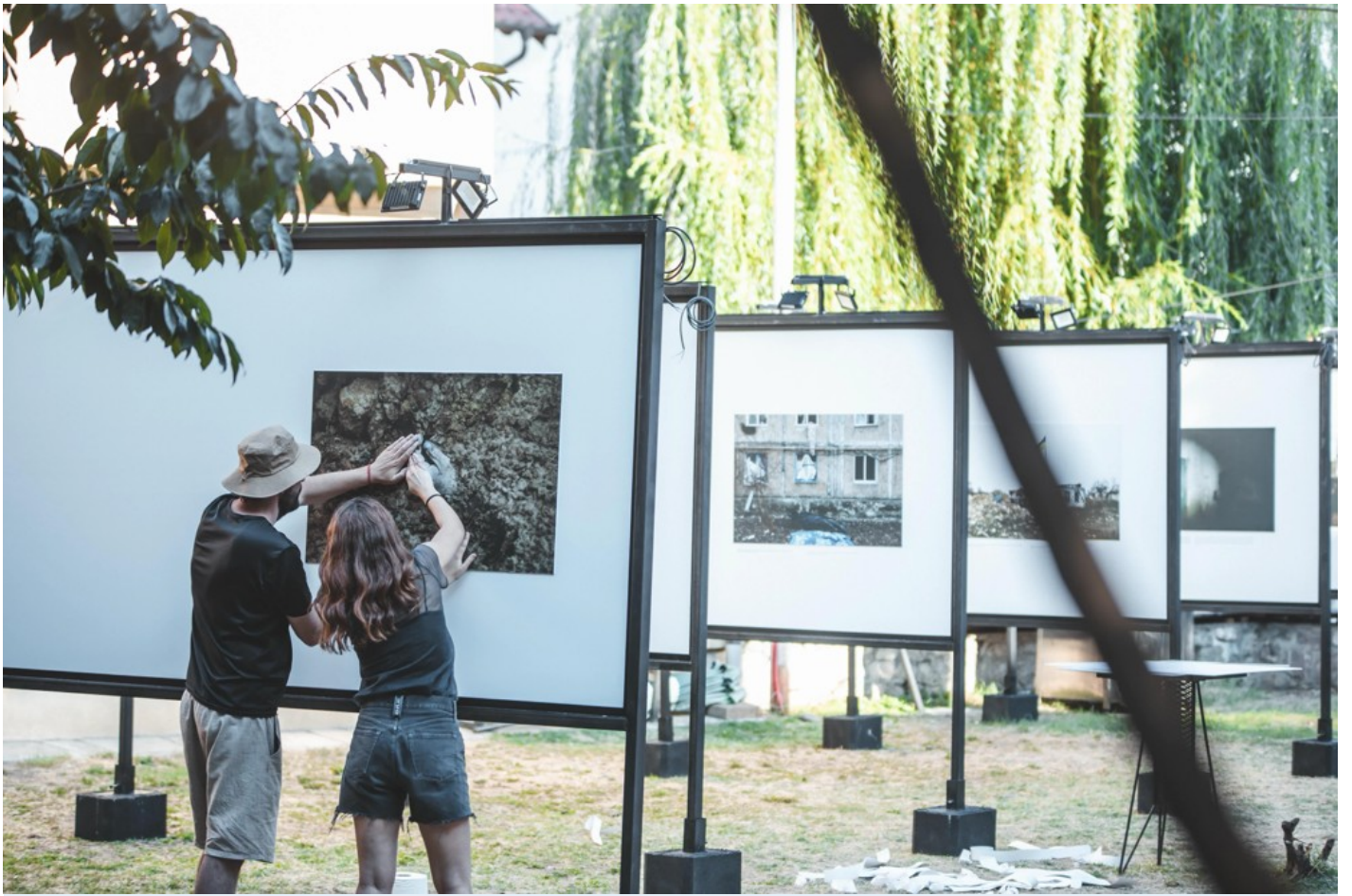
Focus Ukraine (Docudays at DokuFest)