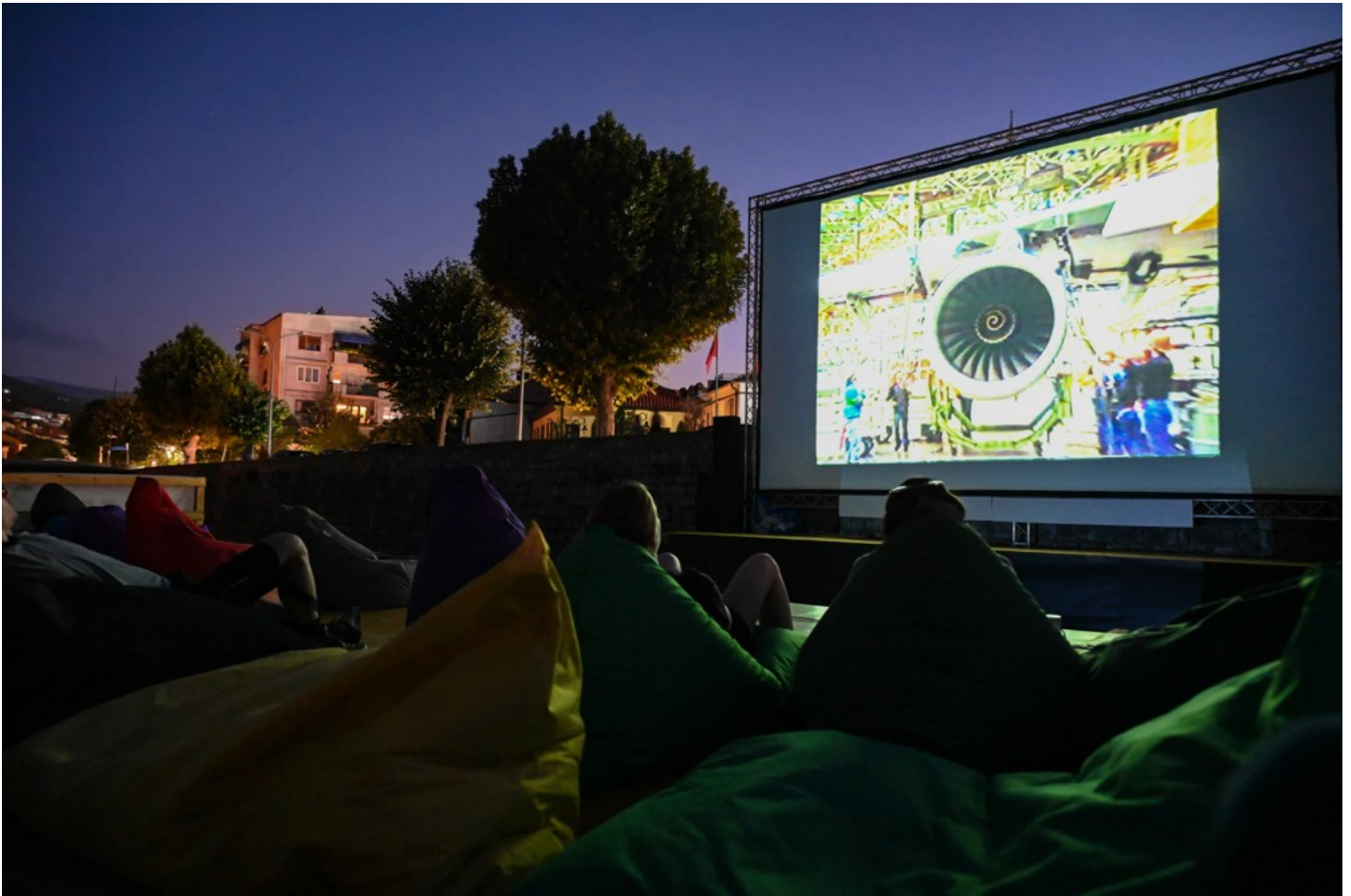
Focus Ukraine (Docudays at DokuFest)