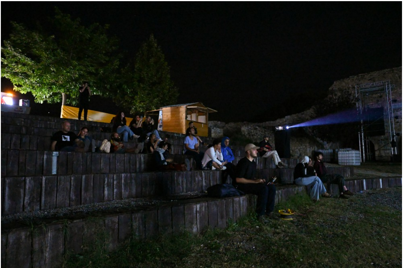
Focus Ukraine (Docudays at DokuFest)