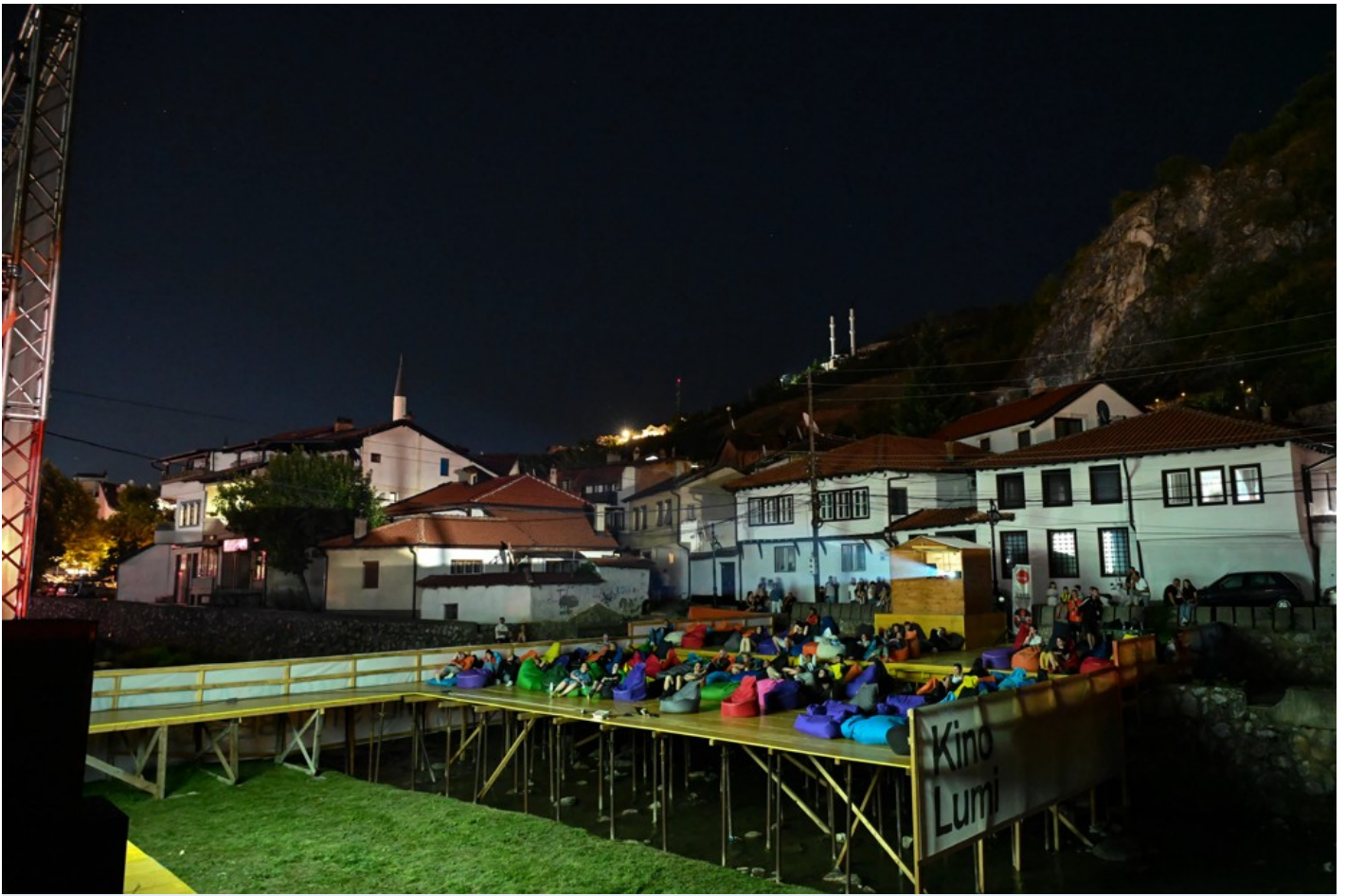
Focus Ukraine (Docudays at DokuFest)