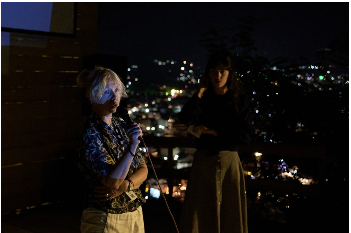
Focus Ukraine (Docudays at DokuFest)