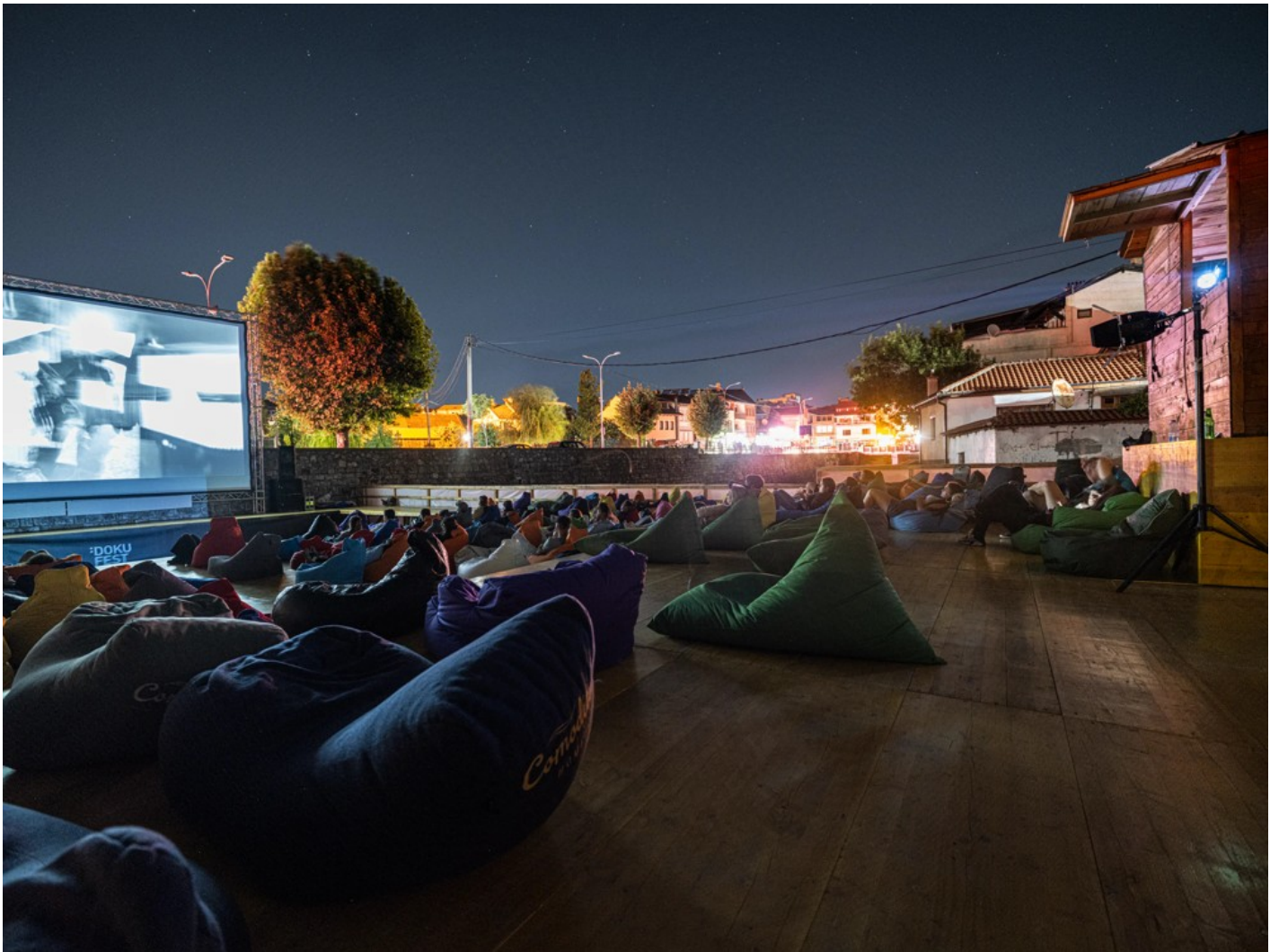
Focus Ukraine (Docudays at DokuFest)