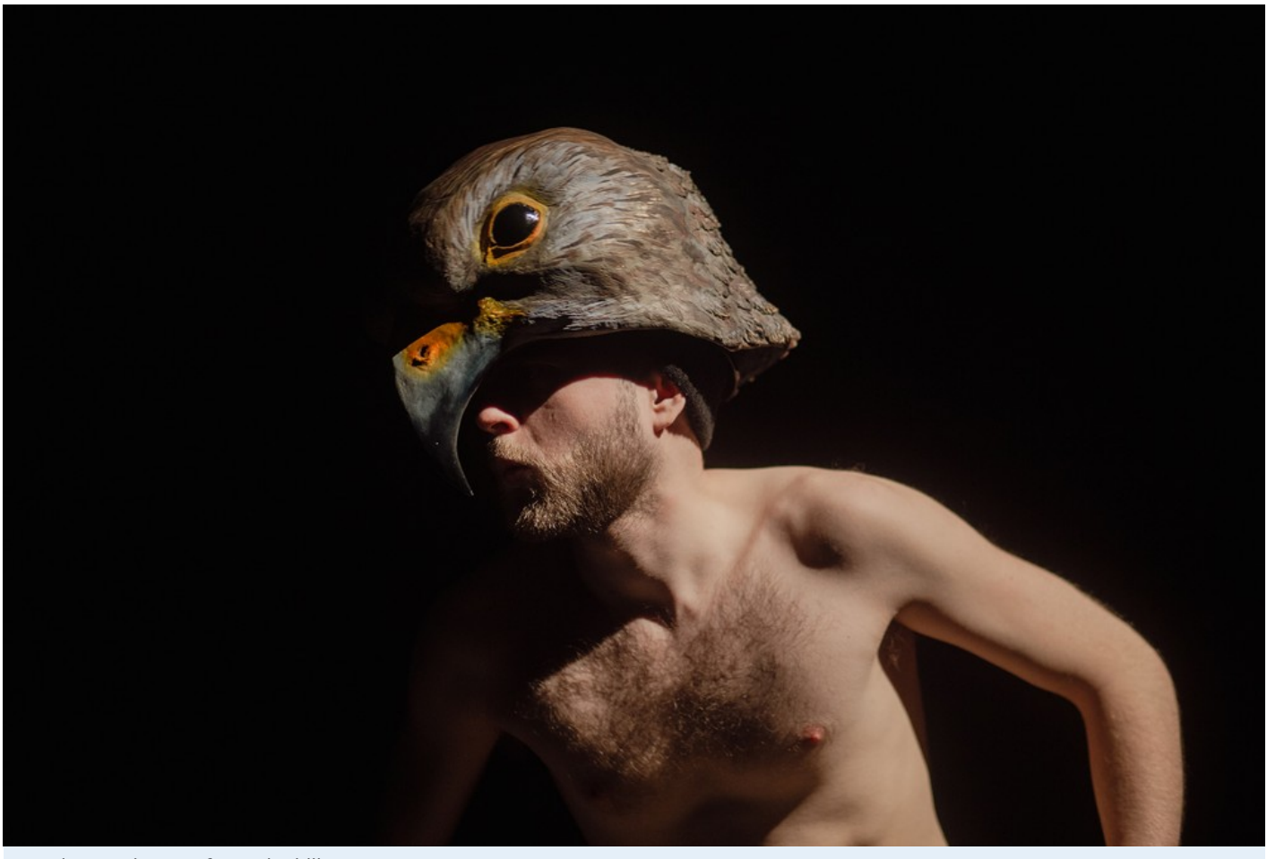
Ecodrama: the art of sustainability