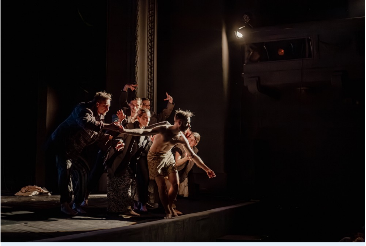
Ecodrama: the art of sustainability