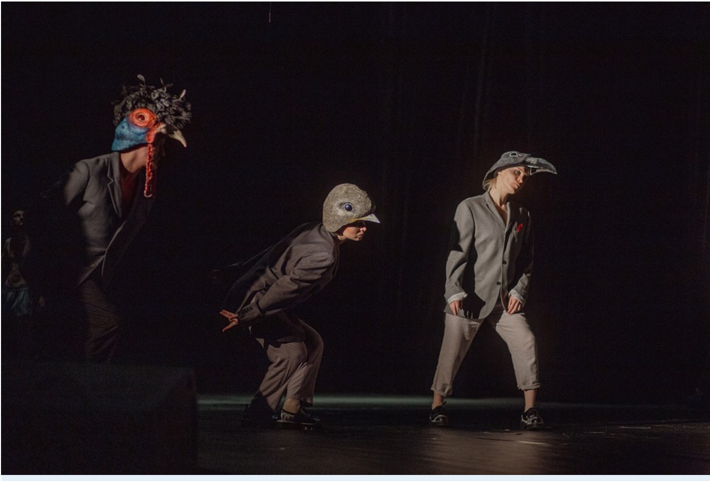
Ecodrama: the art of sustainability