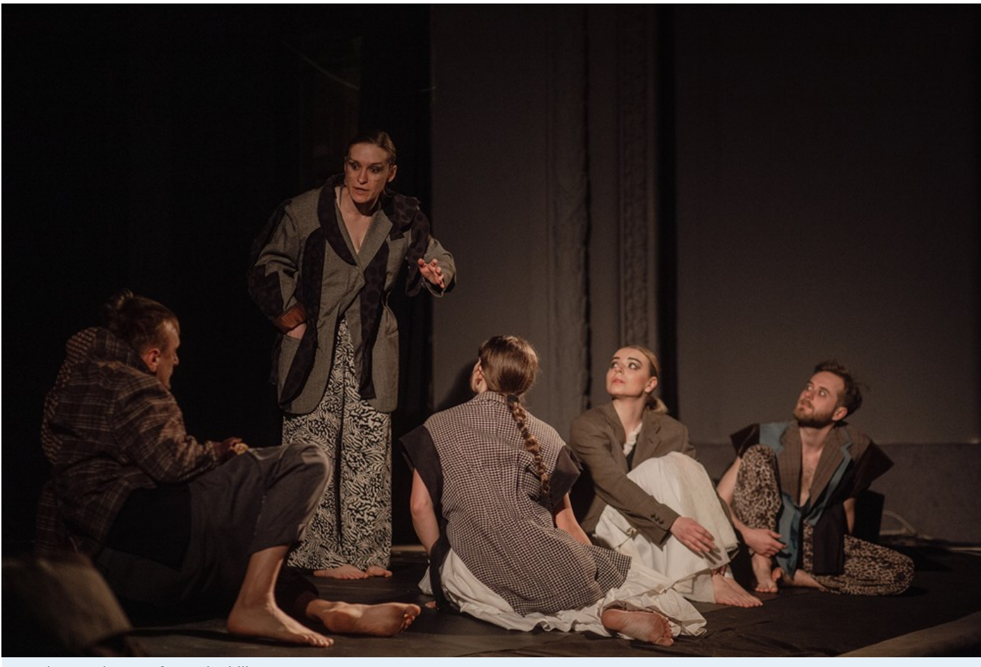
Ecodrama: the art of sustainability