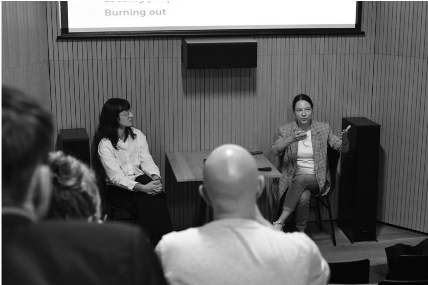
Becoming After Ruin