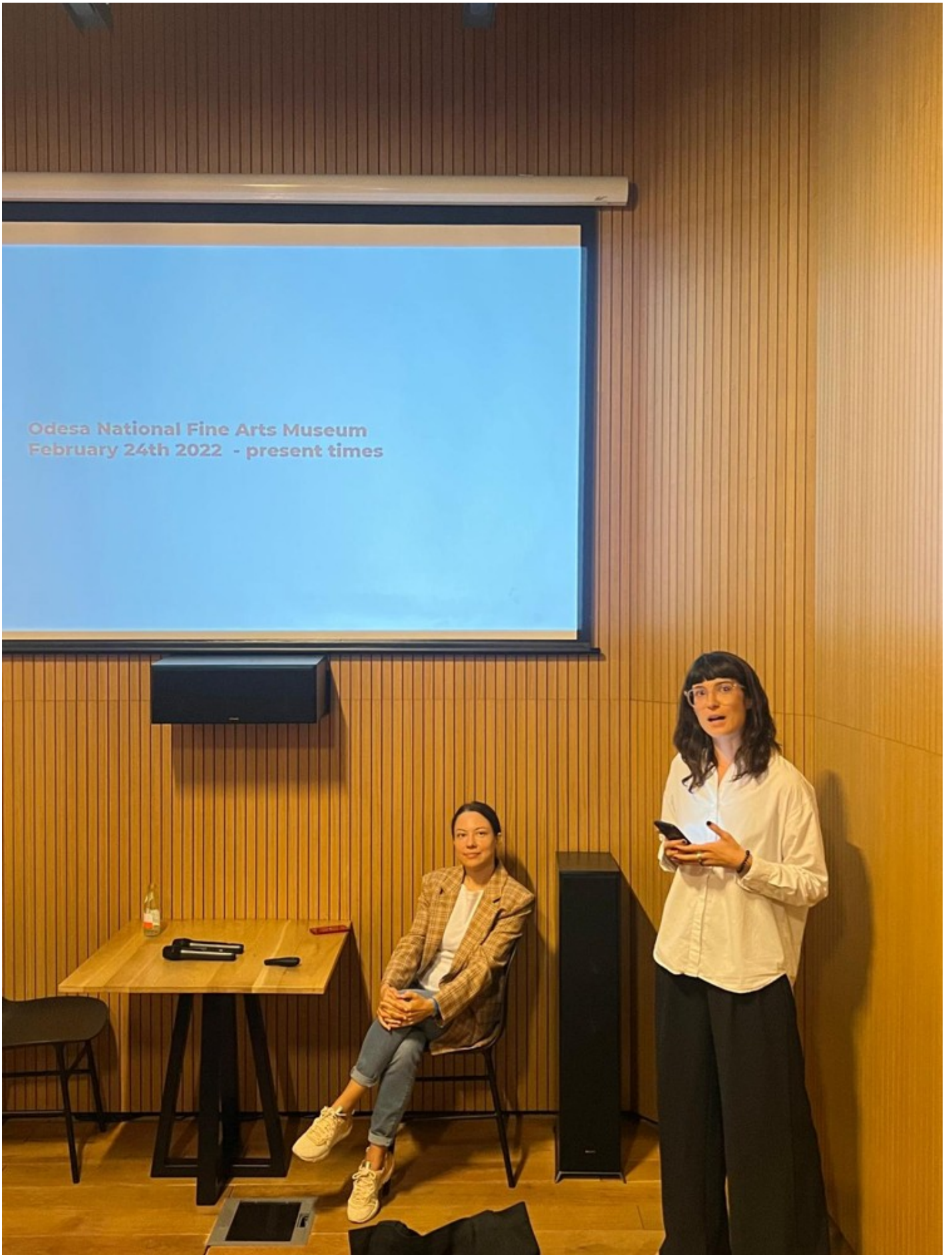
Becoming After Ruin