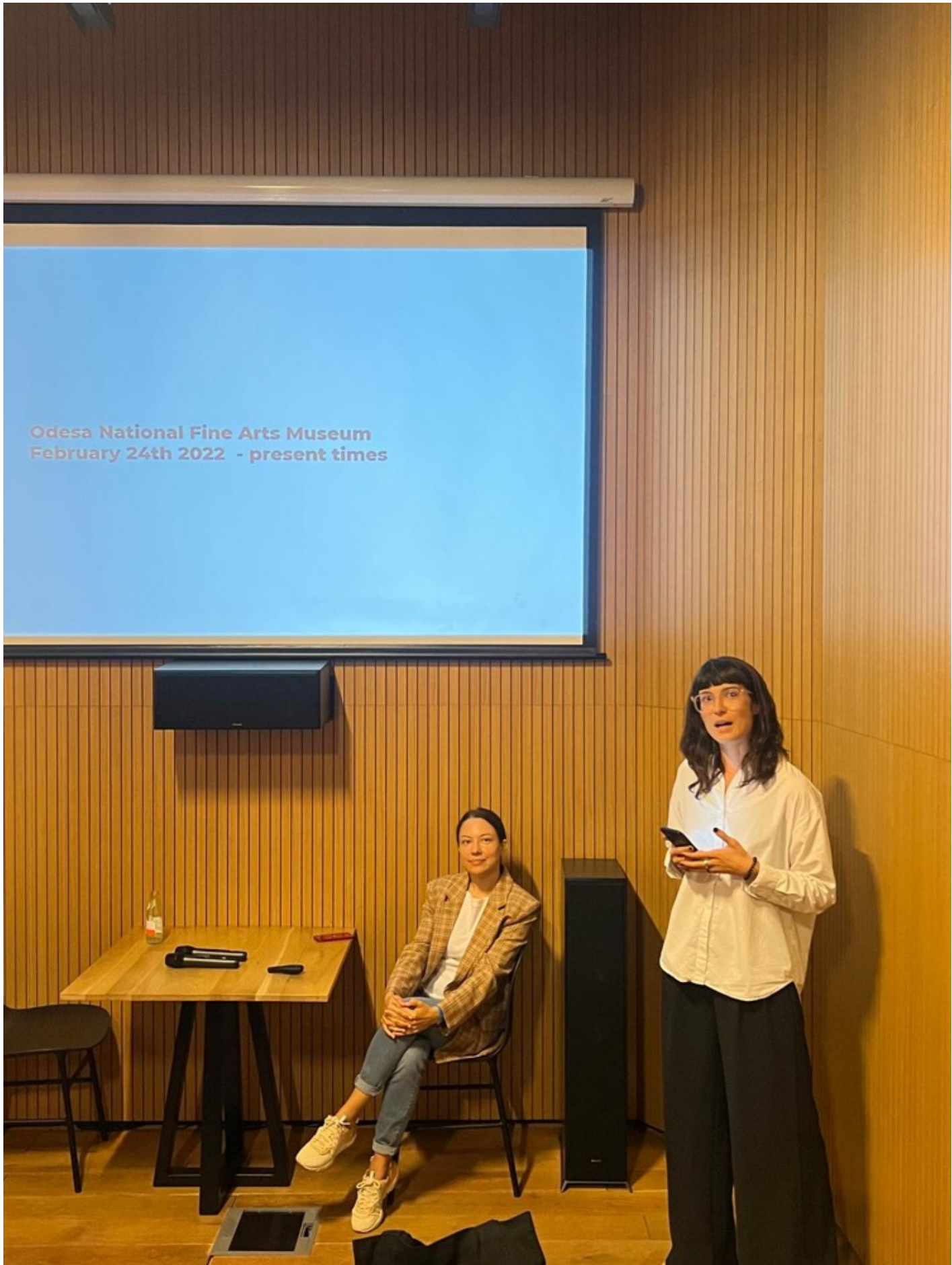
Becoming After Ruin