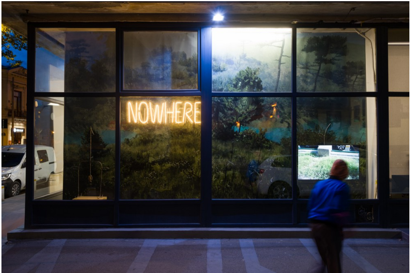
Becoming After Ruin