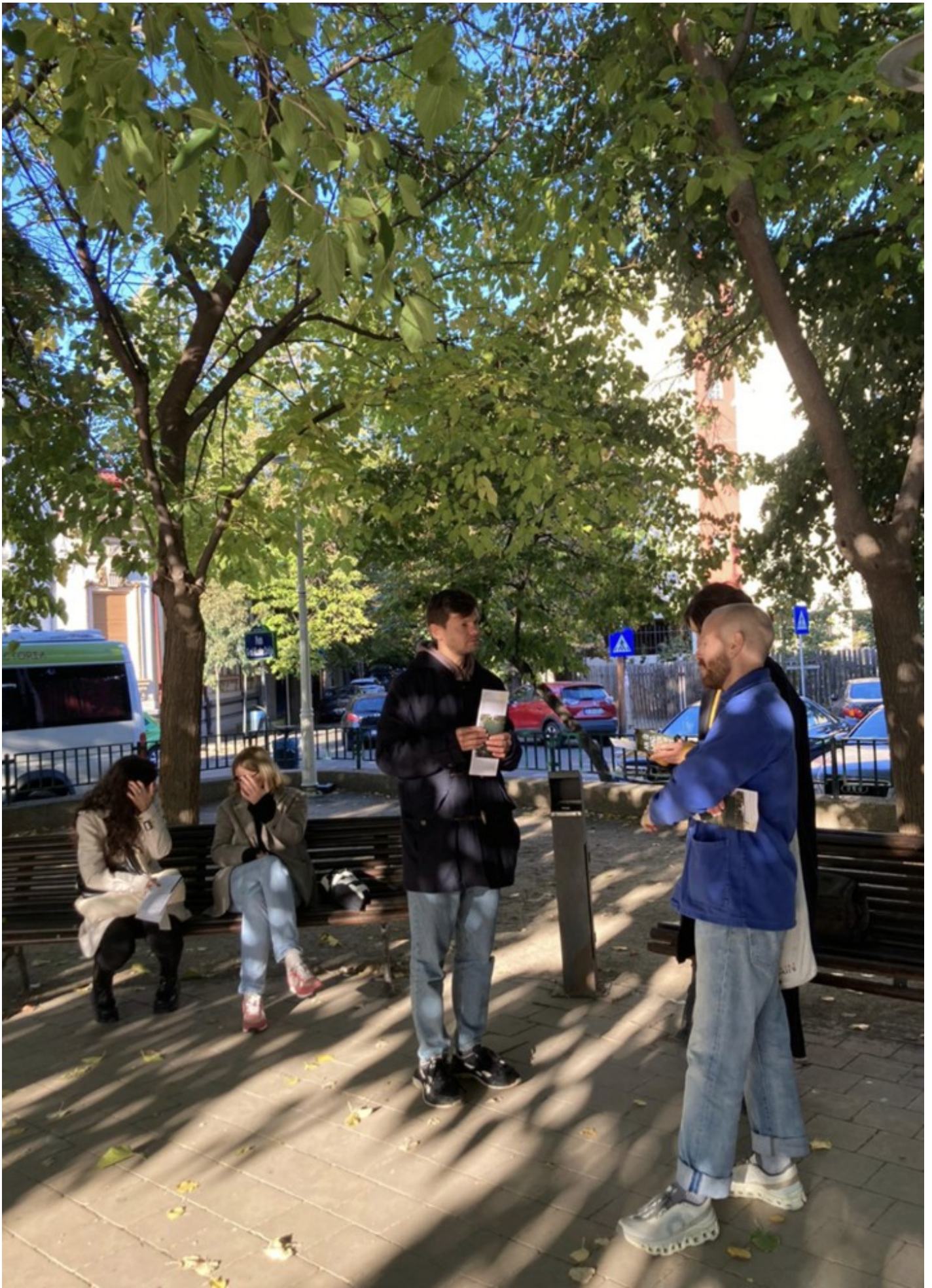
Becoming After Ruin