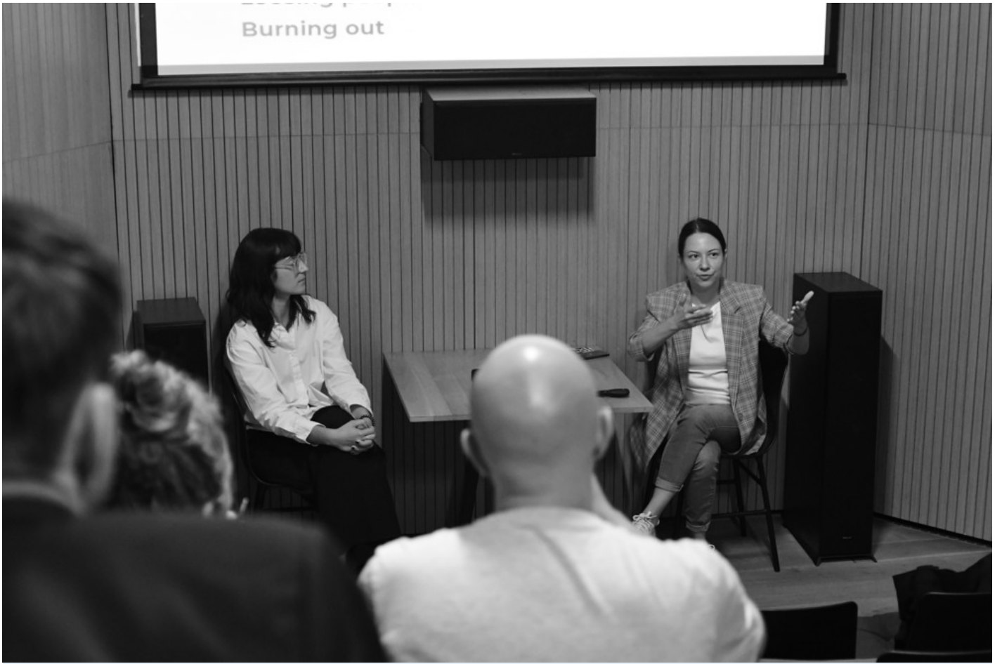
Becoming After Ruin