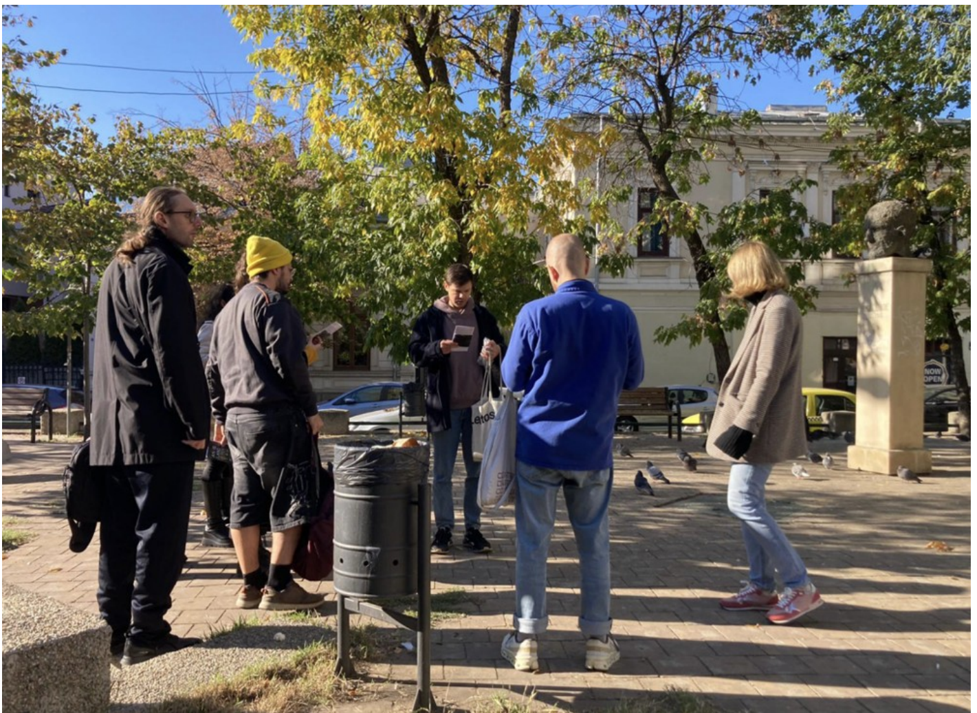
Becoming After Ruin