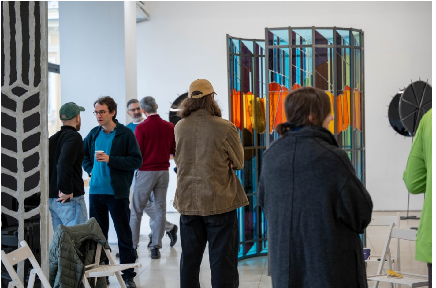
Becoming After Ruin