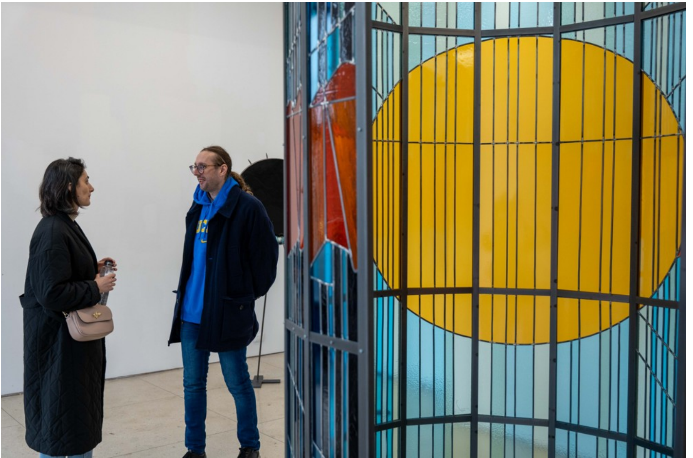
Becoming After Ruin